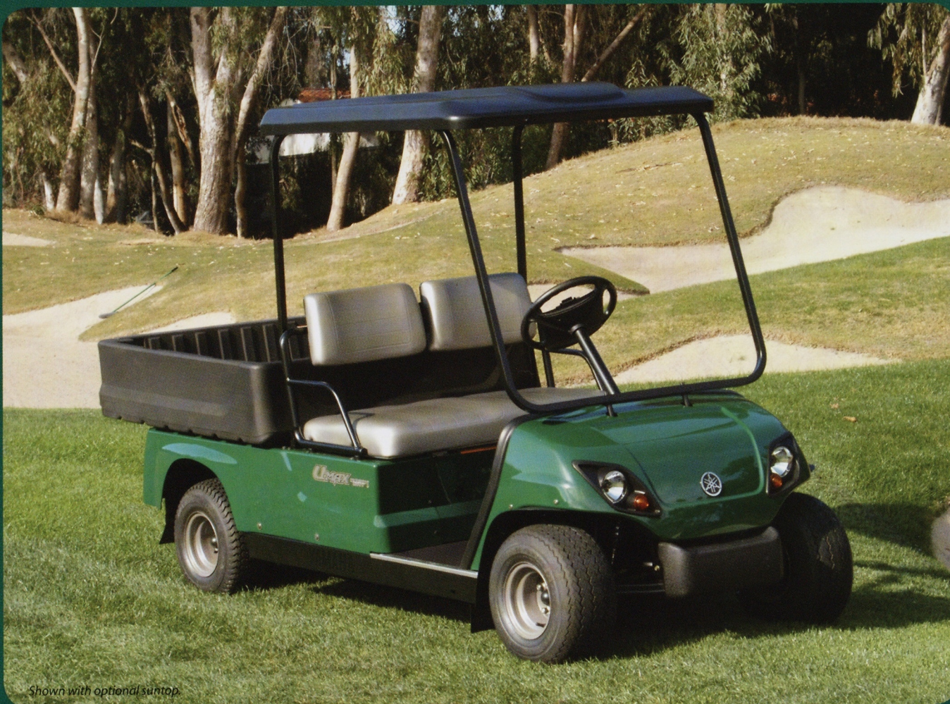
Shown with optional suntop.

Not only does the Yamaha U-MAX Medium Duty I Utility Vehicle carry a large payload, it also carries quite a reputation. The latest in a long line of precision engineered utility vehicles from Yamaha, the U-MAX sets the standard for others to follow.