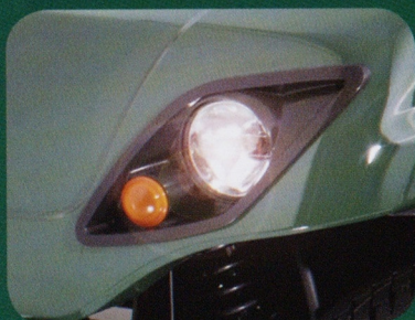
The U-Max comes with a tough tested headlight assembly that can be found on many Yamaha ATV's.