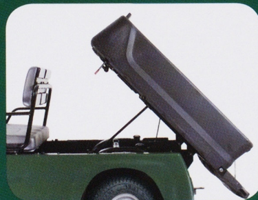
The utility dump bed comes with a folding tailgate, prop rod and hydraulic shock. Power dump optional.