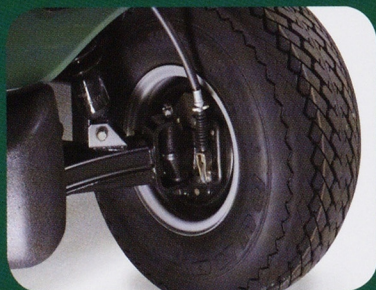
Self adjusting drum brakes on all 4 wheels allow you to stop and work anywhere.