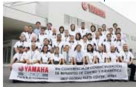
Latin American Parts Managers participated at the Global Parts Center (GPC) for the 5th Parts Marketing Conference