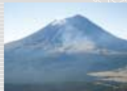
Popocatepetl means “smoking mountain”

Popocatepetl (commonly referred to as El Popo or Don Goyo) is one of the most active volcanoes in Mexico and the second highest peak (5,426 m) in Mexico after the Pico de Orizaba (5,636 m).