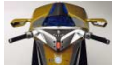
LUXAIR (Special display model/prototype): This is a "parallel hybrid" type motorcycle combining a liquid-cooled gasoline engine and an electric motor. It features a special audio system developed in collaboration with Yamaha Corp. (music).