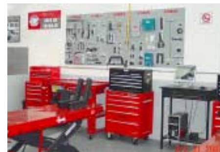
The Yamaha Technical Service Center (Centro de Servicio Técnico Yamaha in Spanish)

Called the Yamaha Technical Service Center, this state-of-the-art facility is the first of its kind in Mexico, and it was fully functional and began operations on August 28th, 2007, at the end of the nine-month project. Proof again that it takes time to make good things happen. In the constantly growing Mexican motorcycle and ATV markets, our costumers demand quality service provided by highly trained and specialized technicians.