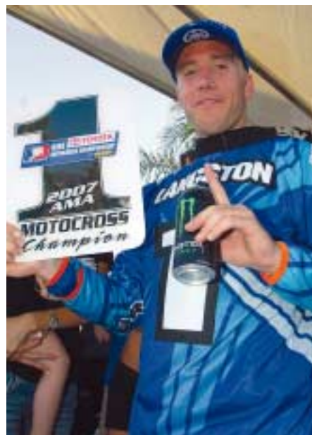
Yamaha has not captured the title in this category since Doug Henry did it on the YZ400F in 1998

This AMA Motocross Championship win made this season a truly memorable one for Langston and the YZ450F.