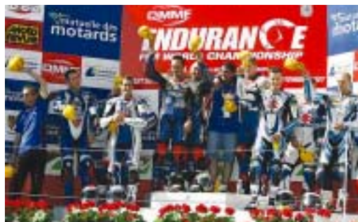
Yamaha GMT94 had a 10-lap lead at one point over the 2nd-place team. They ran a total of 801 laps to win.