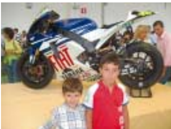
Kids and adults alike enjoyed the open house and a chance to see Rossi's M1 machine