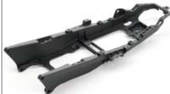
The new magnesium single-unit rear frame is roughly 20% lighter than its aluminum equivalent and contributes to better weight distribution in the chassis that improves handling performance

In addition to its lighter weight, magnesium is now the focus of attention as a next-generation material because of its abundance as a resource and excellent recycle-ability. Yamaha will continue to seek innovative new technologies and materials like this that add new value to our products.