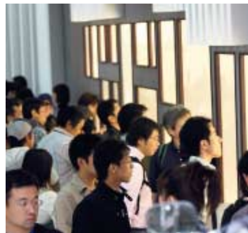
This is a presentation of Yamaha's proud exclusive technologies with artistic methods of display.