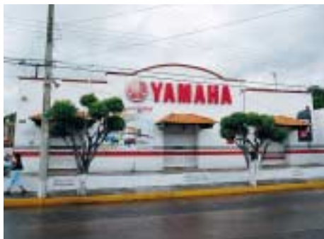
Motos Guerrero de Nayarit S.A de C.V.