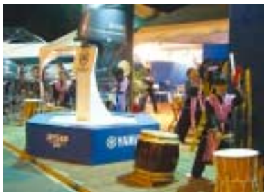
Performances by Japanese drummers were one of the added attractions at the Yamaha booth

From the 20th to the 30th of September, the "Salon Nautico" was held in the Argentine capital of Buenos Aires. This biennial show is Argentina's most important for the marine industry and it attracted approximately 35,000 visitors over its 11-day run.