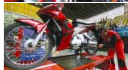
The practical skills part of the contest tested the contestants skills and process in the two areas of pre-delivery bike inspection and troubleshooting a malfunctioning machine