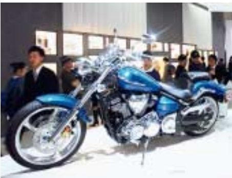
XV1900 Raider S (Special display model): This is a factory customized machine taking as its base power unit the engine of the Roadliner. It represents a flagship for the Yamaha custom style cruisers.