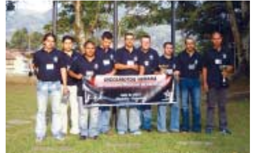
The ten contestants in the Colombian National Technicians Contest of Yamaha service technicians