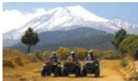
Yamaha Adventure and X-Touring events are popular among ATV owners

travel and the conditions of the roads. Another important promotional program is our Yamaha Riding School (EMY), where customers-to-be have the opportunity to get to know our products first-hand, learn how to use them and enjoy them. This program also gives us the opportunity to point users toward the ideal motorcycle to suit their needs.