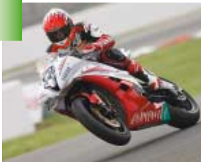
Parkes raced another superb season like 2004 to take 2nd place in the rankings

Broc Parkes put up a good fight in the eleventh race in Germany to win and move into 3rd in the rankings. Then he battled hard in the twelfth race in Italy for 4th. With the 2nd ranking rider Fabien Foret's (Kawasaki) low finish of 14th place, Parkes succeeded in narrowing the gap all of a sudden to 15 points. In the final race of the season, he captured 2nd for a podium finish, to pull ahead of Foret and finish the season 2nd in the ranking.