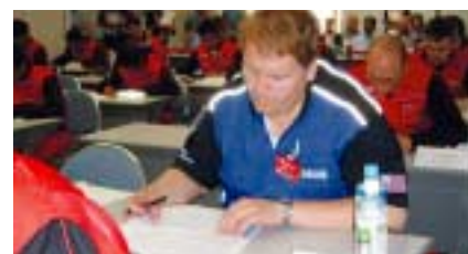
The written test contained questions in knowledge about tools and troubleshooting methods

clear reflection of the passion that they bring to their daily service work and their desire to satisfy their customers and be the ones that they trust.