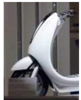
C3+ (Special display model/prototype): This is a "minimum electric commuter" model with an easy to handle, compact design focused on stylish riding and convenient features like a helmet storage compartment.