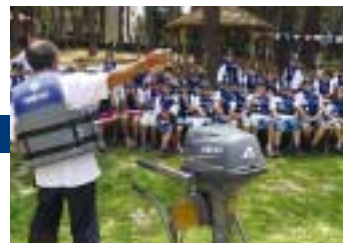
Young participants learn the basics of boating so they can go out on the water for the first time

The Yamaha Marine Department of Burla Makina Ticareti ve Yatirim A.S. is promoting a campaign to build interest and demand in the marine leisure sector in Turkey, a country where very few people enjoy the sea despite the country's more than 8,000 km of beautiful coastline. Named "From 7 to 70, Lets Go To Sea," this project is targeted at children, adolescents and adults who have not yet seen the sea or been involved with it in a positive way. The campaign, now in its third year, offers training with the help of expert personnel from Turkey's "Emergency Marine Search & Rescue Team" (DAK/SAR) in the areas of basic boating skills, safety and navigation so that they can be taken to the sea and learn to enjoy it. This summer three training programs were held in June in Antalya, Bodrum and Istanbul.