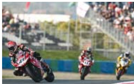
Haga pulled within two points of the leader for a bittersweet 2nd in the season ranking

Corser finished 3rd in race 1 on the last day for a place on the podium and contributed to the 28-point lead that brought the Manufacturers Title to Yamaha.