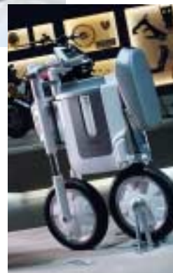
BOBBY (Special display model/prototype): This electric commuter model features a collapsible seat and fold-in rear wheel, handlebars and footrests to enable compact storage.