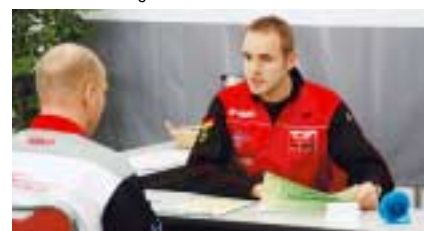
The third part of the contest tested the service people's customer handling skills in the situation of a customer bringing in a machine for repairs