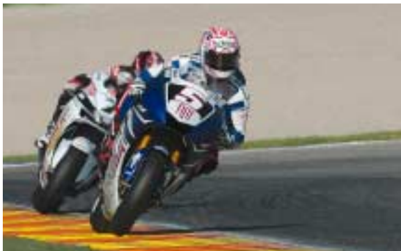
Edwards began riding for the Yamaha factory team in 2005 and finished 4th that year. The following year he put up a good fight for 7th

Yamaha's fervent attempt to recapture the 2007 MotoGP championship ended. Much to his chagrin, Valentino Rossi was ranked 3rd; Colin Edwards 9th. Casey Stoner (Ducati) had captured the season title.