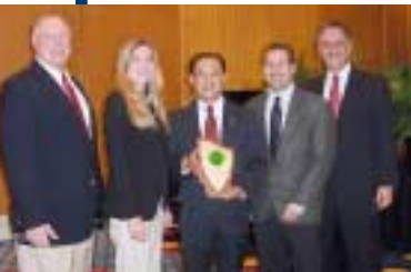
YMMC wins the Natural Leader eco award