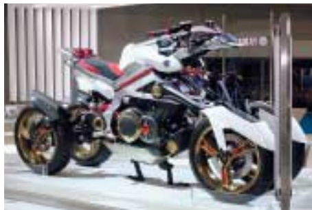
Tesseract (Special display model/prototype): This 4-wheeled vehicle is powered by a hybrid system combining a liquid-cooled V-twin gasoline engine and an electric motor. It is an innovative matching of the handling, compactness and maneuverability of a motorcycle with the stability of a 4-wheeled vehicle.