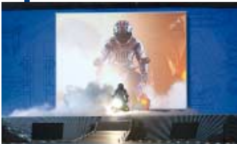
Fiat Yamaha MotoGP star Colin Edwards rode onstage to present the all-new YZF-R6 at the YMUS dealer meeting