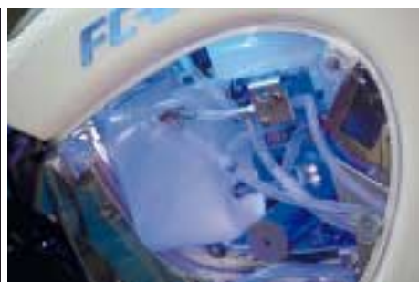
Smart Power: Yamaha's "Smart Power" concept aims at the development of new power sources for vehicles of the future. The vehicles that Yamaha is creating for the future are based environment-conscious concepts and technologies and strive at the same time to open up new horizons of riding enjoyment and excitement.