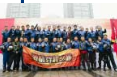
The YES! Rally attracted lots of attention with the new YBR250 and C8 models and import models like the YZF-R1