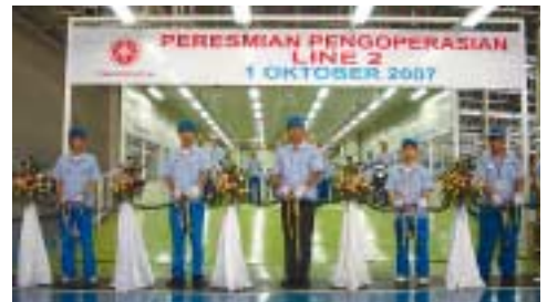
At the opening ceremony for YMMWJ's second production line

On October 1, production was started as scheduled at the new line 2 assembly facility of PT. Yamaha Motor Manufacturing West Java (YMMWJ) thanks to the efforts of the many people involved. The start of production at the company's second assembly line adds another 400,000 units of annual motorcycle production capacity for a company total of 800,000. Under a guiding motto of “Quality First,” YMMWJ will continue to increase production capacity with measures that will include construction of a new factory while also introducing new models that answer expanding market needs.