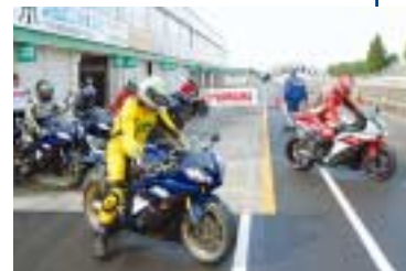
Many participants said "Yamaha's popularity is due in large part to the painstaking attention paid to detail in its products"

Some 89 participants from 20 countries took part during the four days. Yamaha Motor Europe N.V. (YMENV) kicked off the festivities by giving a presentation outlining the features of the new R6, and then the test rides began. The riders exchanged impressions at a fast and furious pace and nearly everyone gave the R6 high marks for its design and ease of handling.