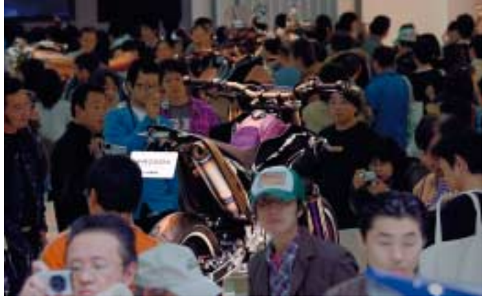
Displays that show what should be seen: The machines that show the future directions Yamaha is taking were displayed in a way that could be seen from all angles.