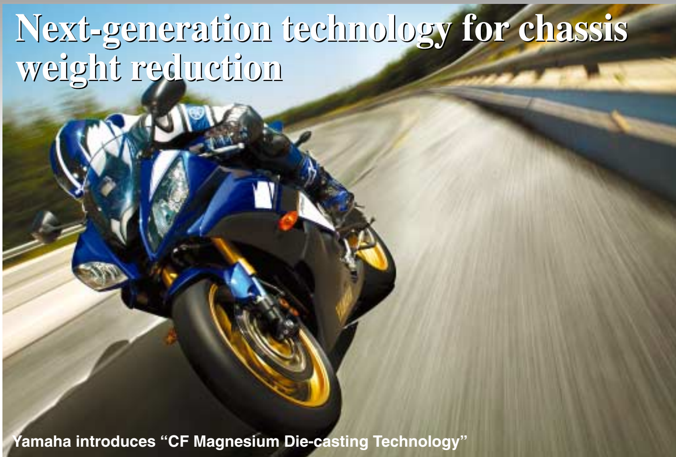
Yamaha introduces “CF Magnesium Die-casting Technology”

In September, Yamaha Motor Co., Ltd. introduced its ground-breaking new “CF (Controlled Filling) Magnesium Die-casting Technology” that now makes it possible to cast large, thin-walled chassis parts from high-quality magnesium. A rear frame manufactured by this new casting method has been mounted on the 2008 model YZF-R6, making it the first application in the world of such a magnesium frame part on a production motorcycle. Magnesium is one of the lightest of all usable metals, and the use of this new casting technology enables significant weight reduction in the motorcycle chassis. Also, being able to reduce the weight of a part like the rear frame which is far from the machine’s center of gravity improves the concentration of machine mass, which in turn contributes to better handling performance. The new 2008 model YZF-R6 with this magnesium rear frame was unveiled at the Paris International Two-wheel Show (Sept.-Oct.), the Tokyo Motor Show (Oct.-Nov.) and Milan International Motorcycle