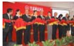
The Vice Mayor of Xiamen was among the dignitaries at the tape cutting ceremony to open the new offices