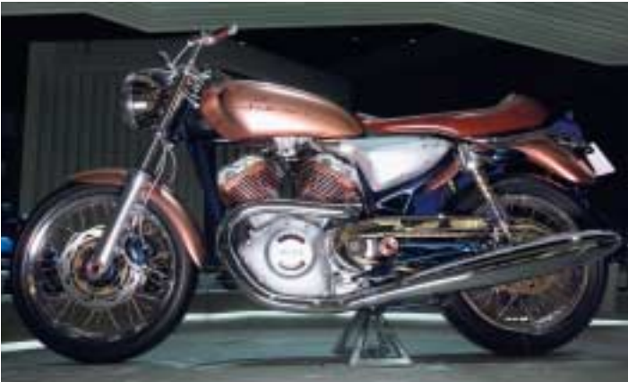
XS-V1 Sakura (Special display model/prototype): Drawing on the DNA from Yamaha's first 4-stroke motorcycle, the XS-1 released in 1970, this V-twin sport model features a simple, sculpted beauty with "Retro-modern" aesthetic elements and accents of Japanese style.