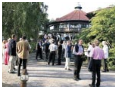
The beautiful city of Helsinki was the venue for the meeting