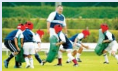
Former players of the Yamaha Motor Rugby Team serve as the main instructors for the Yamaha Rugby Schools

strong, healthy bodies. Through these activities, YMC is contributing to local communities, especially in the Iwata city area where our headquarters are located.