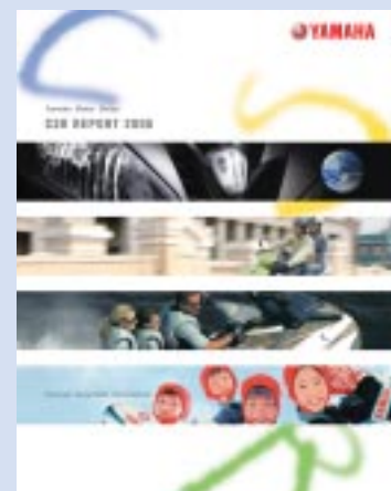
YMC published the CSR report 2006 in May of this year