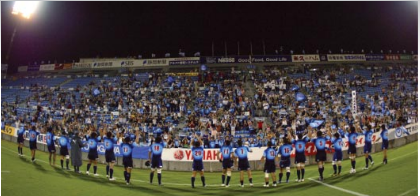
In Japan's rugby "Top League" Jubilo Yamaha finished 3rd, 2nd and 7th respectively in 2003, '04 and '05

At Yamaha Motor Co., Ltd. (YMC) our corporate mission is to be a company that creates that special mix of excitement and deep satisfaction that we call Kando in Japanese. As part of this commitment, YMC has been involved in activities like motor sports on a global scale, beginning soon after our company's founding and continuing ever since in an ongoing "challenge" that has become a core of our corporate culture. Another part of our corporate culture that we have long pursued as a way to contribute to society and also invigorate our employees is the promotion of a variety of physical (participation) sports. Among these, our company rugby and football (soccer) teams have been particu-