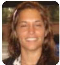
Our reporter: Nawah Kuntichaikajon

YMARG distributes a full range of YAMAHA motorcycles, ATVs for utility and sport, outboard motors, WaveRunner PWCs, marine diesel engines and Power Products through a nationwide sales network that includes of over 150 official dealers, and authorized service shops.