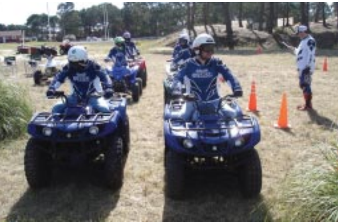
ATV Safety Riding courses like these are frequently held to create a higher level of our customer satisfaction

Engines to our product lineup this year, with a good reception from the customers, and we now plan to introduce them in the most important boat-building companies in Argentina.