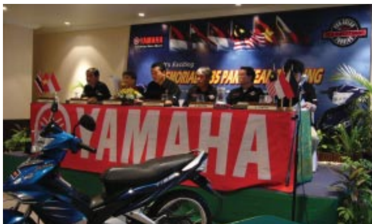
The Pan-ASEAN Touring review meeting was held on the island of Bali