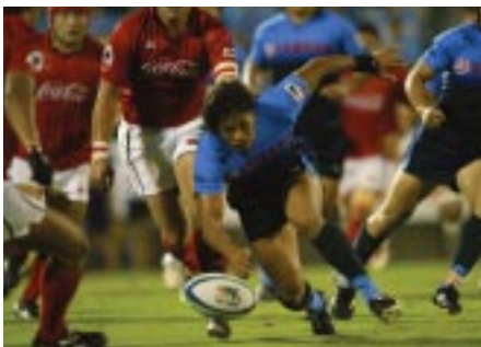
The Japan Rugby Top League kicked off its 2006 season on September 2

Team became a member and adopted the same "Jubilo" (Jubilation in Spanish) name as the former Yamaha football club and current professional team Jubilo Iwata. Today Jubilo Yamaha continues to compete as one of the strongest teams in Japan. Looking to the future, YMC will continue to promote both motor sports and physical sports like rugby and soccer as activities that bring "dreams and Kando " and stimulate exchange between people, both inside and outside the company, while contributing to the development of sports and helping us fulfill our corporate mission of creating Kando .