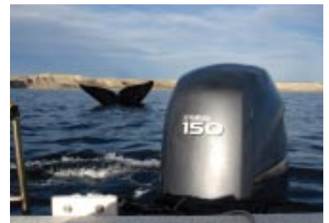
YMARG's "Free Check" service campaigns offer customers a free inspection of their product

At YMARG we are confident that these policies will keep us growing despite the current invasion of cheap products, as more and more Argentine customers look for the quality and service that only Yamaha offers.