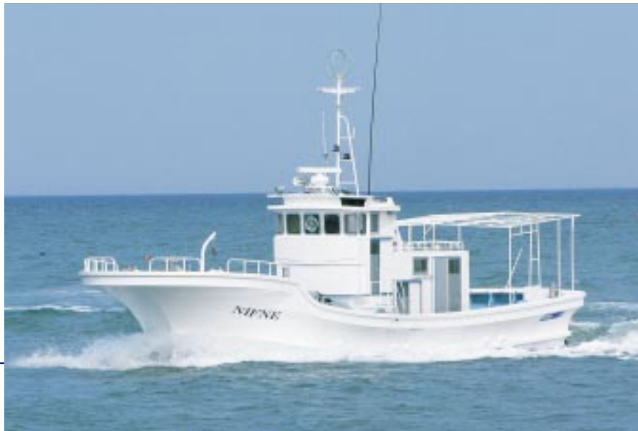
A new fisheries training boat was supplied to Sri Lanka as tsunami relief aid