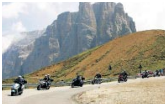
Many appreciative Yamaha owners gathered for the touring event in the scenic Dolomitiche Alps