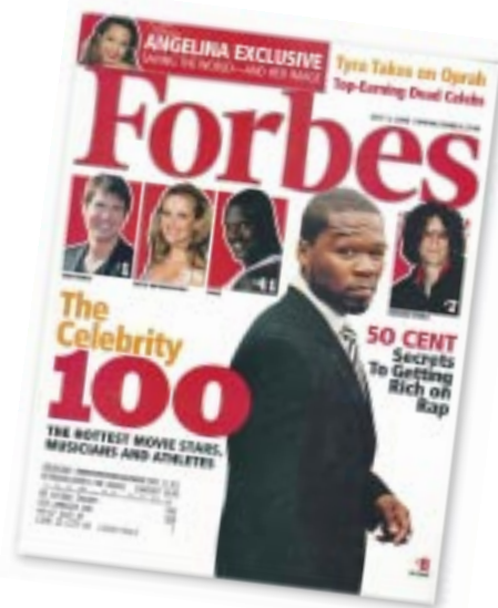
The Forbes issue with the top 100 celebrities feature that included Yamaha MotoGP rider Valentino Rossi

The reigning MotoGP world champion, Valentino Rossi has been chosen by America’s financial and business biweekly Forbes (July 3 issue) as one of its top 100 celebrities in the world. The fact that Rossi ranked #64 among the world’s celebrities is solid proof of the great popularity of MotoGP racing in Europe and other parts of the world. By the way, the top ranked celebrity was US actor Tom Cruise.