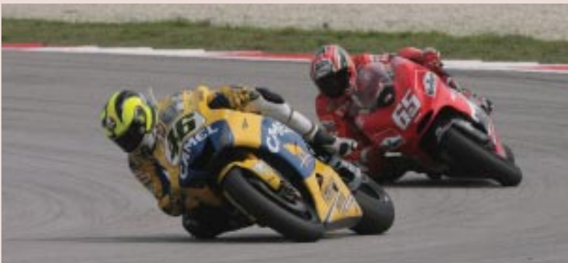
At the Malaysia GP Rossi and Capriossi traded the lead four times in the last two laps before Rossi prevailed to win his 5th GP of the season

After no-pointing in a disappointing US GP (round 11) where he was forced to retire, defending MotoGP champ Valentino Rossi stood in 4th position in the season ranking, a full 51 points behind the leader, Nicky Hayden (Honda). During the ensuing one-month summer break, the Yamaha machine development team worked hard to get the YZR-M1 in top competitive condition for the remaining six rounds that would determine the title race. Those efforts showed clear results as Rossi rode to a strong 2nd behind Loris Capriossi (Ducati) in round 12. This podium finish helped