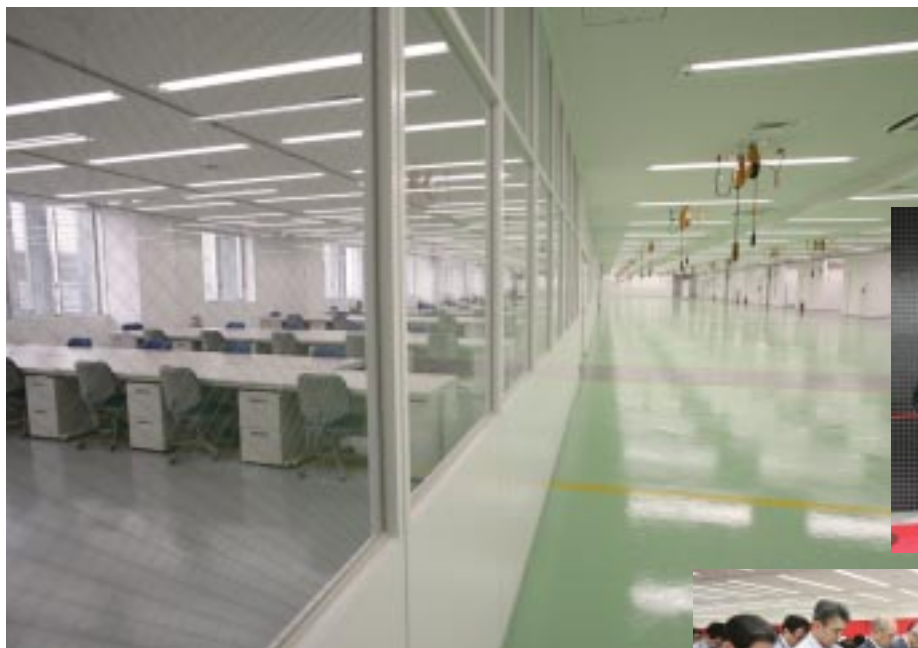
The floor layout is designed to promote communication between the employees as they work, based on an "on site" concept

The aim of this consolidation and integration is to strengthen these operations in the fundamental aspects of product development and thus promote process innovation while increasing development speed and quality.