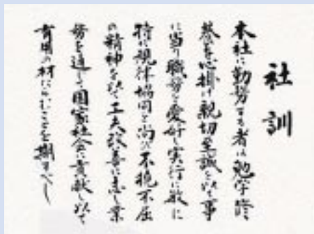
At the time of its founding in 1955, the Yamaha Motor group adopted a “Company Pledge” as a set of basic principles with a focus on the individual employee’s actions and responsibilities to society as a corporate citizen

I think that it is important for all of us to have a shared understanding of CSR and its issues like compliance and to think together and act together as we work toward common goals. I hope that each and every one of us in the Yamaha Motor group will recognize that we, as individual, are all main players in this task of creating CSR vision that is truly Yamaha and implementing it with our own minds and bodies.”