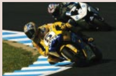
Colin Edwards suffered from a retirement in round 14 that dropped him to 9th in the season ranking, but he moved up to 8th place after round 15

Rossi continued his charge toward the title in round 15, the Japan GP at Twin Ring Motegi, where another strong 2nd place finish brought him within 12 points of the ranking leader Hayden. It is clear now that Yamaha has been able to regroup and bring the defending champ within striking range of the title with two rounds remaining in the series. Both Rossi and the Yamaha team have promised that they won't give up until it's over and fans all over the world are watching to see if Rossi can win his 3rd straight MotoGP title with Yamaha.