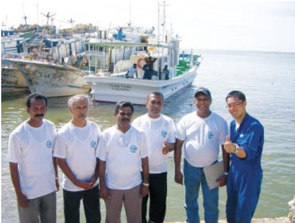
Yamaha staff instructed representatives of Sri Lanka's National Institute of Fisheries and Nautical Engineering in use of the new boat

When the devastating Indian Ocean tsunami struck Sri Lanka's east coast December 2004, one of the many boats damaged was the Yamaha-design fishery training boat operated by the National Institute of Fisheries and Nautical Engineering (NIFNE). As part of the Japanese government's aid package to help in the recovery of the fishing industry here in Sri Lanka, a new Yamaha DX-79-0A boat (built by Yamaki Manufacturing Co., Ltd.) was recently delivered as a replacement for the damaged training boat. The new boat was immediately praised for its outstanding running stability and the great utility of its wide gunwale top. Elsewhere, 34 units of the Yamaha EK40G outboard motors have been delivered to fishermen in Aceh, Indonesia, another area severely struck by the tsunami.