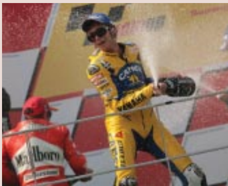
After the Australia GP Rossi was still far behind in the point rankings but he said the title was still a possibility and that he wouldn't give up

After no-pointing in a disappointing US GP (round 11) where he was forced to retire, defending MotoGP champ Valentino Rossi stood in 4th position in the season ranking, a full 51 points behind the leader, Nicky Hayden (Honda). During the ensuing one-month summer break, the Yamaha machine development team worked hard to get the YZR-M1 in top competitive condition for the remaining six rounds that would determine the title race. Those efforts showed clear results as Rossi rode to a strong 2nd behind Loris Capriossi (Ducati) in round 12. This podium finish helped