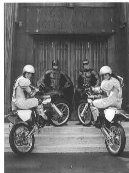
The stunt bikes of choice in the Batman stunt show at Germany's Warner Bros. Movie World are two YZ125s