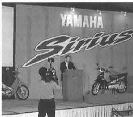
The press conference was made on Sept. 21