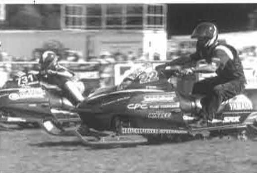
The SRX 700 is known as the perfect blend of power and handling, and now SnowGoer magazine's "Snowmobile of the Year"

Confirming Yamaha's position as a technology innovator, Yamaha's advanced SRX 700 snowmobile edged out the competition to win SnowGoer magazine's coveted "Snowmobile of the Year" award. SnowGoer , a leading U.S. snowmobile publication wrote, "If the SRX 700 from Yamaha were a boxer, it would be one of the greatest champions ever...when the trail opens up onto a lake, POW! The knockout punch is delivered with acceleration so hard it will roll up your sleeves and tear out your arm hair." In addition to