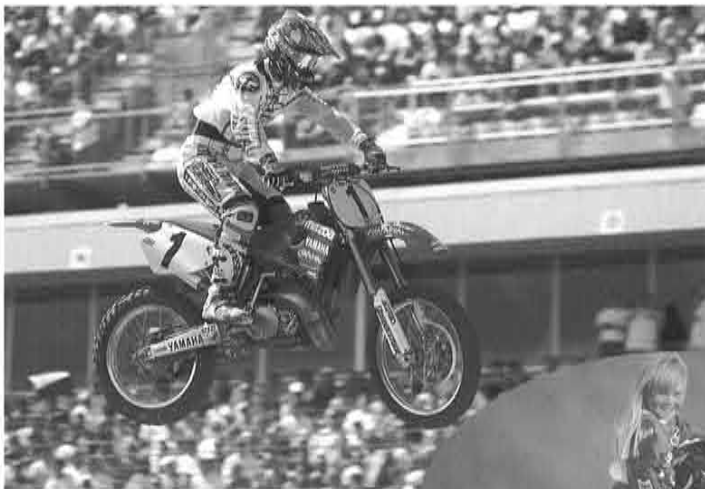
Winning the big titles in the US's AMA Supercross and this year's World Motocross Championships has made a huge impact on potential customers