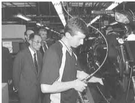
Evaluating the TPM activities of the welding section