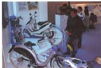
At the Eco-Zone the "ECCY" electric scooter and the "Hybrid Commuter" are displayed

The booth was further divided into four zones. In the "Exciting" zone, which expresses performance that exceeds the rider's expectations and the joy of operating a machine of that quality, visitors saw the further evolved new version of the flag-