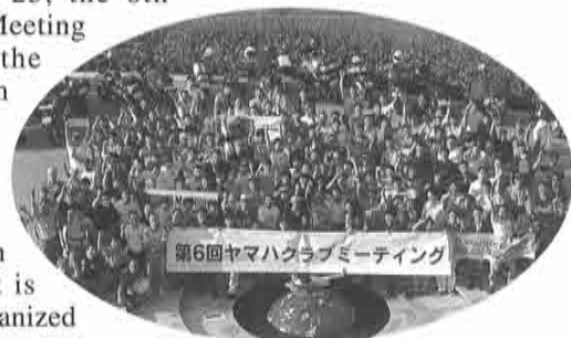
This sixth year of the meeting was blessed with fair skies, and about 190 members from 16 clubs took part

Now in its sixth year, this event is planned and organized by Yamaha motorcycle owners clubs and Yamaha fan clubs from around Japan.