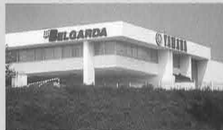
The Belgarda office building

buying 50 cc scooters is that the Italian government was planning to require all riders, not just those under 18, to wear a helmet when riding a 50 cc scooter. Now that law is about to go into effect.