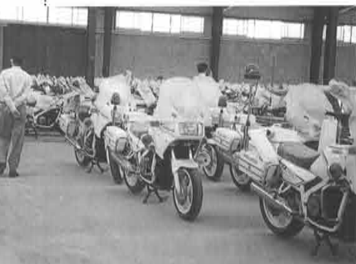
Some of the 500 new Egyptian police bikes - all Yamaha FZ750s