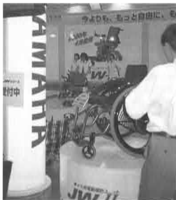
The JW series electric power-assist unit for wheelchairs was demonstrated during the introduction performance

At the Yamaha Booth, three models of the JW series electric power-assist unit for wheelchairs were displayed, and the visitors had a chance to ride the JW-equipped wheelchairs up and down a slope to see how the electric power-assist units are useful in various conditions.