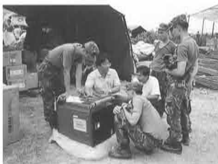
Giving instructions on how to use the Yamaha generators

On September 21, 1999, a major earthquake struck central Taiwan. In an effort to do what they could for the relief effort, Yamaha Taiwan (YMT) and YMC donated 50 Yamaha generators and 30 Yamaha scooters.