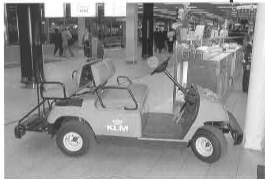
Yamaha golf cars with special technical modifications welcome you at Amsterdam's Schiphol Airport

From Dunya Cancuk of YMENV, The Netherlands