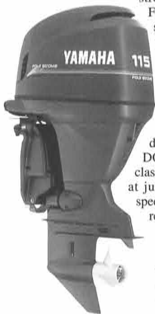
The F115A is a lightest-in-class 4-stroke combining high levels of performance and environment friendliness

Until now, the basic structural requirements of a 4-stroke engine have made the kind of compact design people want in an outboard very difficult. The F115A was designed with a compact 16-valve DOHC engine that boasts smallest-in-class displacement for a 115 hp 4-stroke at just 1,741 cc. What's more, an idle speed controller and special idling noise reduction system help give this model unrivaled quietness.