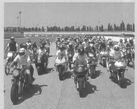
The Yamaha Fest customer event drew over 3,000 people at the Misano circuit