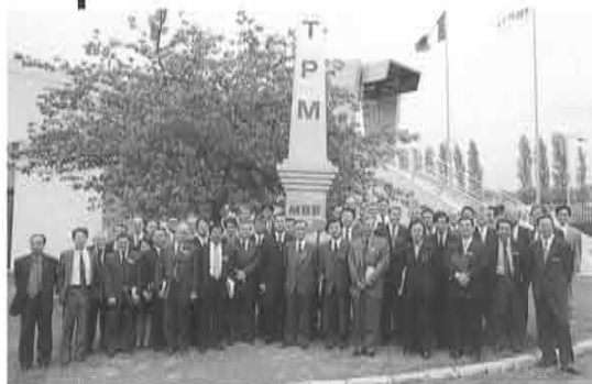
A commemorative shot in front of the TPM monument at MBK

On the first day, MBK reported on their TPM activities, with examples of activities from each work area including press and welding, painting and production lines. There were also reports from the project team working on improving logistics, from domestic sales, and on the improvements in efficiency made by purchasing operations.