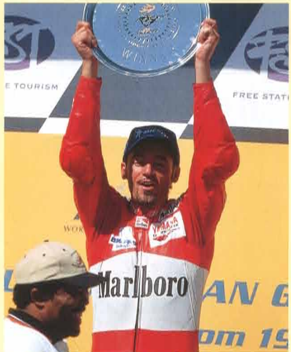
On Oct. 10 at the Welkom circuit in South Africa, Max Biaggi scored his long-awaited first win of the season in the 500cc class of the World GP

This brilliant late season surge gives Yamaha second place in the constructor's championship with eight podium places in the last five races.