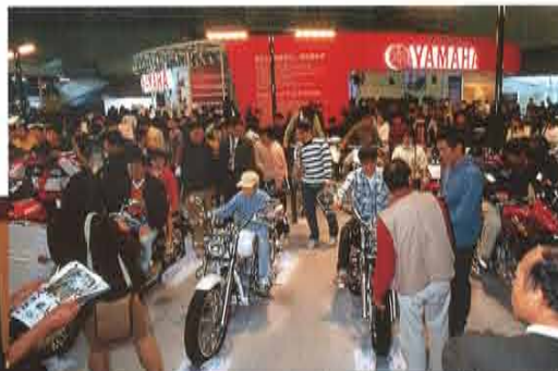
The show visitors could touch and get a feel for the bike of their choice