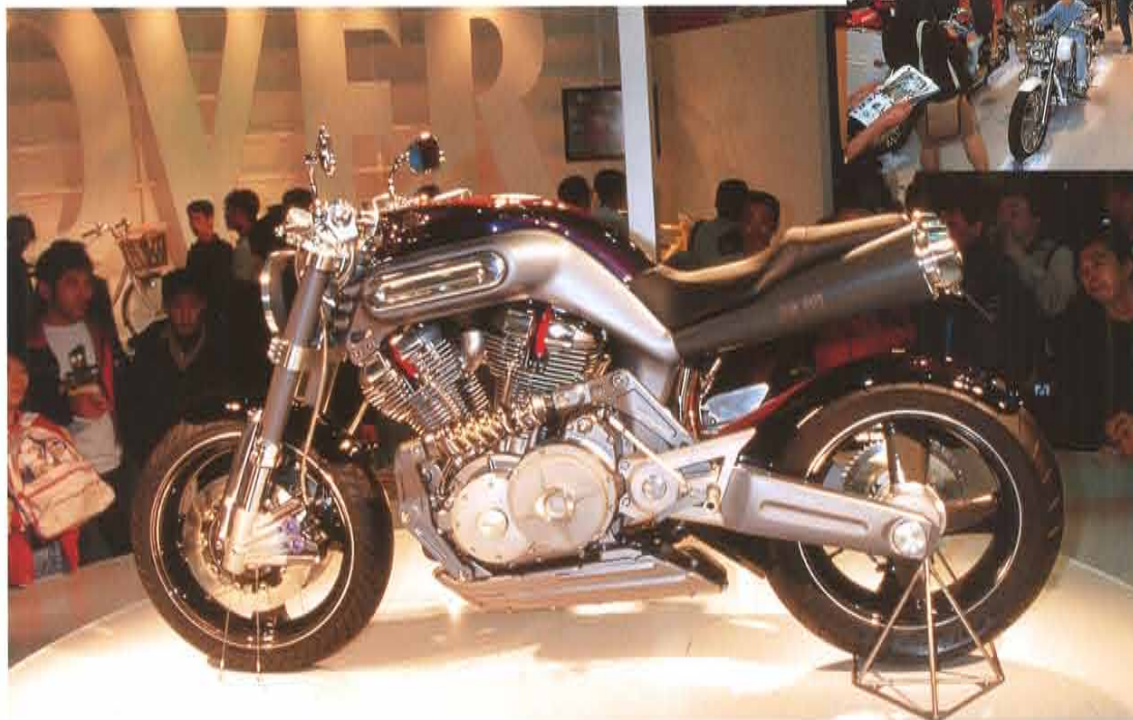
The concept model "MT-01" drew special attention from show visitors at the Yamaha Booth

F or the 33rd Tokyo Motor Show held at the Makuhari Messe exhibition center from Oct. 23 to Nov. 3, Yamaha mounted its booth under the theme "Your Possibilities Awaken."