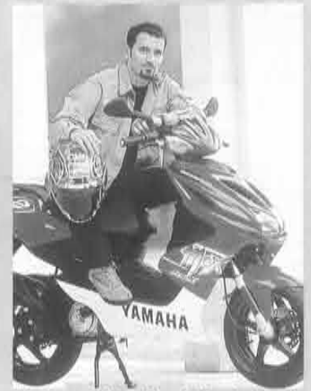
The Aerox R Max Biaggi 50cc is a replica of the YZR500 works machine which Mr. Biaggi rides in the World Championships!

The Majesty has become the best seller in Italy and has already sold nearly 50,000 units in Italy since '96