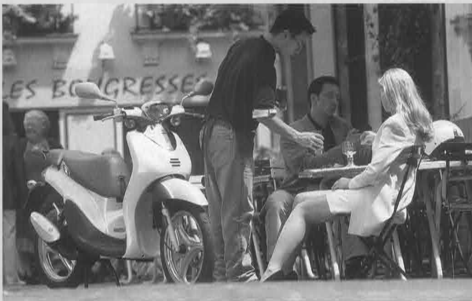
A scooter like the Why shown here perfectly fits in the vision of daily city life

Under the present organization, Belgarda has seen its sales grow from 300 billion Italian lire in 1992 to expected sales of