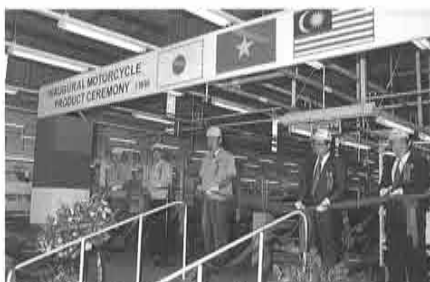
YMVN's new factory in Hanoi

Yamaha Motor Vietnam Co., Ltd. (YMVN) produced its first unit on October 7, 1999 - the 4-stroke 102cc sports model Sirius. The mass production of motorcycles in this manufacturing and sales joint venture of YMC has been 18 months in the making. Since the Vietnamese government issued approval for its establishment, preparations have included construction of the factory, product design and development, trial production and formation of a sales network. The new factory, in the