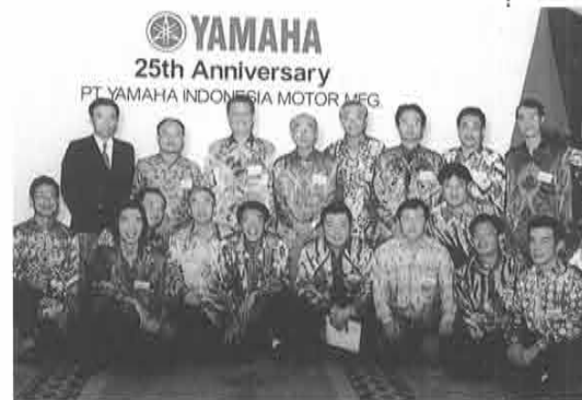
The ceremony was made especially colorful by batik-clad guests!