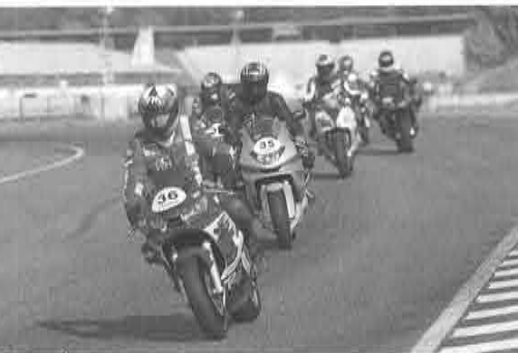
Riders of Yamaha sports and supersports models participated in a sports rider course at the Hockenheim circuit

Hockenheim is the longest GP circuit in the world, with one lap at 7km, and 800 to 1,000km were covered over the two days.