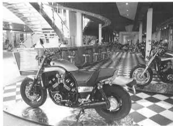
Hostettler's new building and new showroom displayed with Yamaha bikes and scooters

In order to optimise the services provided to our sales partners and customers, Hostettler has completed a programme of renovation and new building to usher in the third millennium. Investments of more than US$10 million will benefit the numerous Hostettler companies, their customers, business partners and staff equally. The renovated area of the project is approximately 12,100 m 2 . Thanks to the new generous dimensions of the facilities it is now possible for the first time to present the entire range of Yamaha and MBK products, the latest IXS motorcycle wear and the many diverse accessories from leading manufacturers in an appropriate ambience. In addition, the education and training facilities, which have been fitted with the latest presentation equipment, provide the best possible infrastructure for