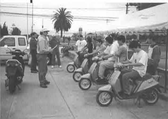
YRS became one of the most successful customer-oriented events ever held in Chile

The original goal of YRS has been met, and what is most inspiring is that the distributors have managed to sell scooters and other models to people who previously had no interest in bikes.