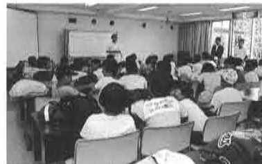
Explanations are given prior to each water craft experience.