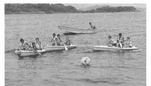
Dinghy Paddle Race: The youngsters paddling for all they are worth.

Before they left Hamanako, the children were all given a pamphlet full of rules and advice for enjoying and preserving our seas and rivers and a pad of composition paper to write about the things they experienced and the fun they had over the three days.