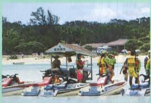
Forty-six people participated in the long touring event for Water Vehicles. These vehicles always offer fun riding for one, two or even three people.