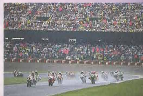
The heavy rain at the start of the race made the bikes send up duck tails of water as they ran.

On lap 58, 2 hours and a half into the race, Fujiwara crashed on the hairpin while running in 5th position and retired from the race. Meanwhile, Magee/Chandler had reclaimed second position and started to go after the lead machine. After the 4th hour, a nose-to-nose sprint race developed between the Gardner/Doohan team and the Magee/Chandler team.