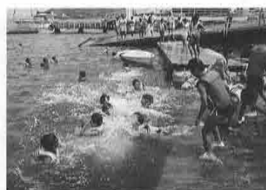
After lunch the kids can't keep still. Soon they are back in the water again.