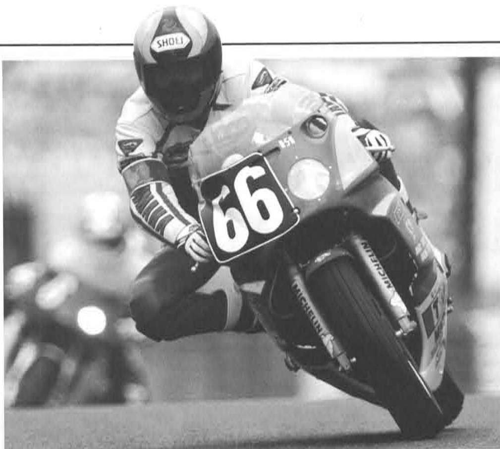
Running with lights on and the goal not far ahead.

The bikes that YMC happily supplied to these two ambitious teams were the FZR750R (OW01), a replica of the YZF750 works machines that have won the Suzuka 8-hour in 1987, '88 and '90. Although there are a number of racer replica models on the market today that are meant to have the look and feel of a works machine, all of them are in fact designed primarily for street performance. Unlike these, the OW01 is a replica built