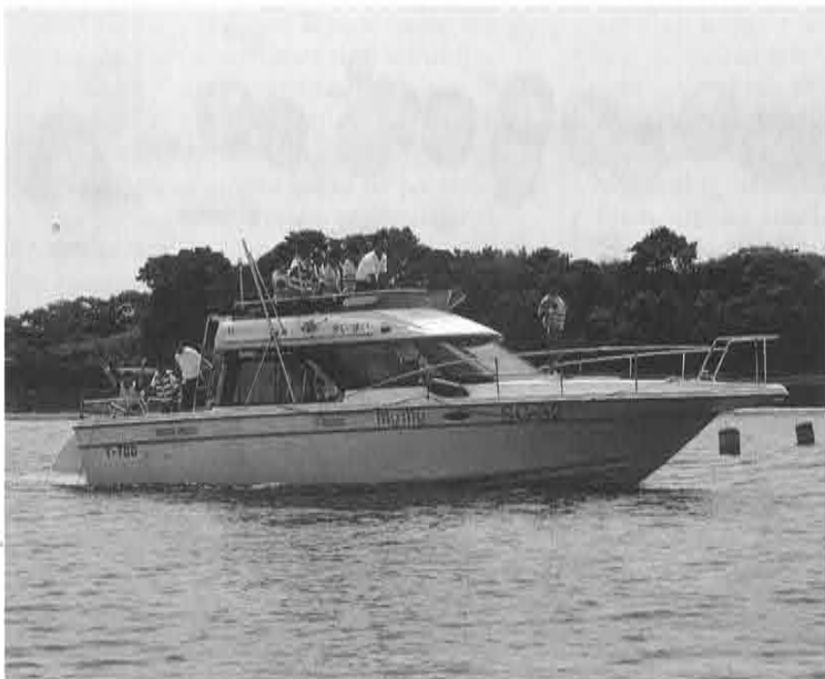
Powerboat Experience: A refreshing cruise around Hamana-ko