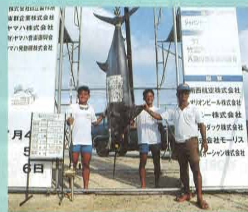
This team is proud of the 115kg swordfish they landed.

For 12 days from late June into early July, the Yamaha Marine Carnival '91 was held at the Yamaha Recreation-managed "Haimurubushi" resort on Okinawa's Kohama Island. The site of the Carnival, "Haimurubushi", means the Southern Cross, and its semi-tropical location makes it the perfect place for an event like this dedicated to the full enjoyment of marine sports. The Carnival kicked off with diving events from June 20 to 22. Then, from June 27 to 30 a variety of Water Vehicle events were held. And finally, from July 4 to 7, came