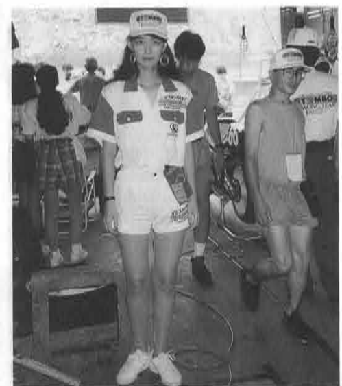
The three "Princess Iwata" contest winners serve as campaign girls for the team. One is a Yamaha employee.