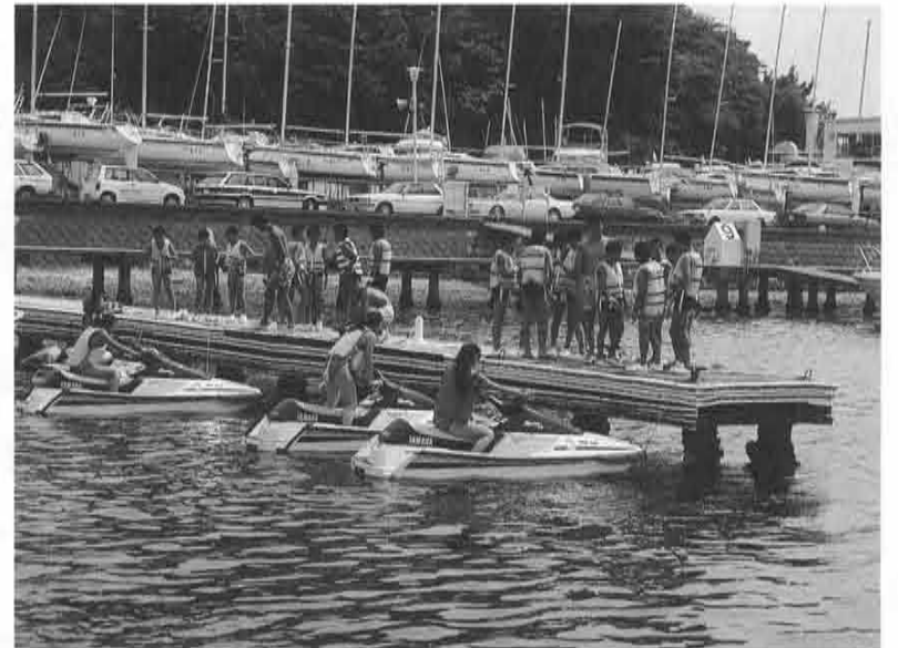
Water Vehicle Experience: Children ride with the Yamaha Marine Ladies. The speed and excitement brought shouts of delight.