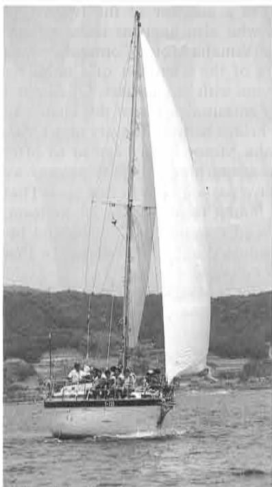
Sailing Cruiser Experience: The children's eyes were full of excitement throughout the one-hour cruise.

For three days from July 23 to 25, Yamaha Motor Company held a "Marine Play for Kids at Hamanako" event at the Yamaha Marina Hamanako.