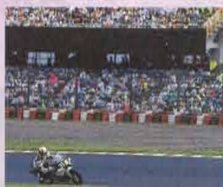
On the last day alone over 150,000 excited fans turned out to watch the racing.