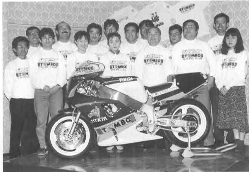
In April, the teams and their machines are introduced at a press presentation of the Suzuka 8-hour participants.