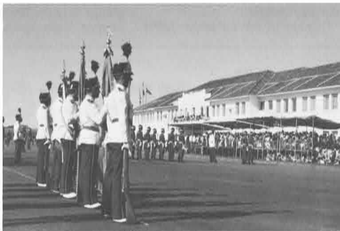
The grand ceremony