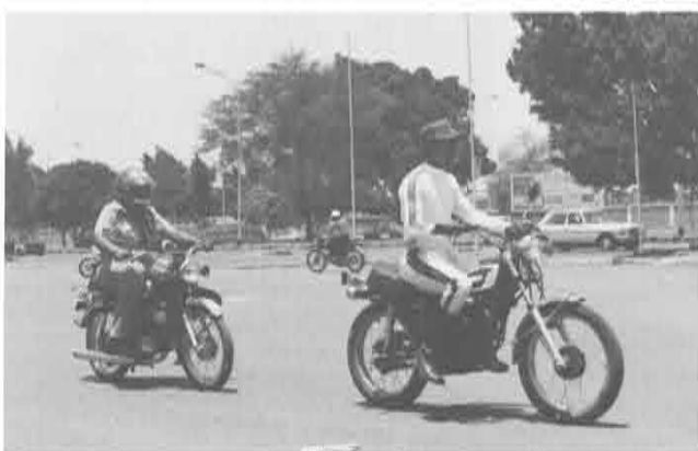
New instructors are teaching novice motorcyclists.