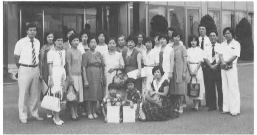
Welcome to Yamahai!