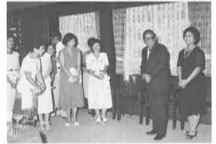
A grand reception party