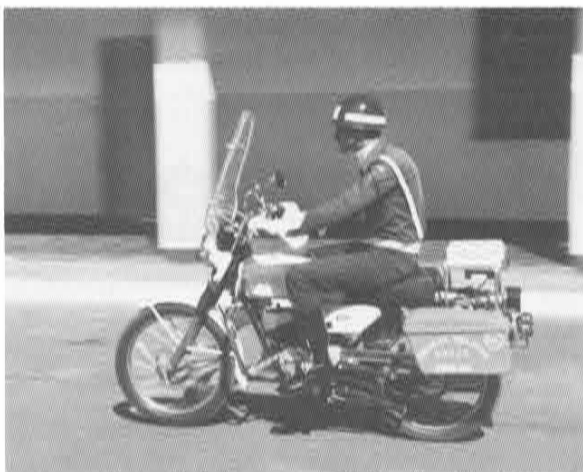
Smooth riding on an RX125 police bike.

The RX125 police bike, which is finished in white, features a special cowling, safety bumper, two red lamps, two sidebags, etc.