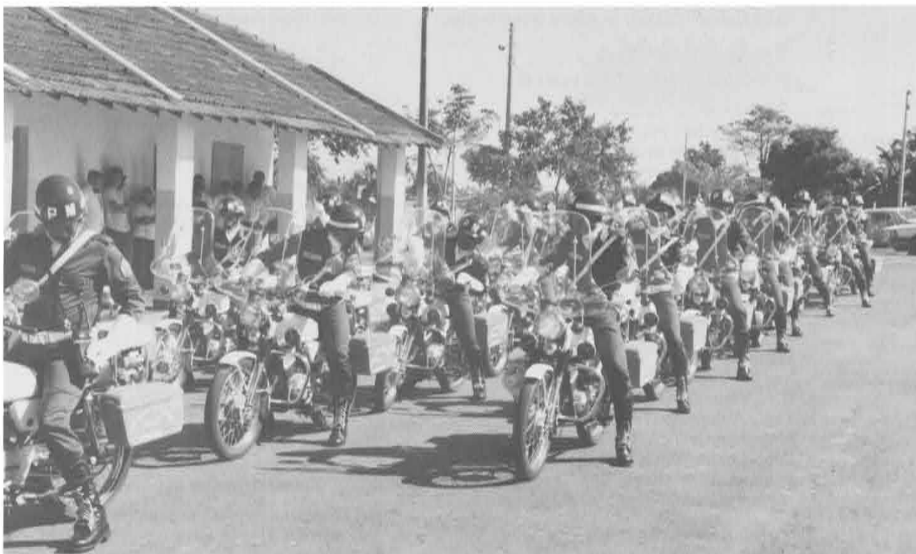
Parade of police bikes