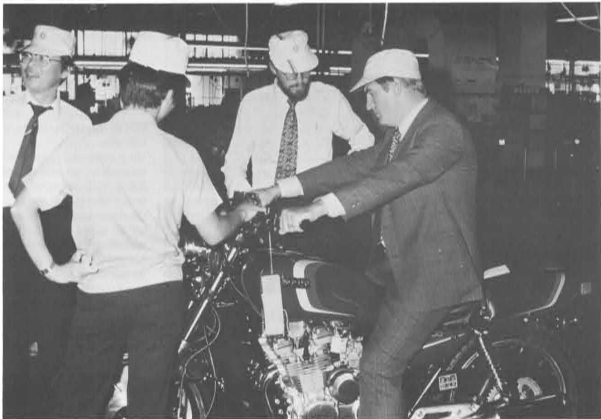
Asking questions about the features of the new popular XS400.