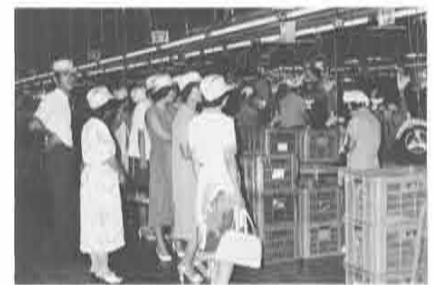
The assembly line of Passola bikes is attended by woman employees.