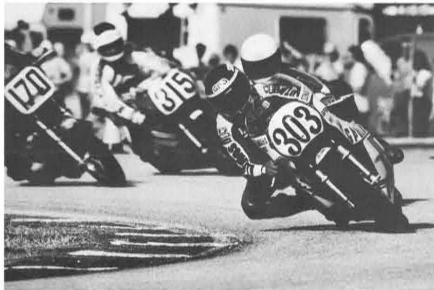
Pons wins the '80 Daytona!

series, in a very convincing manner cheered on by a lot of French fans. From then on, he fought his way on, aiming for a long-coveted world championship title. He scored his second win in the Canadian round, the 6th of the series, to lead both strong rivals in championship points, and put an end to the '79 F750 title battle when he won both races of the West German round, even with one more round (Yugoslavia) remaining. Thus he became the first French rider to win a world championship title. Pons teaming up with Japanese rider Sadao Asami rode a Sonauto entered TZ750 in the 43rd Bol d'Or 24-hour race in September. The pair led the race until a chain tensioner broke in the final hour. A dramatic highlight in this prestigious endurance event! Late in 1979 he was invited to take part in the Sugo Big Road Race. He displayed his magnificent techniques and finished fourth overall in this race.