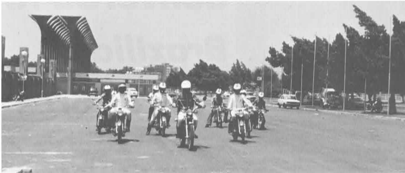
A demonstration run in response to the request of journalists.

An instructor training course was also given at the request of police authorities, resulting in the graduation of 8 instructors, including 2 special instructors, together with 8 assistant instructors. They will take a very active role in promoting the spread of traffic safety around Cairo.