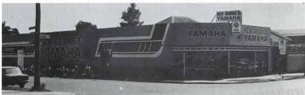
Their Geddes St. retail premises