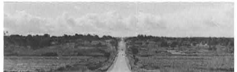
Yamaha demonstration is an effective PR exercise.

As mentioned above, motorcycle manufacture is now becoming one of the most important mainstay industries in Brazil. Reflecting each motorcycle manufacturer's greater efforts, locally assembled machines are fast increasing in number on the market. KD production by Yamaha Motor do Brasil in San Paulo started in November last year. Now, 600 machines of the RD50 are assembled monthly. Also, 100cc and 125cc models will shortly add to the line in order to better meet the always-expanding market.