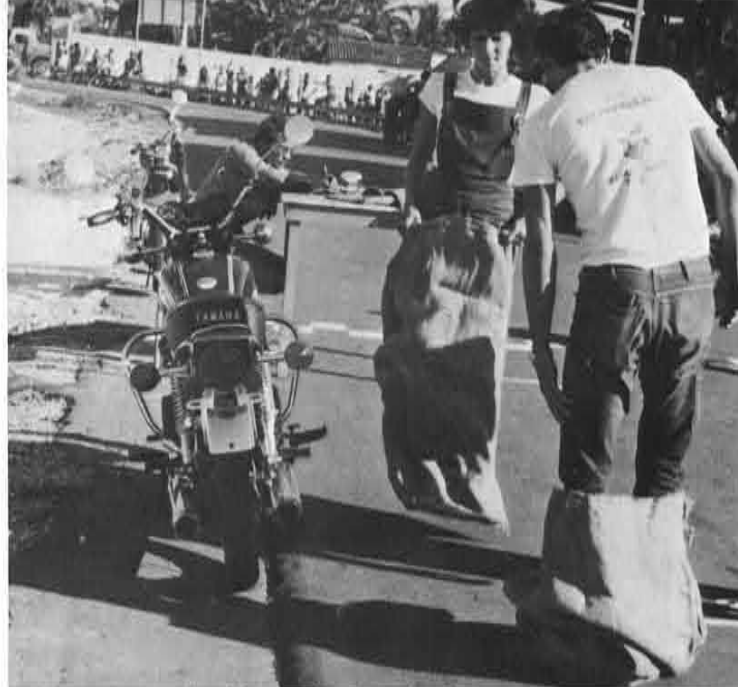
Coffee bags are utilized for a unique hopping-along game.