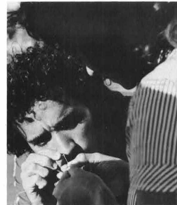
Needle & thread game

Looking for an entirely-new world of pleasure or fun, a lot of Yamaha fans take part in motorcycle gymkhanas promoted by Yamaha dealers. Plank riding, spoon game, slow race, needle & thread game, etc. . . . the program is arranged in rich variety, thus greatly interesting both participants and spectators. All games are open to everybody so that the whole family can have the nicest time all together.