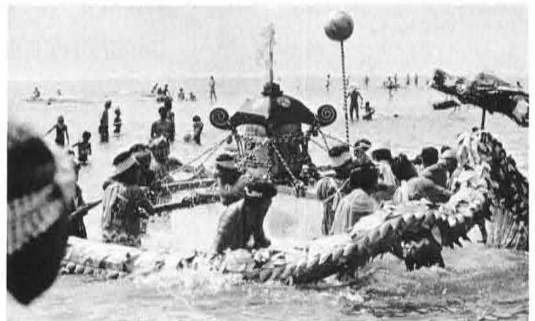
Festive mood reaching the climax