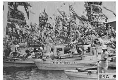
A fleet of Yamaha fishing boats

Fishermen's festival is promoted as an annual citywide event, attracting a lot of spectators from various neighbouring districts. The festival program incorporates many, delightful attractions but nothing is more impressive or fantastic than a parade by many fishing boats with colorful bumper flags fluttering in the wind.