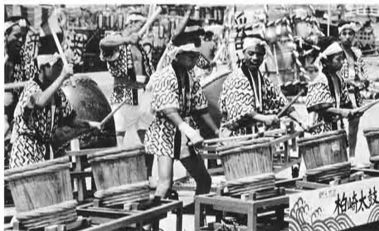
Rice-wine casks are utilized as drums.