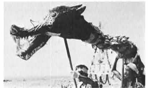
A sea dragon !

They spare their precious time for this event today, but will be in higher spirits tomorrow.