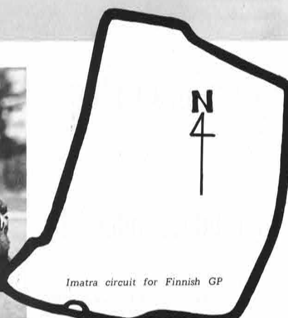
Imatra circuit for Finnish GP

Giacomo Agostini celebrated his 4th 500cc win at the Finnish GP which was organized at the Imatra circuit only 2.5 miles from the Russian border on July 25/27.