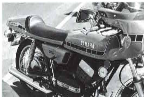
An RD250 outfitted in cafe racer gear

Generally speaking, share contest is getting hotter in this region but it is hoped that their efforts will greatly improve the situation for Yamaha.