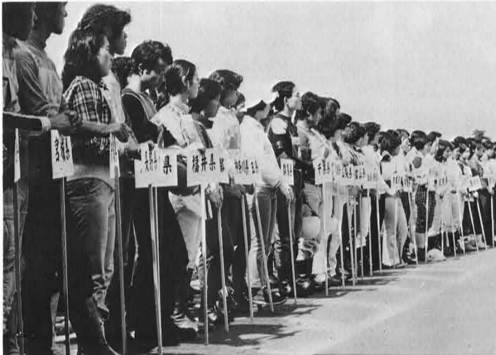
Selected riders from all riders

A total of 165 selected motorcyclists who represented their respective regions, competed for national safe driving championships.