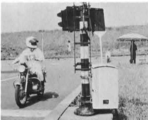
Stop and go I