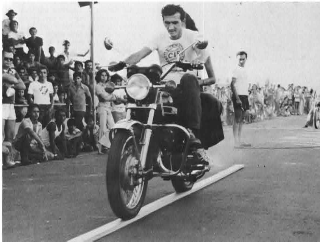
Double plank riding