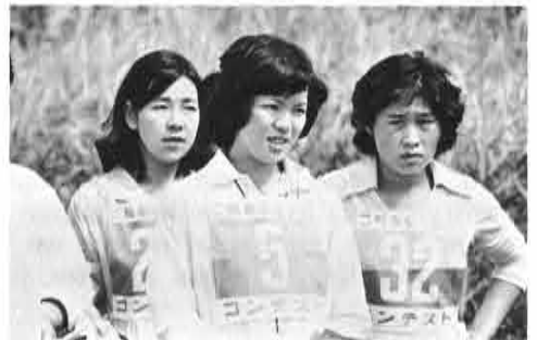
Good female motorcyclists