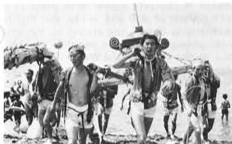
Carrying about a portable shine

The festival was once held just for the sake of fishermen's relaxation during off-season time in winter. But, with much more importance attached to fishing itself, it has grown into a citywide event not only for fishermen and their families but for all others living around the city.