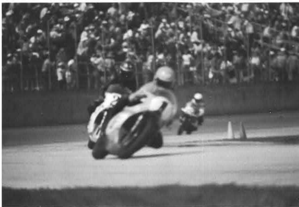
'73 AMA Grand National Champion Ken Roberts (runner-up to Agostini)