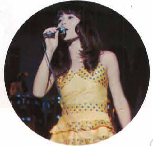
Popular singers on the stage (above), and youthful excitement (right)