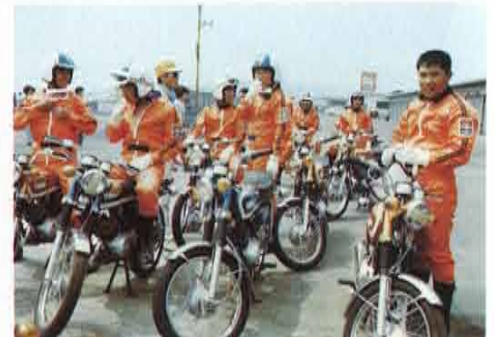
OB race by retired veterans