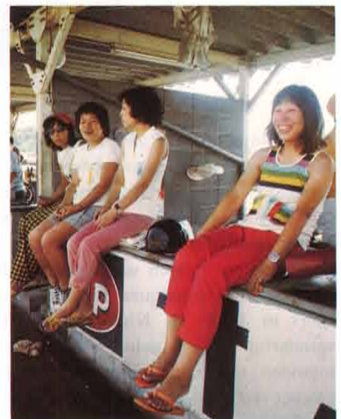
A scene of pit