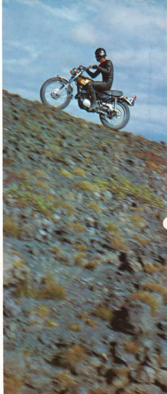
▲ For climbing a rough steep slope