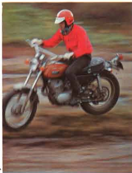
▶ For off - road riding ▶