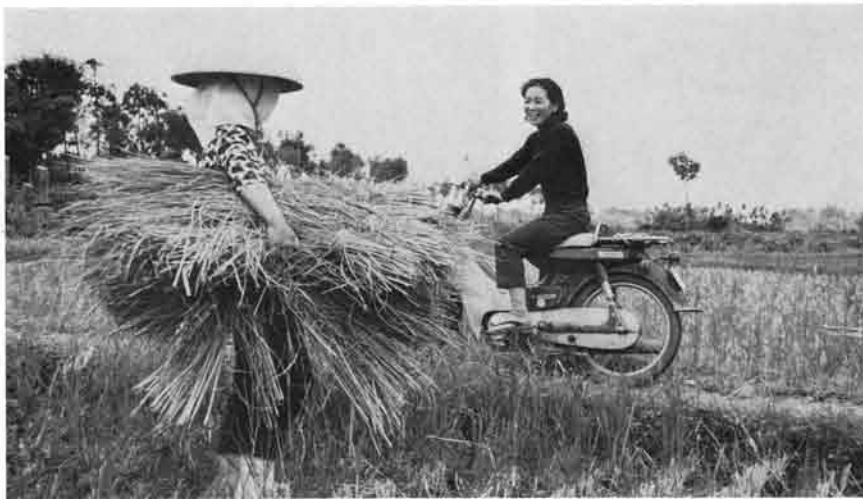
How about the crop? It is her first compliments to customers at work in farms. Her sales approach begins with these words.

In Nakajo-machi, several other shops are dealing in motorcycles of different makes, but the honor of top dealer goes to Kawachi Cycle Shop selling some 170 units annually.