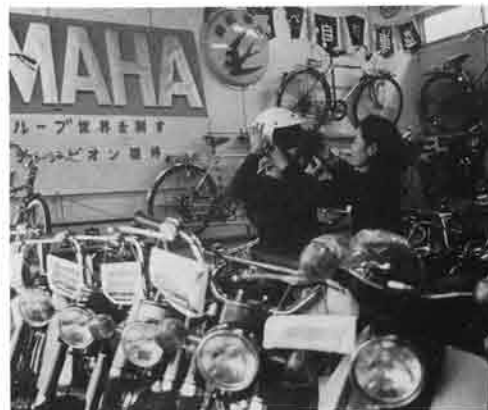
The display of Kawachi cycle Shop is so attractive and sophisticated. Sales of parts and accessories are making a rising curve as well.