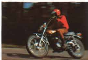
▲ For pavement cruising