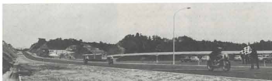
▲ Exhaust noises of YAMAHA GP racers are resounding throughout their new home ground.