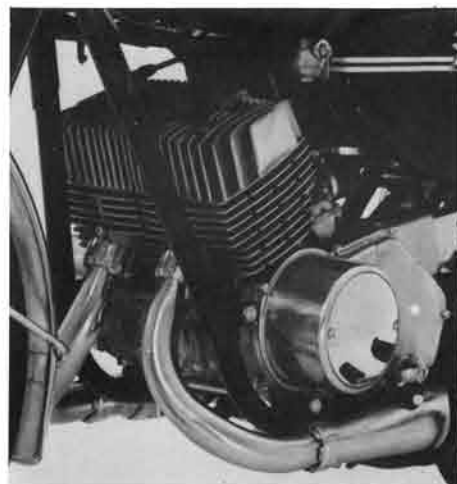
Compact but powerful 5-port engine

It was rather warm and rainy. Conditions were not so good for motorcycling. An engine, however, got enlivened with one kick. A clutch response was surprisingly soft and light for this class bike, and I felt the potential high performance of the biggest Yamaha all the more for it. A R-3 incorporated the world-famous 5-port cylinders, intending to keep the breathing operation in the most ideal condition.