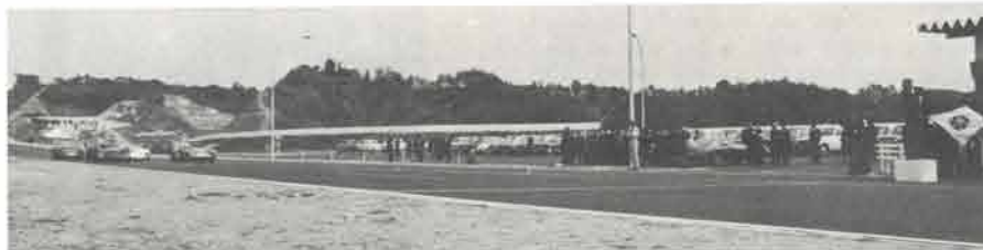
▲ A group of TOYOTA 7 models are experimented on the course.