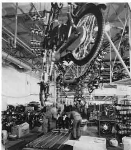
A full-wing operation of YAMAHA factory