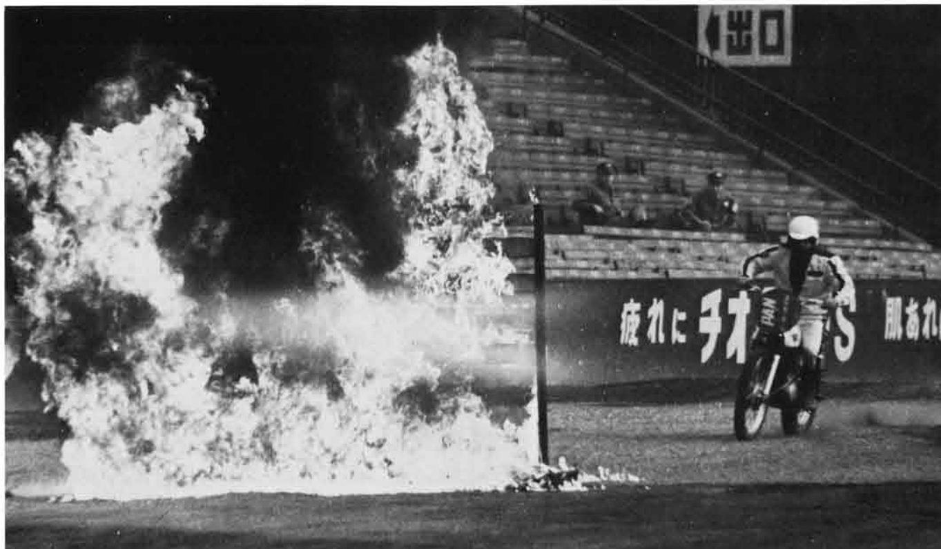
▲ Starting for flames!