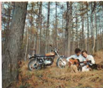
▲ For their happiest moment in life

Now, let's make it an ace for further sales drive!