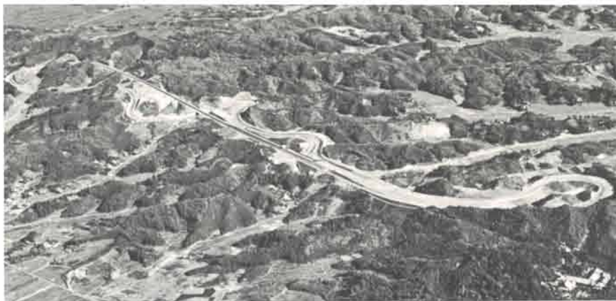
▼ (1) A grand aeroview of the Course

A center line on the course is supposed to be a lane mark in case a normal road run is experimented here. Further, along the high speed course, a