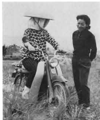
Her approach is skillful enough to make a woman lay aside a hoe to just sit astride a 50cc Yamaha.