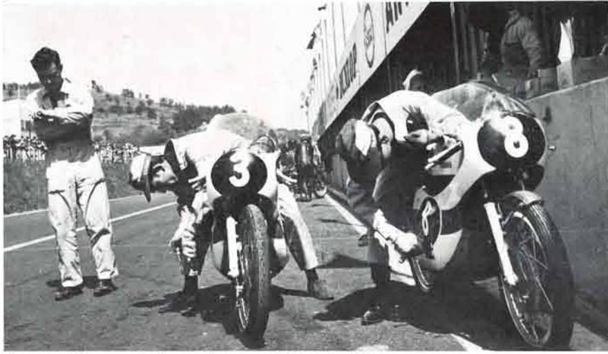
Are machines ready for racing now? (French GP)