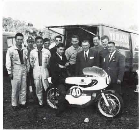
Yamaha team & French distributor (French GP)