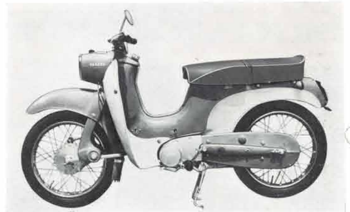
The first monocoque 50 cc moped

topic in the stock market. This record has not been broken so far, and is unlikely to be beaten in any immediate future.