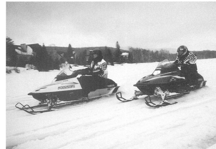
Two new powerful 500cc sleds are coming to the '99 snowmobile market