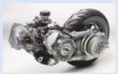
The 250cc liquid-cooled 4-stroke, SOHC, single-cylinder 4-valve engine with fuel injection ensures sporty performance as well as comfortable riding in around-town use