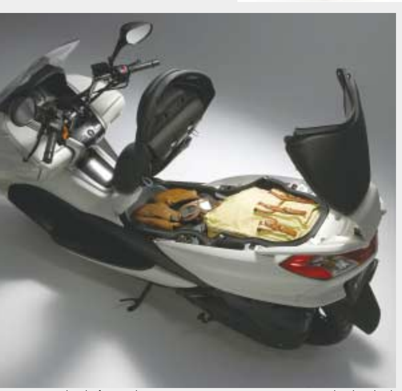
Below the front- and rear-opening seat is a storage space 107 cm in length and with a total volume of 60 liters

The revolutionary exterior design with its completely new concept of a seamless look and low-slung shape also contributes to greater ease of leg reach to the ground (700 mm), easier mounting and dismounting, increased on-board comfort and more effortless maneuverability