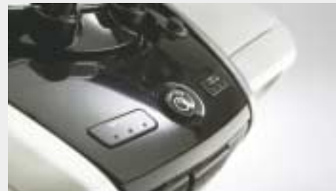
The main switch in the center of the console turns the electrical system on and off and the opening switches on the right and left operate the left-hand side front compartment lock, the seat lock and the fuel tank lid lock

Also adopted is Yamaha's first smart key system. When the owner carrying the smart key on his or her person comes near the machine. the system automatically performs a verification process and then all the owner needs to do is press the main switch to bring the Majesty 250 to life. The lock on the main trunk and the front trunk on the left-hand side can also be unlocked from the key. What's more, by eliminating the need for a key cylinder, the smart key system also enables a cleaner left-right symmetrical design to the front panel that increases the sense of unity and the look of quality finish.