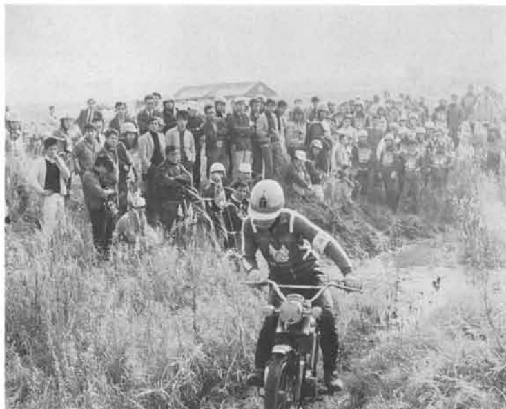
He is teaching how to go through muddy surfaces.