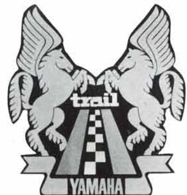
A symbol mark of trail training school. It is an idol of young enthusiasts.

If he grips a fuel tank with both knees, he can ease a shock by raising his waist up. A motorcycle is steered not with a handle but with a bodily action placing the center of gravity on waist. From this fact, the importance of knee-grip should be emphasized repeatedly.