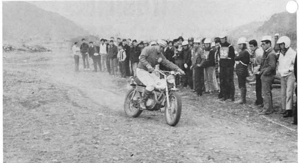
He is demonstrating his high techniques for trainees.