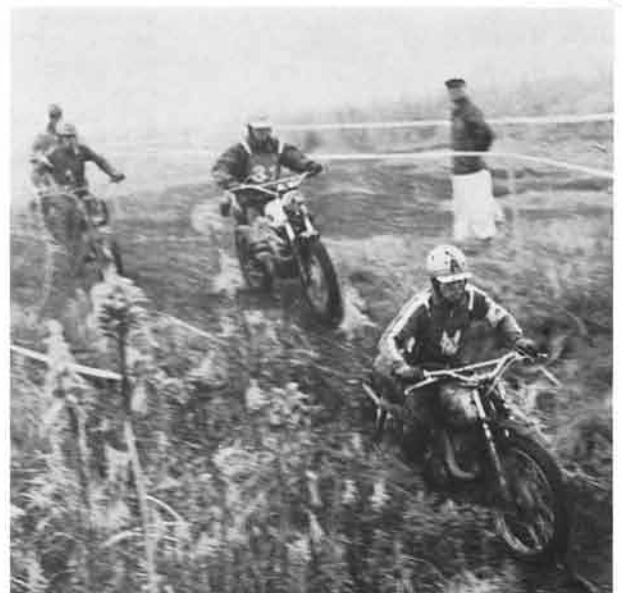
Trainees are following an model practice shown by an instructor.