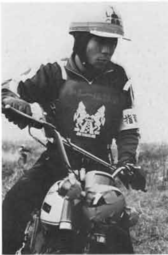
An instructor should be a man of character as well as a well trained rider.

It may be easy for us to just handle a motorcycle, but it is another thing to ride a motorcycle safely and correctly. Yamaha trail training school will satisfy any requirement for ideal riding. Now, try to sponsor it for your customers. Your efforts as an instructor will bring you much more returns, expanding market of Yamaha motorcycles.