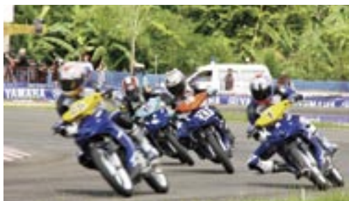
The seventh Yamaha ASEAN Cup Race in Indonesia

Back home, we captured triple victories in the road race, motocross and trial categories of the All Japan