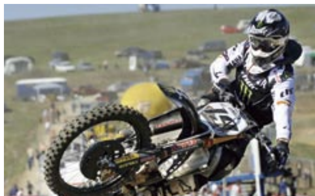
The second Bulgaria round of the 2009 World Motocross Championship MX1

Championship for the second straight year — the first time this has been accomplished in Japan.