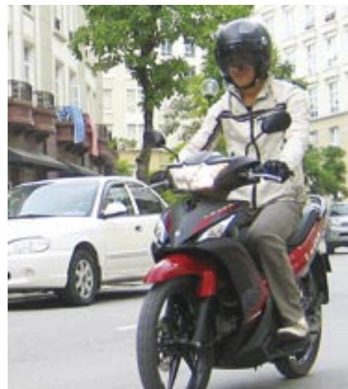
The LEXAM cruising Vietnamese streets

To meet this challenge, the project team envisioned a completely new and innovative belt construction, with special sheaves suitable for the belt, and a highly efficient cooling system. From the inception of the LEXAM project, the team focused on developing a breakthrough CVT system. It finally succeeded in 2009 — seven years after the development project was initiated — with a compact CVT suitable for mopeds, known as Y.C.A.T. (Yamaha Compact Automatic Transmission). Without this compact automatic transmission, the project team could never have developed the next-generation LEXAM premium moped while still retaining the basic performance of standard mopeds.