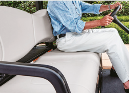
The industry's largest, most ergonomic contoured seat.