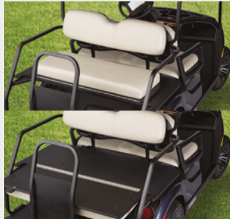
Optional: Rear-Facing Flip Seat for additional Passengers or Cargo