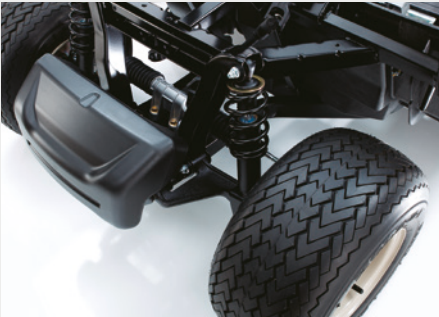
Fully independent front suspension.