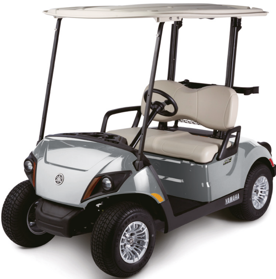
Model is shown with optional accessories