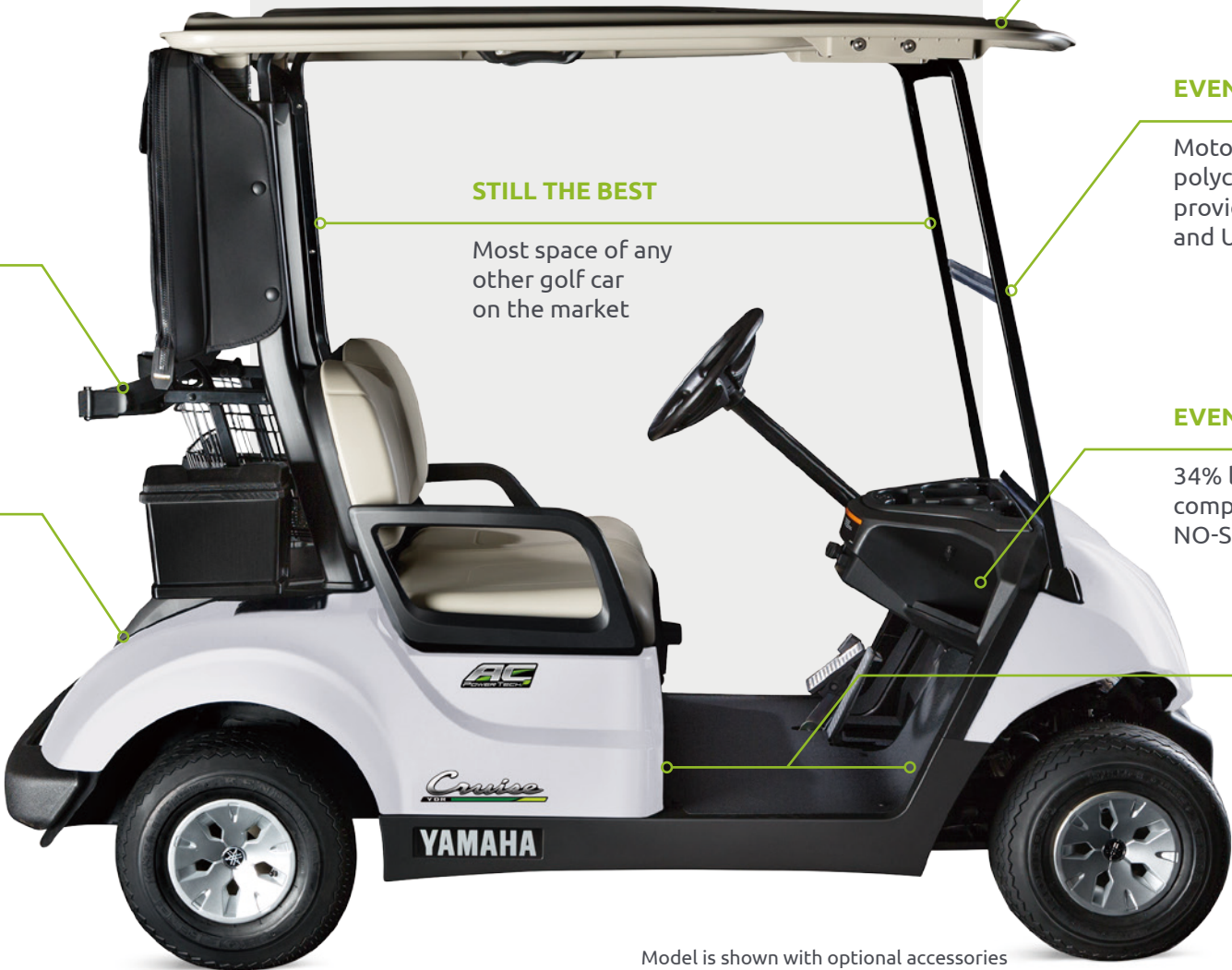
Model is shown with optional accessories