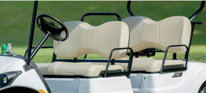
Equipped with the widest bench seats in the class, generous legroom and outer armrests.