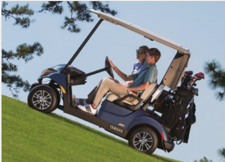
PowerTech AC cars prioritize energy efficiency while offering all the power you need.