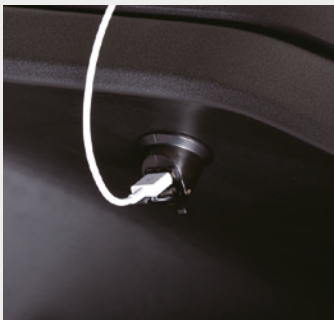
Two USB ports to maintain power and stay charged.(option)