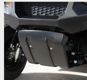
Skid plate for non-extreme off-road protection.