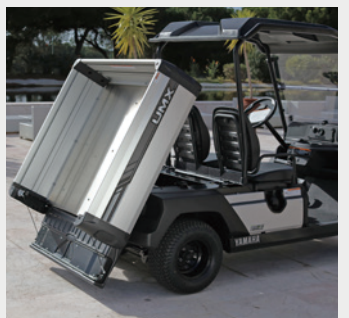
Aluminium cargo bed with one-touch tailgate.