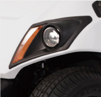
Automotive inspired LED headlights shine brighter and use less energy.