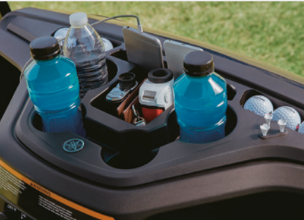
Automotive style dash for more accessories.