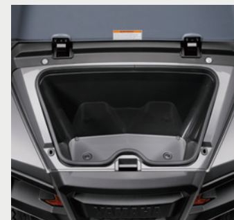
29-litre front storage box with one-touch opening.