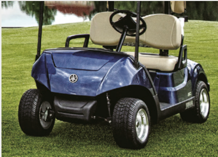
New body styling for Cruise clean tech technologies.