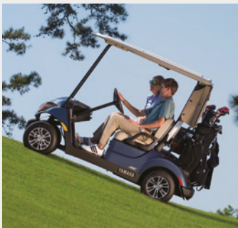
PowerTech AC cars prioritize energy efficiency while offering all the power you need.