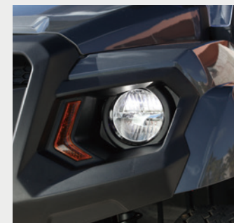
Reflector type LED lights for night time use.