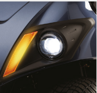
Automotive inspired LED headlights shine brighter and use less energy.