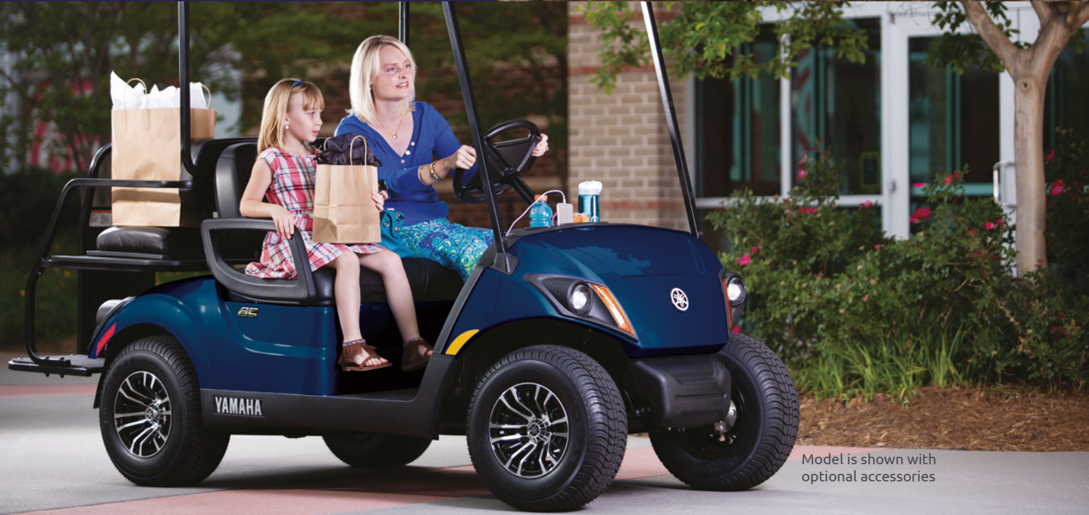
Model is shown with optional accessories