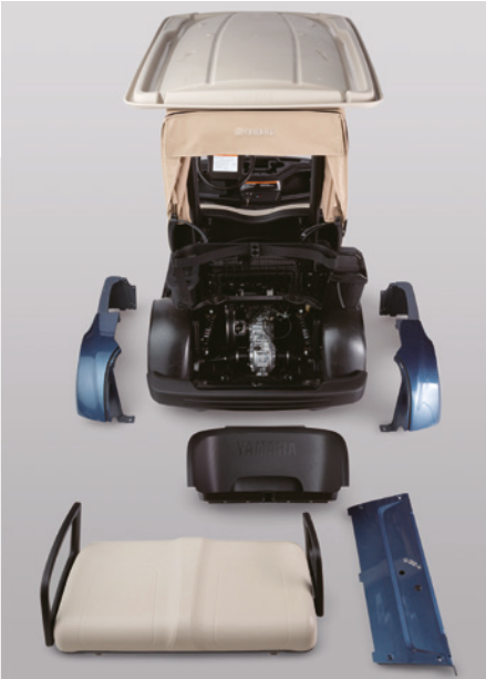
Removable modular body panels to lower costs for maintenance and damage repairs.