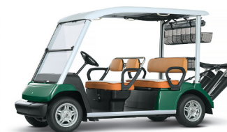
DARK GRAYISH GREEN METALLIC