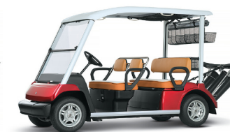
DEEP RED METALLIC