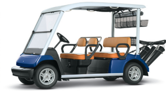
DARK PURPLISH BLUE METALLIC