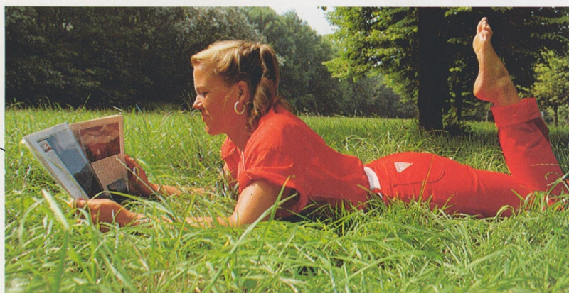
51 dB: soundlevel in a park.