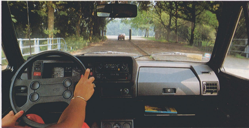
59 dB: soundlevel inside a car, driving at 30 mph.