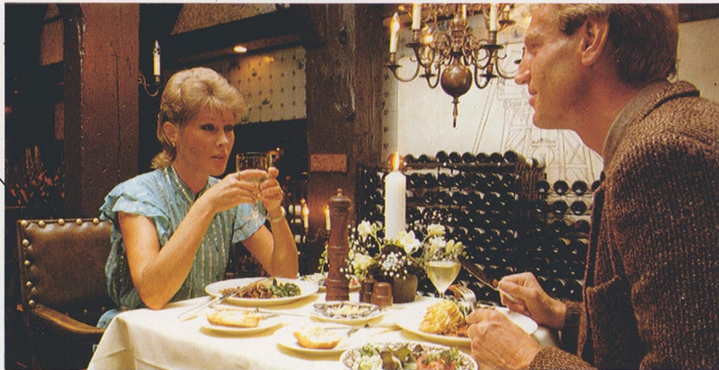
57 dB: soundlevel inside a quiet restaurant.