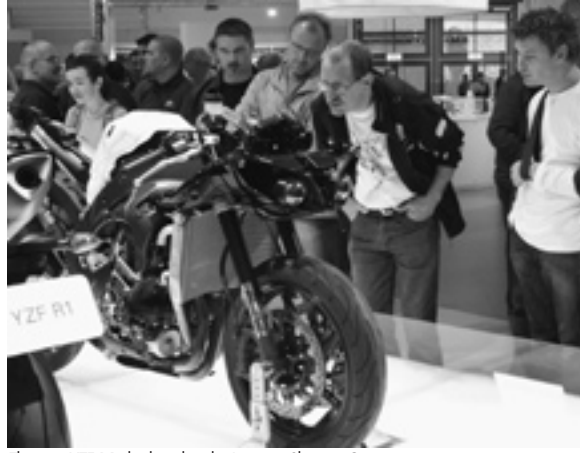
The new YZF-R1 displayed at the Intermot Show in Germany

motorcycle enthusiasts turn to get longawaited look at the new YZF-R1. At Intermot, the new R1 was displayed at a booth themed "The Art of Engineering." At the Milano Show, the Yamaha booth