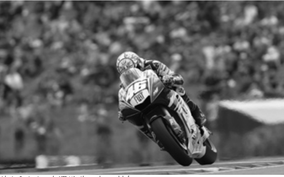
Valentino Rossi racing on the YZR-M1 with crossplane crankshaft

Nishida : Until now we had been thinking in terms of the excitement that the machine gives the rider. But with the new R1 it is the excitement the rider feels from having perfect control over the machine and having the machine respond to the rider's every intention.