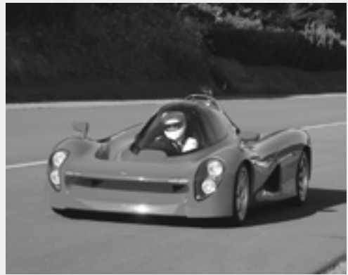
The OX99-11 GP supercar mounts a Yamaha F1 engine in an aluminum chassis hand crafted in the British tradition. Sixteen years after its 1992 debut it is still a thrill to watch.