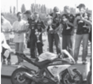
A standard YZF-R125 won the 24H race at Harzring in Germany