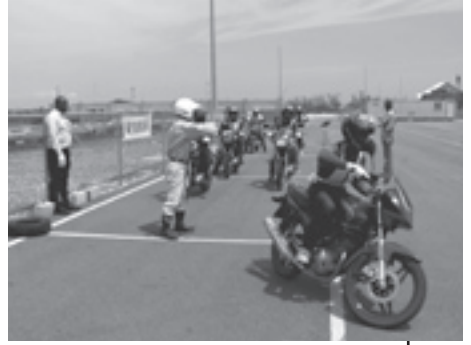
At the YRA in Jamaica 16 general customers took part

On the final day operators were taken out on a day of fishing to compare 2-stroke and 4-stroke engine performance