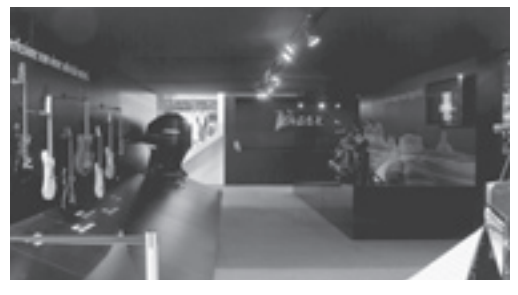
Along with the 2009 two wheelers, Yamaha marine and Yamaha Corp. music products were displayed for a full brand experience