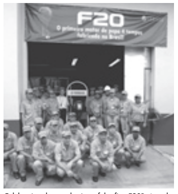
Celebrating the production of the first F20B 4-stroke outboard in Brazil

Yamaha Motor da Amazônia (YMDA) is proud to announce the start of production of the 4-stroke outboard motor F20B at its Manaus factory in December 2008. The F20B is the fourth outboard model produced at the Manaus factory after 15, 25 and 40 horsepower Yamaha 2-strokes and it is the first 4-stroke model ever produced in Brazil. The F20B is also important because it makes use of a tax incentive by being produced in Manaus city and gives Yamaha the means to answer the growing demand for 4-stroke outboards with a domestically produced model. Now Division Nautica of YMDA has set itself a new target of making Brazil the second largest marine sales country for Yamaha in the world, after the United States.