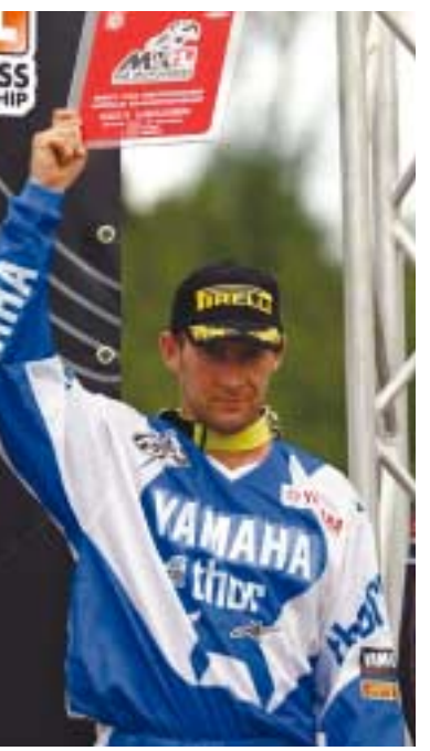
In the first 11 rounds of the season, Coppins has had nine podium finishes including five overall wins