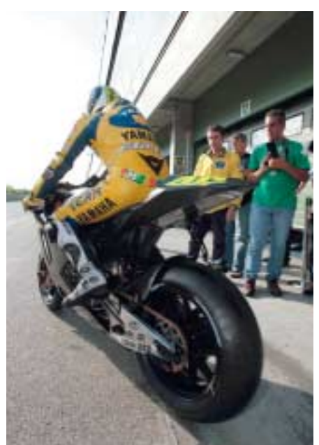
At the tests the day after the Czech GP in Aug. 2006