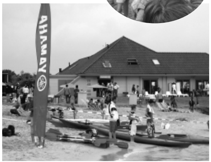
The celebration continued the next day at a beach in southern Holland