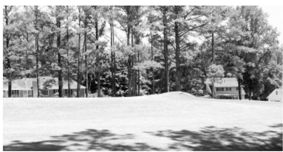
Many residential areas have their own golf course

In vogue: As more and more baby boomers are becoming more aware of their lifestyle and health, sports clubs are beginning to pop up almost everywhere. Other popular shops like Tanning Salons and Coffee Houses are appearing on what seems like every street corner. On the technology forefront, Plasma Flatscreen Televisions, Playstation 2s, Blackberry wireless e-mail, and the Apple I-Pod are big hits, and as transportation costs rise, hybrid cars are becoming very popular.