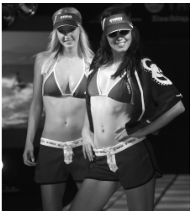
The new product introductions were made in a fashion-show type presentation

From Catherine Hauet, PTW Communication Dept., YMENV, The