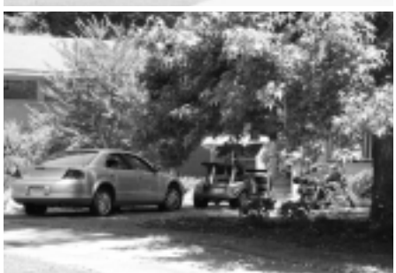
Everybody has a golf car

"closed community" market, where people drive golf cars to go grocery shopping, to school and of course to the golf course. In a community like Peachtree City near YGC, the city has installed paths dedicated to golf cars. Many homes have garage spaces reserved for golf cars. In the grocery store parking lot, you see original golf cars painted in various colors and uniquely decorated. Some of them come with even air-conditioning and fancy stereo sets.