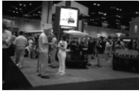
At the PGA Show

Yamaha and two US manufacturers share almost 100% the golf cart business in North America. We at YGC visit golf courses on a daily basis to discuss business and put on demonstrations of our products. Participation in the golf industry shows is another important activity we engage in.