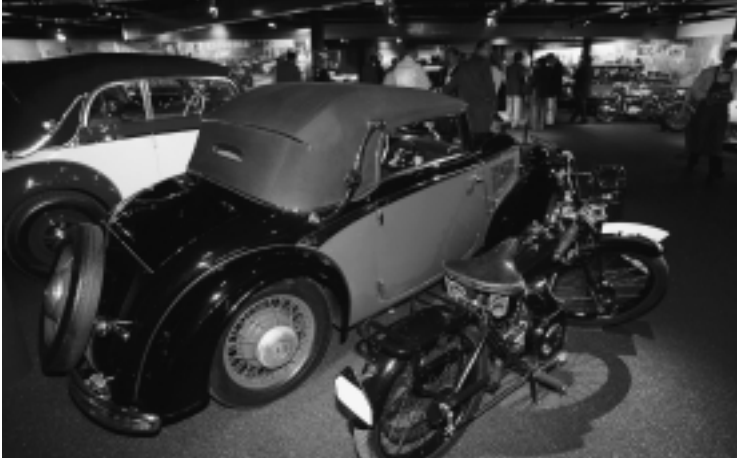
A fantastic museum of the vintage vehicles D'leteren Sport has handled