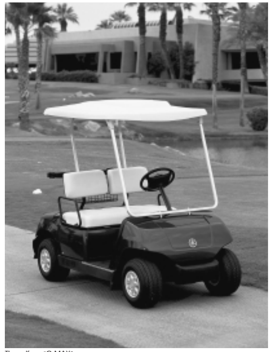
The golf car "G-MAX

There are gasoline and electric golf cars in the market and the breakdown is about 35% gasoline and 65% electric. The electric golf cars are favored in the warm and flat areas of the southern US, but the golf cars of choice in the north, where it is colder and often hilly, are the gasoline