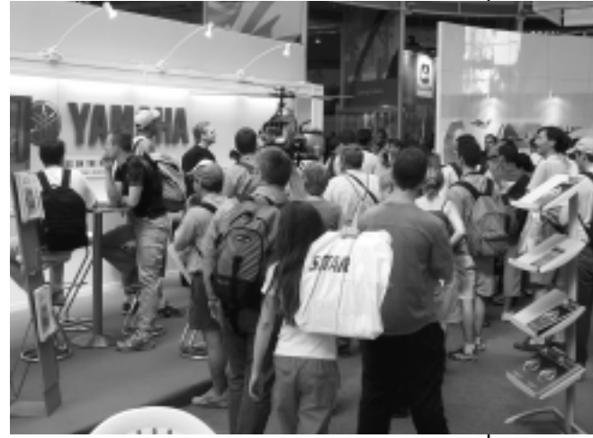
The steady flow of visitors to the Yamaha booth enjoyed displays like a simulation station for remote flight control of the helicopter