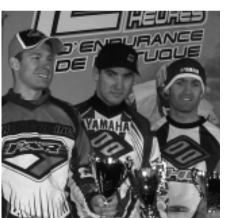
The captains of the three top finishing teams