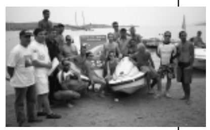
BURLA supplied WaveRunners for the first S-1 slalom race competition

The Turkish Jet-Ski Federation organized the First S1 Championship in the Bodrum region with the sponsorship of the Yamaha marine distributor BURLA Machinery Trade & Investment Company with support from its local dealers. The event was held on May 19th, which is Youth and Sports Day. Thanks to BURLA's close relations with the Federation, four units of Yamaha XL700 WaveRunners were used in the 1st leg of the Bodrum races. BURLA