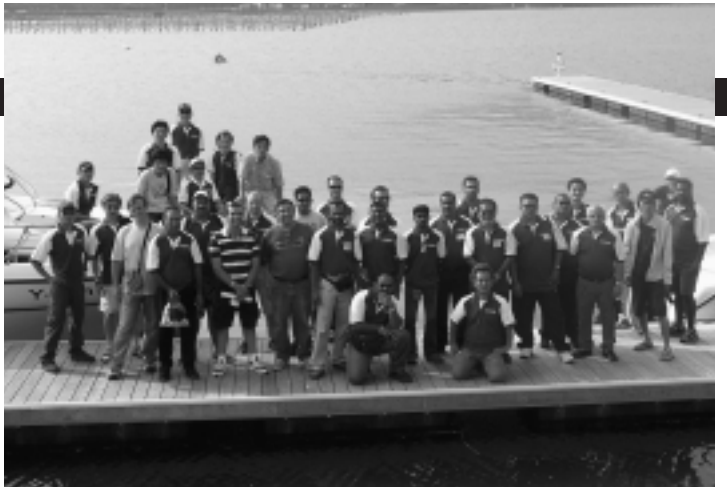
The service representatives attended this technical seminar from 14 countries