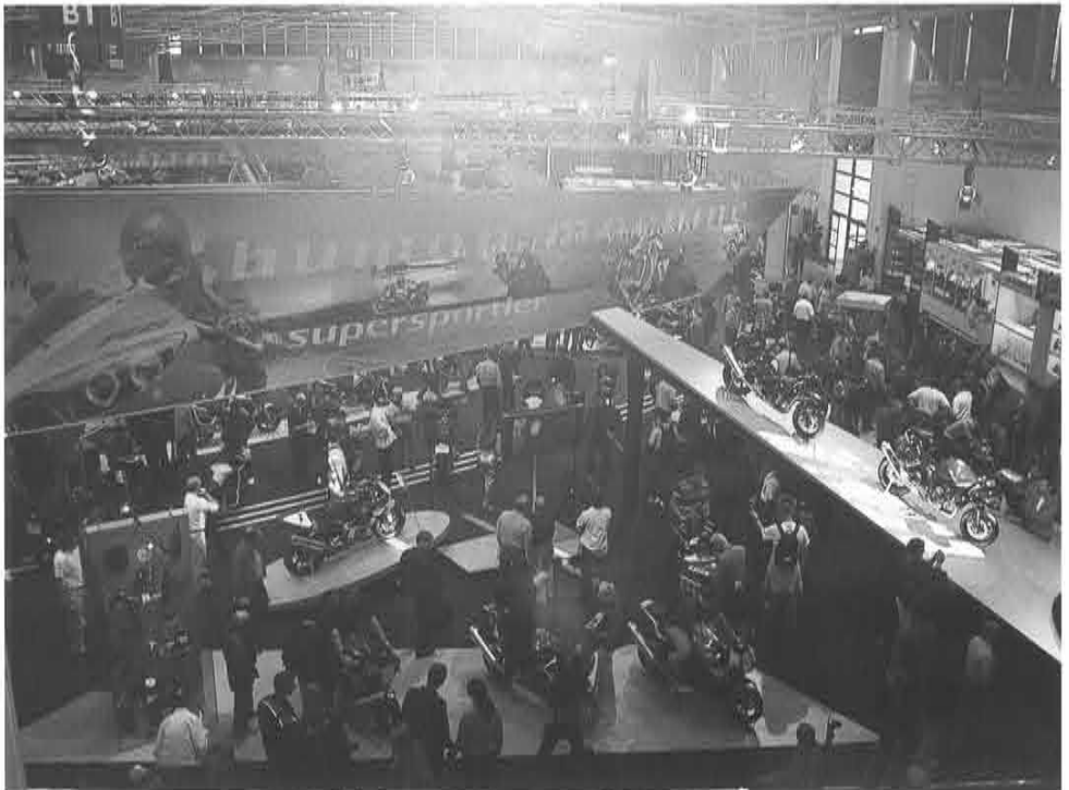
With the key words "Humachine technology" as its theme, the Yamaha booth displayed about 100 models in its spacious 1,320 sq.m. facing the main entrance