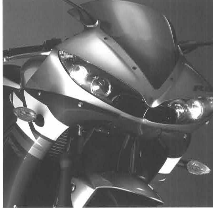
In particular the design sought to emphasize the increased intake performance of the new engine by creating the impression that the machine is actively pulling air into itself

But, no matter what kind of metal is used, the performance we are after doesn't change, so there was never any doubts about what we had to do. And, in the end