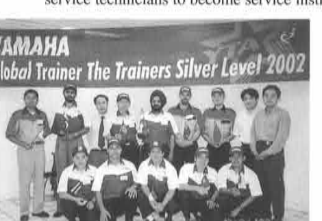
The 14 participants, after enjoying their studies

rom August 19 to 23, a Yamaha Technical Academy (YTA) "Global Train the Trainer – Silver Level" seminar was held at Indonesia's Yamaha distributor PT. Yamaha Motor Kenkana Indonesia (YMKI). This seminar aims to train service technicians to become service instructors under the "Global Train the Train-