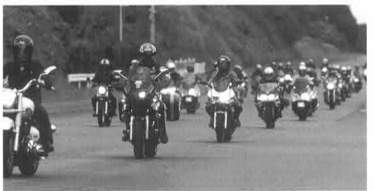
About 200 Yamaha bikes took part in the closing parade

Another important factor affecting product life is the quality of engine oil and spare parts used. This is especially true in Africa where lower quality substitutes are often used. In Mauritania, where coastal fishery for octopus is booming, the local distributor, Groupe Mauritaninne des Industries de Pêche (MIP),