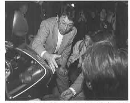
could be seen studying the cut-open display model of the R6 intently. Meanwhile, other enthusiasts could be heard

Amidst these trends, this year's Yamaha booth was organized around the key words "Humachine technology." Among the displays of new Yamaha models in each category, the new YZF-R6 was especially popular. Fascinated fans could be seen studying the cut-open display model of the R6 intently. Meanwhile, other enthusiasts praising the new