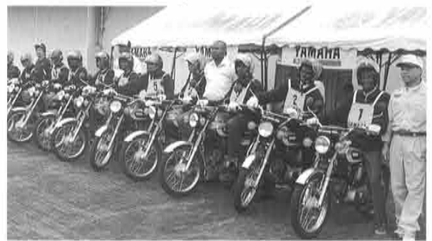
Participants ready to their training