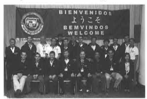
The meeting received high praise from participants

A meeting of Latin American distributors of Yamaha Power Products was held in Lima, Peru on July 11. It has been around ten years since a meeting of this type gathered Power Product distributors from all over Latin America. The meeting was attended