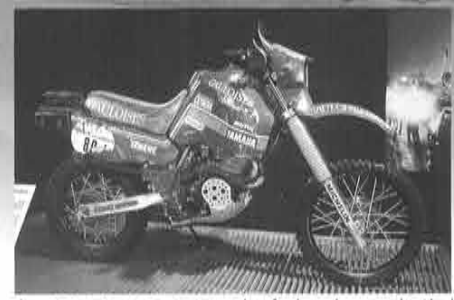
The 1985 XT600 Ténéré. The fuel tank was divided into a main tank and two side tanks in order to achieve a machine layout that allowed an ideal riding position and weight balance. Air-cooled 660cc 4-stroke engine

In this XTZ850R we can see an aspect that would affect Yamaha's policy in World GP road racing some years later. In 1991, when the decreasing number of participants in the WGP 500cc class threatened the very existence of the com-