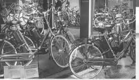
Bicycles by Sparta mounting Yamaha PAS power assist units stood out at the IFMA Cologne 2002 show