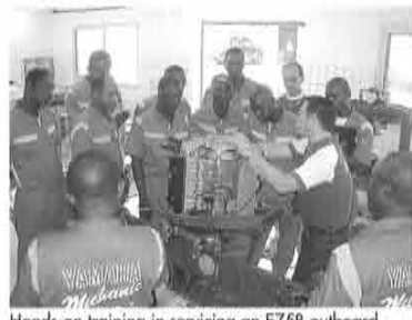
Hands-on training in servicing an E75B outboard

Another important factor affecting product life is the quality of engine oil and spare parts used. This is especially true in Africa where lower quality substitutes are often used. In Mauritania, where coastal fishery for octopus is booming, the local distributor, Groupe Mauritaninne des Industries de Pêche (MIP),