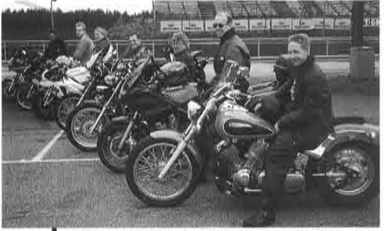
Riders of all types of Yamaha motorcycles - custom, touring and supersport - have their go on the track

Participants and instructors alike are very pleased with the course. Yamaha Motor Sweden plans to continue the