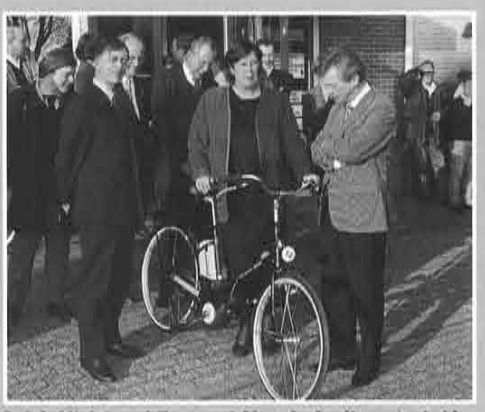
Dutch Minister of Transport Mrs. A. Jorritsma test rides the Yamaha P.A.S. powered PHAROS, which would ease traffic congestion

The government of the Netherlands is considering special incentives for people using bicycles to commute to work in an attempt to try to get people out of their cars. With the user- and environment-friendly PHAROS, there are no excuses any more not to use a bicycle. The Yamaha PAS has been launched in the European market for the 1998 season. Yamaha Motor Europe is selling the PAS in the European market on a CBU (Complete Build Up) basis and an OEM basis.