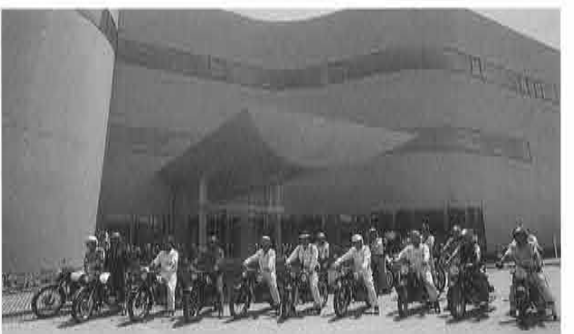
Some groups of owners of vintage Yamaha bikes like the YA-1 visited Communication Plaza to celebrate its opening

see models manufactured overseas like the MBK-built BW's Booster Rocket, the scooter that has won unprecedented popularity in Europe, and Southeast Asia's first 4-stroke moped, the Crypton, built by YIMM of Indonesia. Of course the displays are not limited to motorcycles. On the steel-gray stages stand an impressive lineup ranging from water vehicles, snowmobiles and racing karts to GHP air-conditioning units, industrial robots and much more.