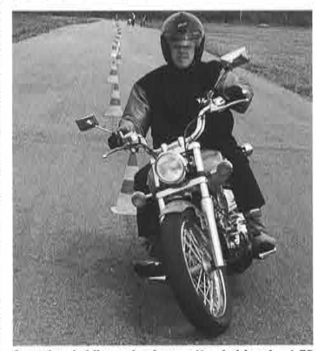
A weekend riding school was attended by about 50 Yamaha owners to practice their skills after the long Finnish winter

A motorcycle riding school for Yamaha owners was organized by the Finnish Yamaha importer Oy Arwidson Ab with the Zoo Motorcycle Club. The Yamaha weekend was held on May 30-31 this year, with about 50 riders practicing their skills. Participants had mainly custom bikes, but there were also some other models like the Thundercat and the FZS600.