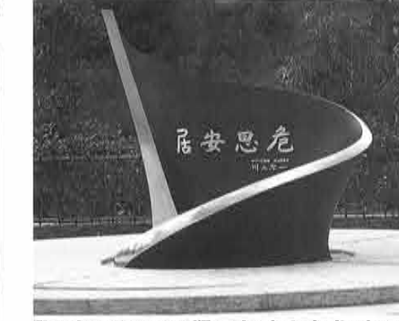
The characters say: "To relax is to invite danger; to be prepared is to prevent it."