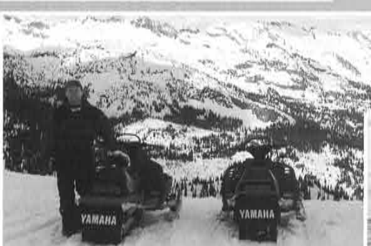
A YMCA district Sales Manager touring in the Rocky Mountains of British Columbia

Our natural beauty is admired throughout the world. From the majesty of the Rocky Mountains, to the ruggedness of our northern regions, from the beauty of Niagara Falls to the uniqueness of our maritime provinces, we truly live in an incredible country. Because of the natural beauty we live in, Canadians have always been active participants in outdoor activities.