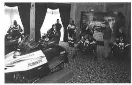
20 Snowmobile models toured Canada, including the redesigned Phazer