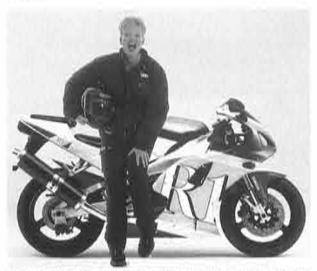
The specially designed R1 is part of one of the biggest promotions in Germany for Yamaha