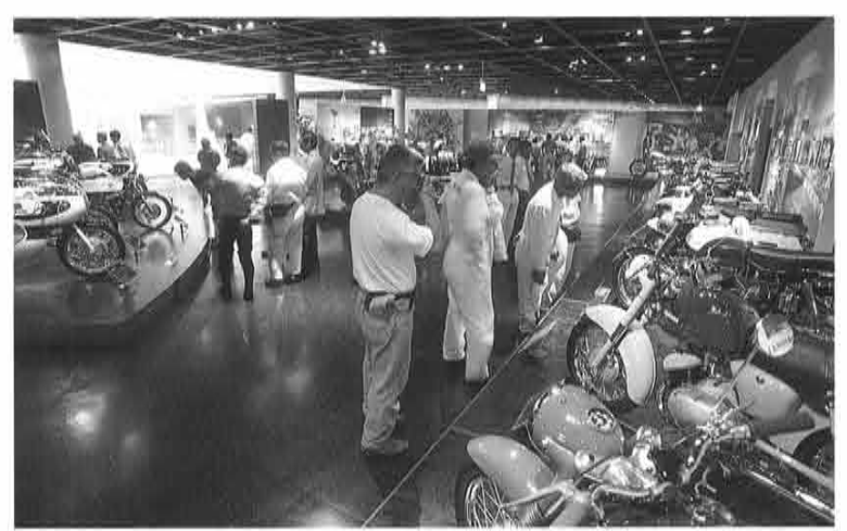
Internationally famous racing machines like the RD56 and RA31 and 30 representative models dating back to the company's founding are on display here