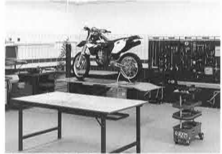
The refurbished YMG workshop serves as a model for the new Eurowide Standard Workshop

While there is great interest in the progress of the unification of European economic blocks at present, there have also been some unifying developments within Yamaha's motorcycle service network in Europe.