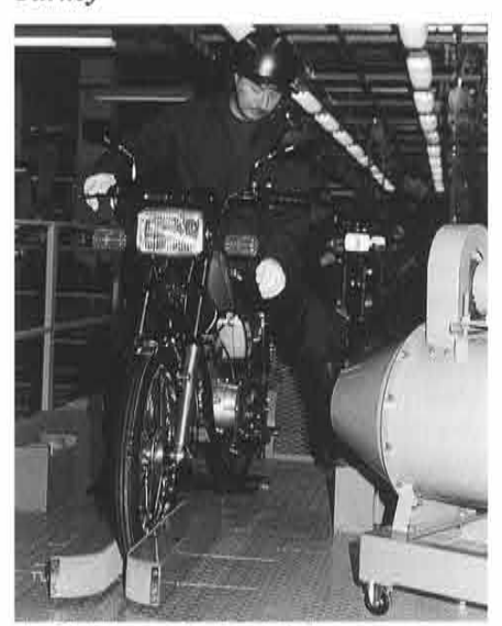
The RX-115 assembly line at Beldeyama