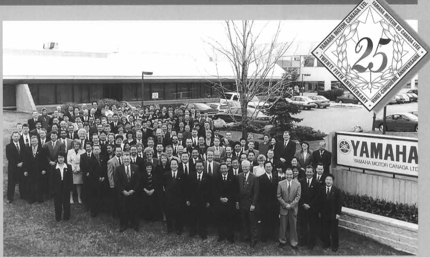
All employees of YMCA gathered together to celebrate our 25th anniversary in Canada. Following the ceremony, the staff mingled with other invited guests and enjoyed lunch at The Old Mill Restaurant, a Toronto heritage site which dates back to 1793

land. During the 1997 season we also supported nearly 60 different consumer shows or events with an estimated reach of 2.5 million customers, roughly 10% of all Canadians. We also get to the grass roots level through our commitment to sponsorships of various activities such as motorcycle, water vehicle and snowmobile racing, professional angling, club events and local community events. These activities continue to reinforce our commitment to not just selling product, but to being an integral part of our community.