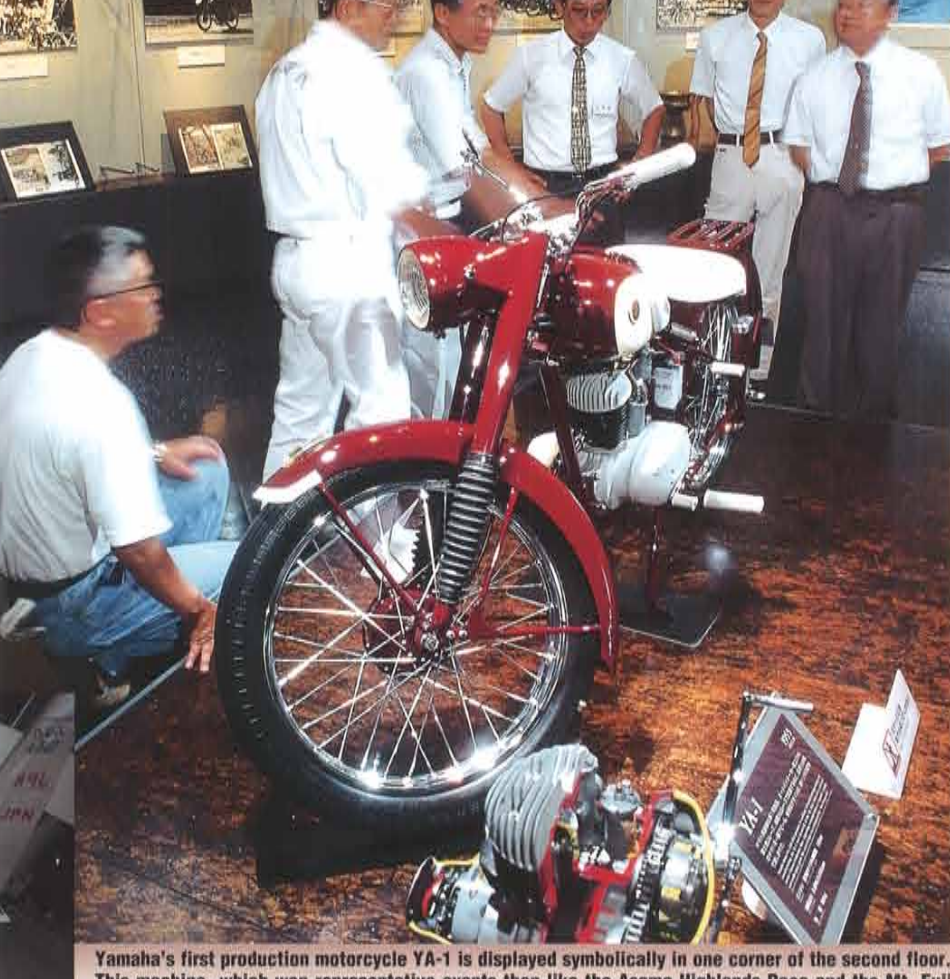
Yamaha's first production motorcycle YA-1 is displayed symbolically in one corner of the second floor. This machine, which won representative events then like the Asama Highlands Race and the Mt. Fuji Ascent Race, embodies the origin of Yamaha Motor, a company which has always been dedicated to racing

shining brightly in the midday sun, the new Communication Plaza building is defined most prominently by the cylindrical turret that rises above the rest of the threestory structure to the left of the main entrance and the smoothly curving line with which the main part of the building extends away from it.