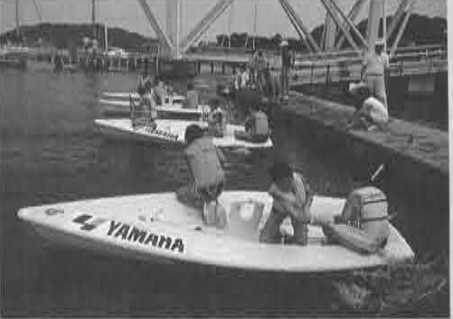
Ready to go in the paddle race!

Four Yamaha MiniHoppers were prepared for this event. With two children paddling and one at the tiller, participants raced out and around a marker set offshore from the bridge at the lake's mouth. At first, many of the inexperienced young racers found it hard even to navigate to the marker, but as they gradually got the knack, the event turned into an exciting competition, with avid young paddlers spurred on by their cheering friends.