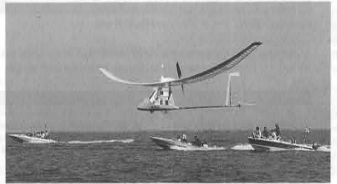
The Gokuraku Tombo maintains well-balanced flight under the slightly windy conditions.

In front of some 35,000 spectators, one of the Yamaha teams "COGITO 1" finished a 200m straight course dash in 44.69 seconds to win both 1st place in the Man-powered Speed Boat Class and the Transport Minister Prize, giving Yamaha its 2nd consecutive conquest.