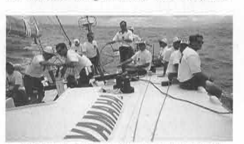
In addition to boat quality, crew work is another important aspect of race performance.