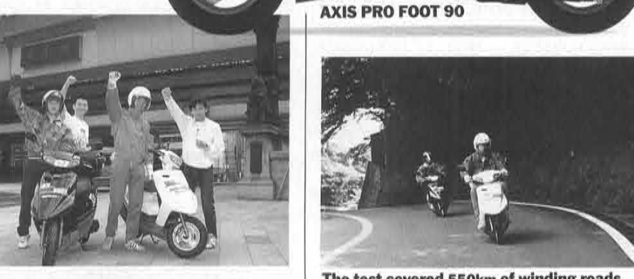
The test covered 550km of winding roads and city traffic without refueling.