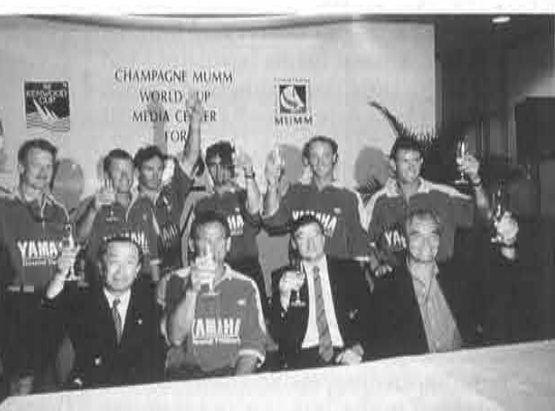
A toast at the race press conference.

With less than a year to go before the start of the Whitbread Round the World Race, we wish all the crew of the Yamaha Round the World syndicate the best of luck in their ongoing preparation campaign.