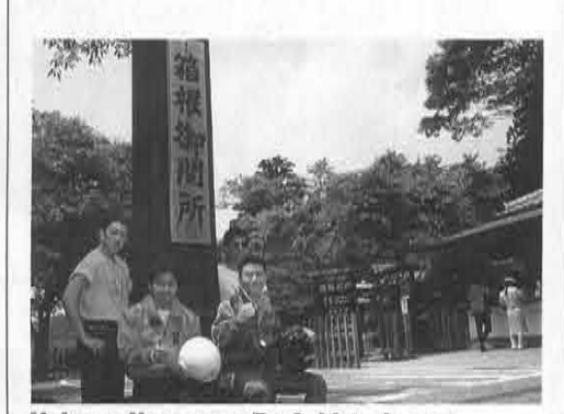
Hakone, Kanagawa Pref., historic spot of one of the old barrier stations of the old Tokaido.