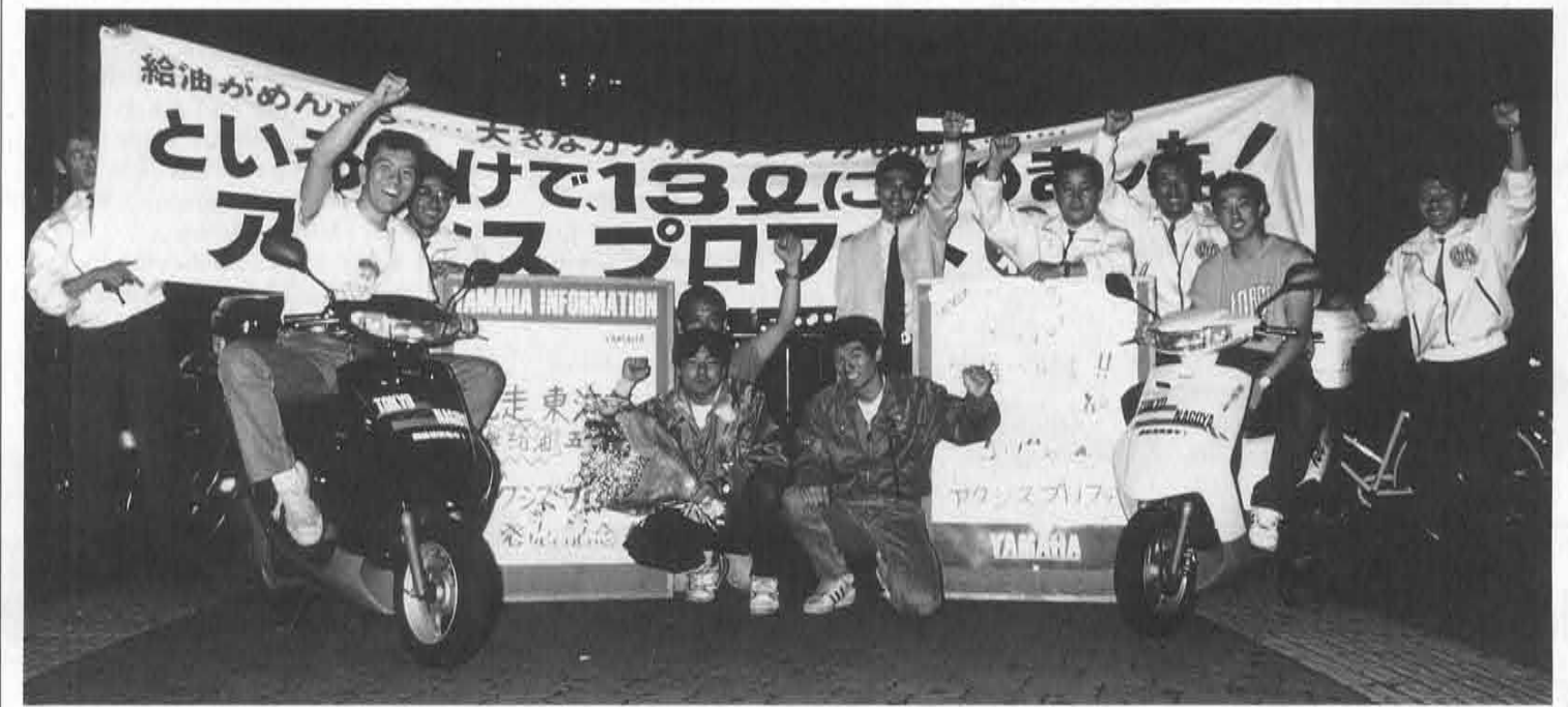
The staff that completed the Tokyo-Kyoto no-refueling trial.