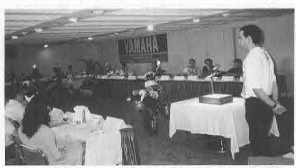
Guatemala dealers participated earnestly in the first

meetings, the dealers from both Guatemala and Costa Rica reconfirmed their pride at being Yamaha dealers and refreshed themselves to start building even stronger sales strategies in their respective motorcycle markets for the rest of the 1992 season.