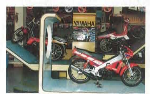
The popular line-up of Sport Mopeds attracts many young people. The ZR-120 (front), BELLE-100 (right) and BELLE-R (left) on display at a shop.

SPORT MOPED TYPE: This type is manufactured exclusively for the most competitive sector of the Thai motorcycle market. This type consisits of four models; the BELLE-100, BELLE-R, ZR-120 and the JR-120, the latest model which just entered the mar-