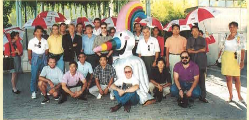
Importers attending the meeting also visited the Sevilla EXPO.

From September 3 to 5, the 17th annumber one position for 1992. nual Yamaha European motorcycle The meeting concluded with the un importer meeting was held in Marbella, Spain, gathering 100 participants from 19 countries.