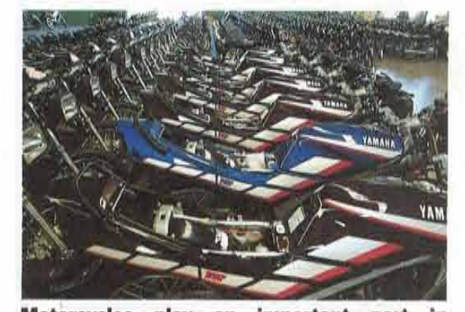
Motorcycles play an important part in people's daily lives in Thailand and the market has been growing dramatically.

In Thailand, more than 6,000,000 motor-cycles are playing important roles as indispensable means of daily transportation. On the average, one out of 9 people in our country owns a motorcycle, which means only Taiwan and Japan have a higher ownership ratio than Thailand's. With this growing market, it is believed that the yearly motorcycle demand will reach one million units in near future.