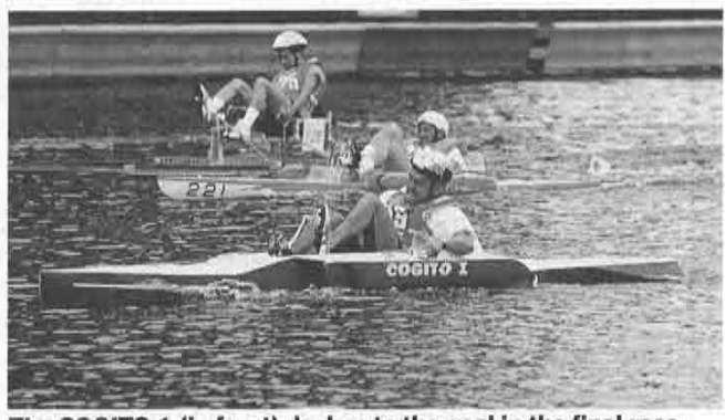
The COGITO 1 (in front) dashes to the goal in the final race.