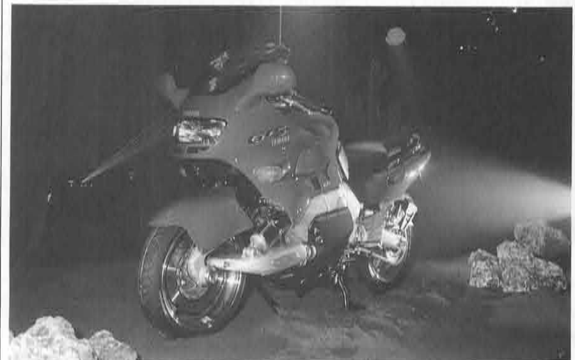
The GTS is introduced with the aid of a laser display.

New Yamaha GTS1000 unveiled to importers and press in Spain