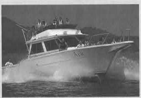
Children enjoy cruising around the lake.

were used to take children on a cruise around nearby islands. With the boat's captain as guide, the children received a tour of the lake as they enjoyed waving to fishermen and other boaters along the way.