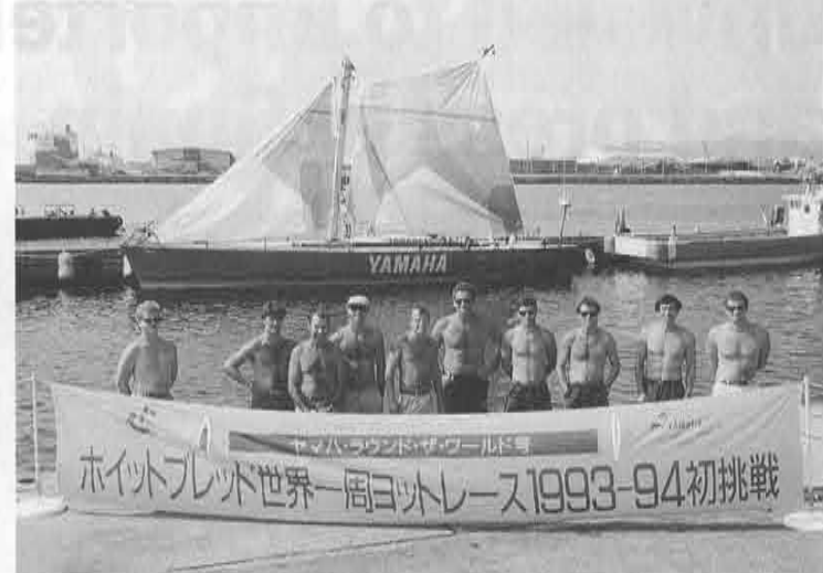
The YRW and its crew after arriving safely in Gamagori.