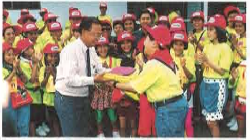
Thailand Junior Singing Contest is one of the ways to discover and bring up young artists.

This project gives young artists a great opportunity to exhibit their talent, such as playing musical instruments and singing. In doing so, it encourages youth to contribute the society in productive ways.