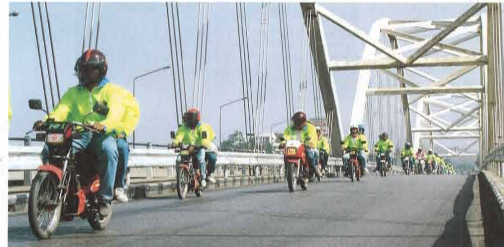
A large number of participants enjoy the Yamaha Anti-Pollution Caravan Rally.

SIAM YAMAHA and provincial Yamaha dealers initiated a unique project that combines a caravan tour and an exciting rally. Participating customers join in tree-planting and releasing young fish in waters to encourage consciousness and appreciation of the blessings of nature as they enjoy touring in the countryside.