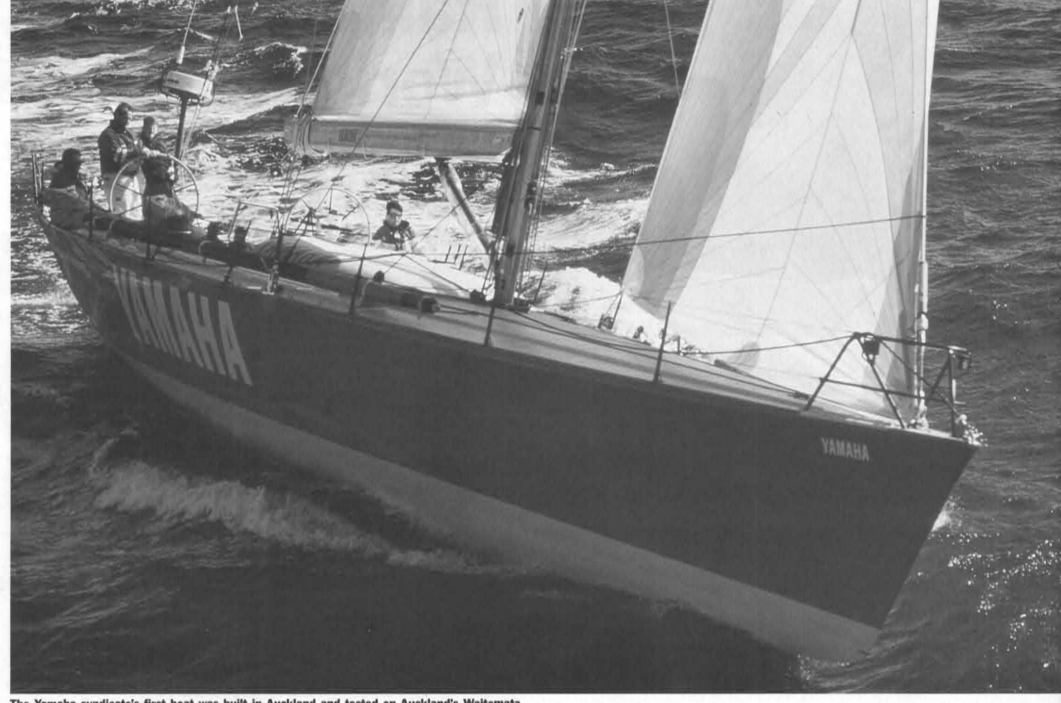
The Yamaha syndicate's first boat was built in Auckland and tested on Auckland's Waitemata Harbour and Hauraki Gulf before participation in the Kenwood Cup.

W60 class Yamaha boat competes successfully in Kenwood Cup