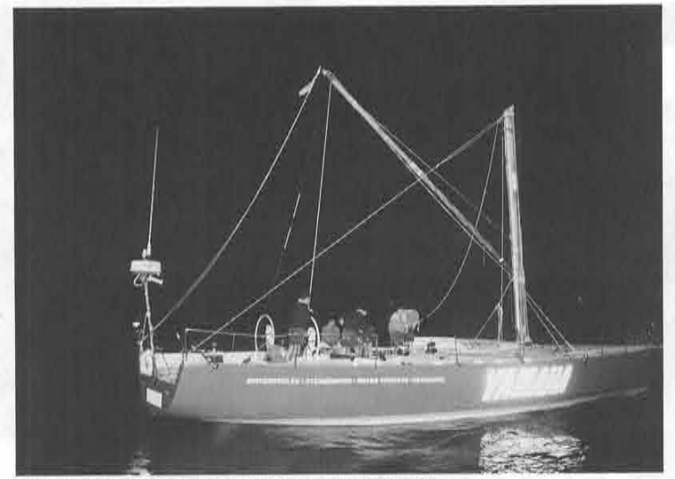
The dismasted YRW enters Gamagori Harbor.