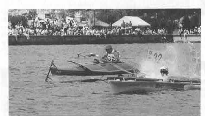
The Break Now - Imagiri (the leading boat) is a speedy hydrofoil type boat.

This was a very successful solar-powered boat race contested by 56 teams, including one from America. After the dead-heat contest with an arch rival "Soland," the Yamaha employees' team the "Break Now - Imagiri" chaptured the overall win. Also, the 4th Hamanako Solar-powered Boat Race was held at Yamaha Marina Hamanako in the end of July, and