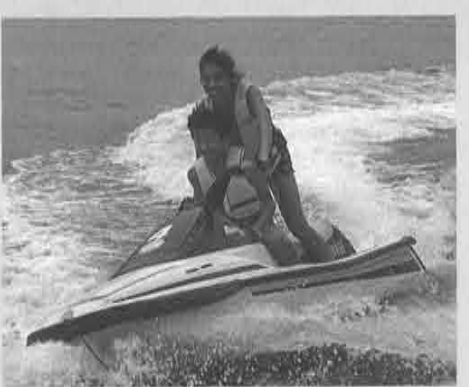
"I love the feeling of speed."

Five Marine Jets (MJ650 TL Water Vehicle) were prepared for this event. With an instructor operating the Water Vehicle, children were given a thrilling 4-5 minute ride one at a time. Some children came back as many as three or four times for rides.