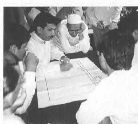
The Education and Training Program dealt with issues in a practical way that motivated participants highly.

After completing this 4-day program, the participants were unanimous in their conviction to further promote of the 3-S Shop Campaign as a way of building customer satisfaction and trust in Pakistan.