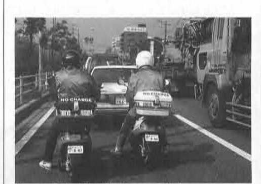
Immortalized by the famous Ukiyo-e painter Hiroshige in the 18th century for its 53 lodging towns and beautiful scenery, the Tokaido of today is the busy thoroughfare National Route 1.