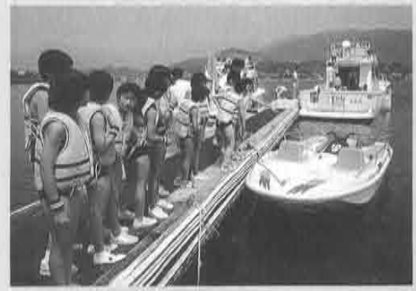
"Is this the Jet Buddy? Looks exciting!" Shown in the photo is the dock-type.

Children were given a different kind of cruising experience on the "Jet Buddy", a new type of craft that is attached to a Water Vehicle as its means of propulsion. The "Jet Buddy" has been the focus of attention among marine fans since their unveiling at this year's Tokyo Boat Show in two models, a dock-type and a pull-type.