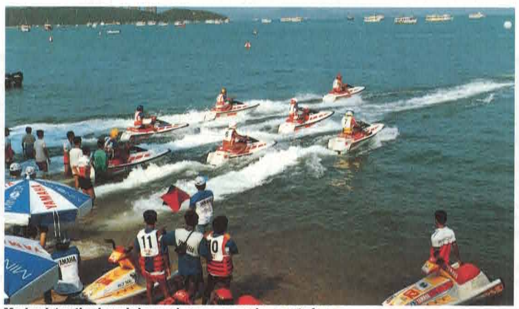
Marine Jet enthusiasm is increasing among marine sports fans.

A wide variety of marine sports are enjoyed by the large number of tourists who visit our country's beautiful seaside resorts in the gulf and the Andaman sea in Thailand. Answering their needs, we offer a line-up of eleven Yamaha outboard models, both 2-strokes and 4-strokes ranging from 2 to 250 horsepower. The Marine Jet is one of the most popular products that YAMAHA offers to our marine customers.