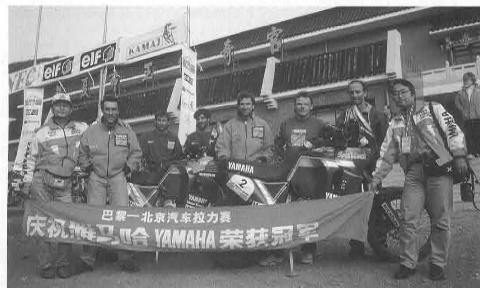
Near the Great Wall just after the finish

1st WEST-EAST PARIS-MOSCOW-BEIJING MARATHON RAID