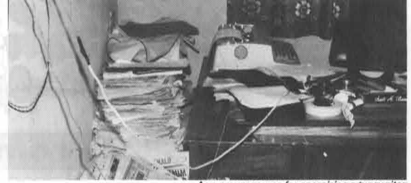
As a power source for energizing a typewriter