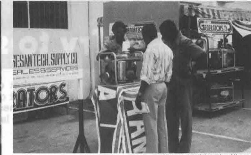
What a wonderful product! (Lagos)