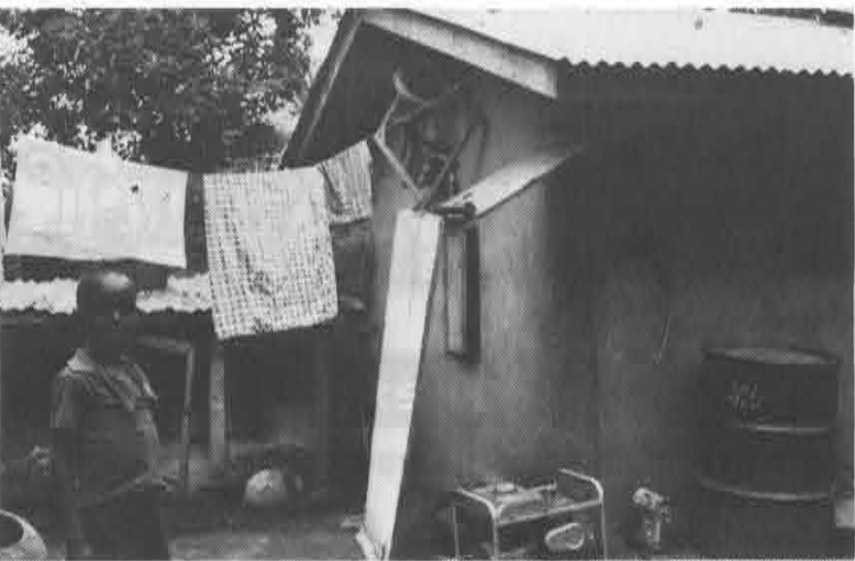
As a power source for household lighting