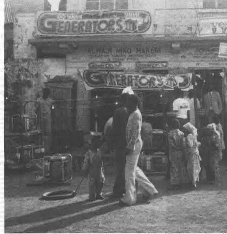
Yamaha is the first brand to advance into Jos, a northern city.

Yamaha was the first to promote this sort of campaign for Nigerian users and therefore, public response to it was much more impressive than anticipated. Yamaha's positive attitude impressed favorably on them. Yamaha mechanics, aided by both Yamaha men, inspected and repaired all generators one after another in a masterly manner. Users' reliance on Yamaha's advanced techniques was greatly increased and the general image of Yamaha brand was exceptionally improved.