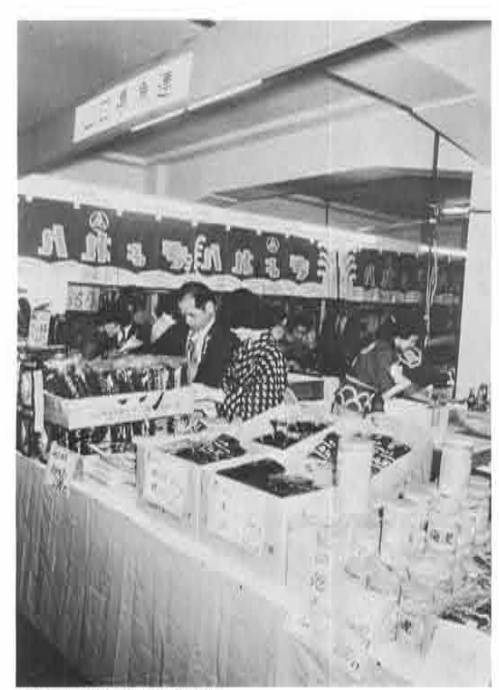
Local marine products