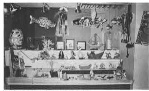
Various mascots for fishermen