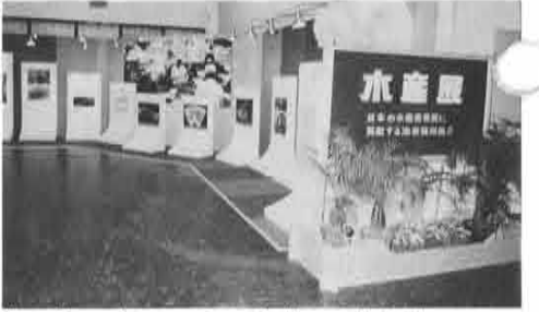
Panel boards are arranged all over the hall.