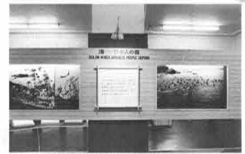
"Sea — the Mother of Japanese" is a theme.

Exhibits from all major boat manufacturers and other related industries were in rich variety. Yamaha producing the largest quantities of FRP fishing boats and varying sizes of outboard motors in Japan arranged a well-designed compartment with outboard motor models and impressive panel boards to make a special appeal to lots of spectators including visitors from abroad.