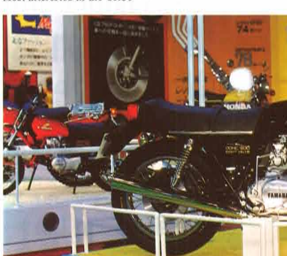
GX500, a real bike for sporty users