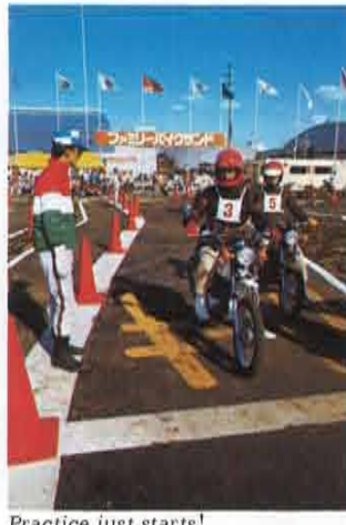
Practice just starts!

The motorcycle industry showed its positive attitude toward safe driving through the establishment of a unique family bike land. Occupying some 2,000m<sup>2</sup> on the southern part of the Harumi seaside court, the land was designed to be a ground for training novice motorcyclists. Instructors as appointed by each manufacturer taught visitors how to ride safely and correctly. 50cc bikes were used. That was the first attempt ever made in the Tokyo Motor Show and highly appreciated by visitors.