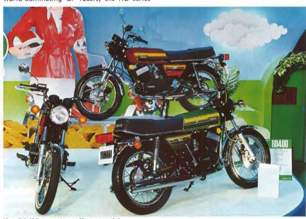
New RD400 comes in a café-racer model.

The brand-new RD400 and '76 RD250 are characterized by their popular café racer style.