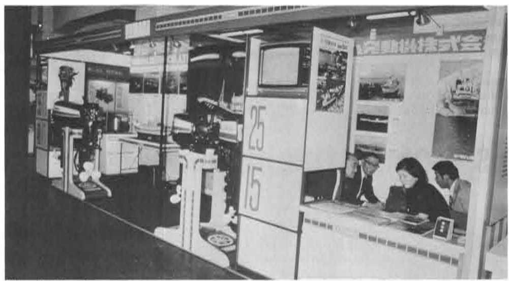
Attractive Yamaha compartment

Now, Japan is claimed to be the largest fishing country, so far as total value of catches is concerned.