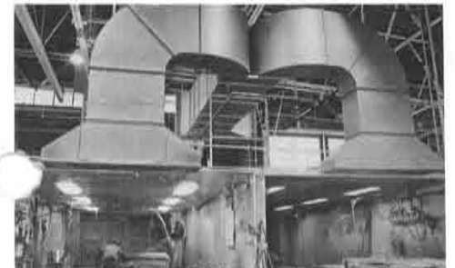
Applying FRP material in many layers

The Ofunato Plant of Yamaha which is located in Iwate Pref., Northeast District facing the Pacific Ocean, is now taking a vital role for the improvement of fisheries around North Janan.