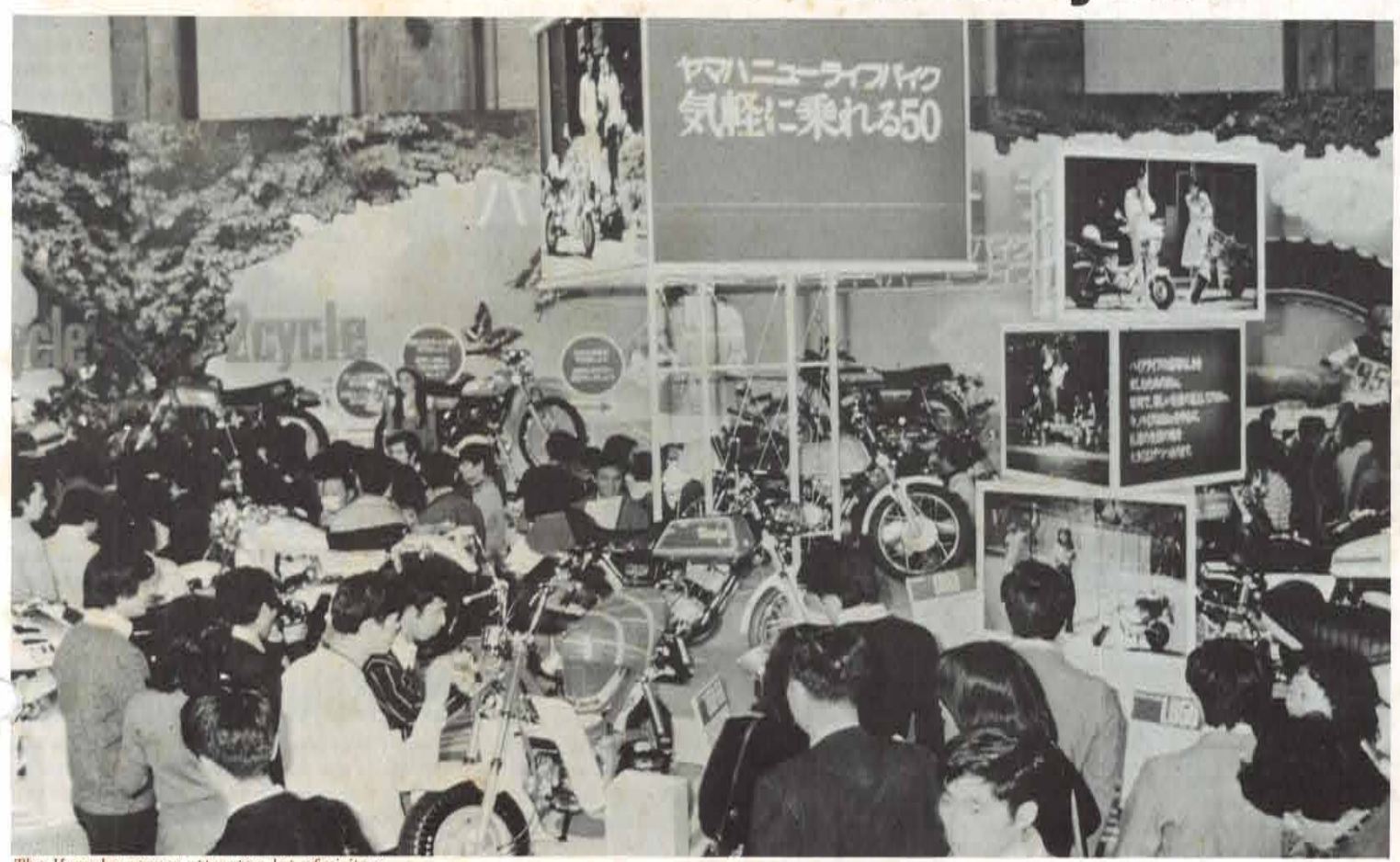
The Yamaha corner attracts a lot of visitors.

The 21st Tokyo Motor Show, now claimed to be one of the largest and most important shows in the world, took place for a 11-day period from October 31 at the International Trade Center, Harumi, the Bay of Tokyo.