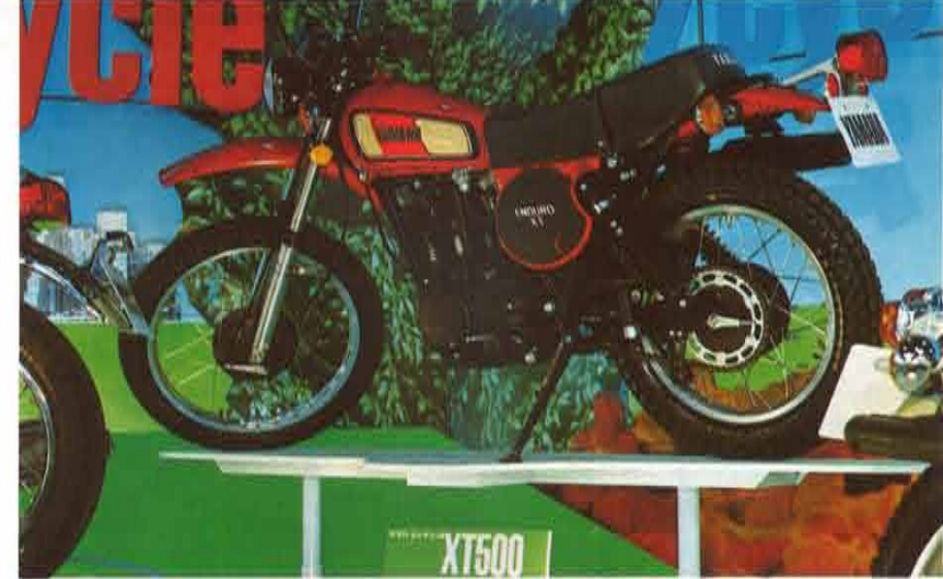
XT500 for action-loving enthusiasts

The leaning-forward single OHC engine features a great deal of Yamaha's technological achievements in the field of 4-stroke motorcycle engineering.