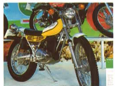
TY175 is a positive answer to trials fans here.