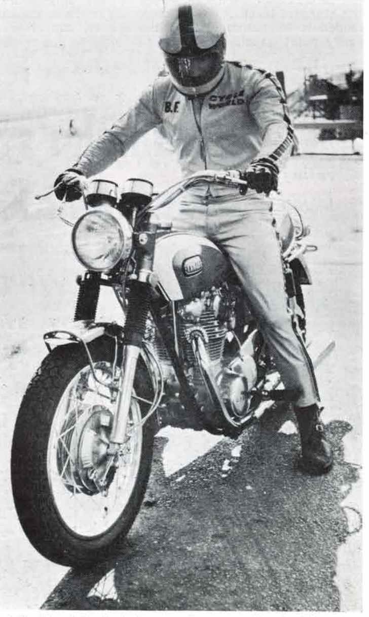
▲ The biggest Yamaha is always ready to get enlivened with one or two kicks.

Alternate 360-degree firing order is used, giving even firing impluses, and that familiar husky sound