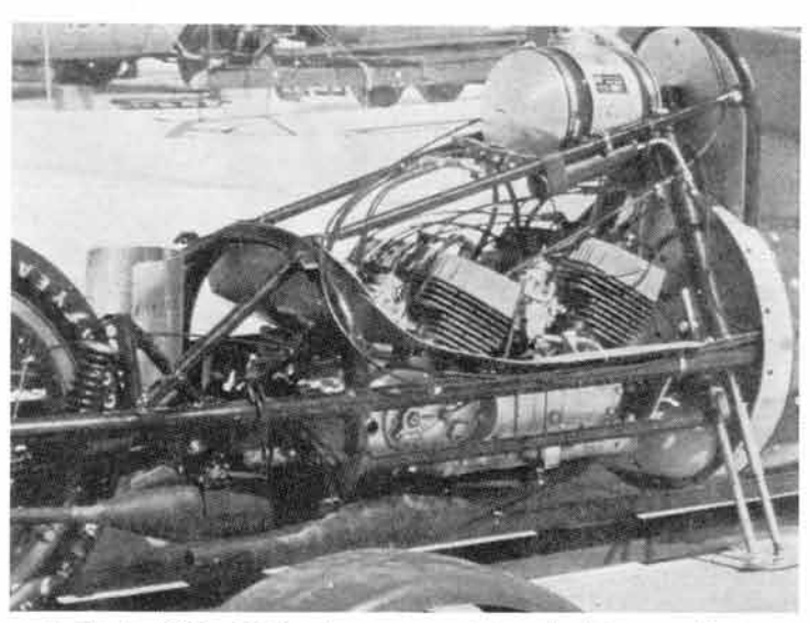
▲ The two 350cc TR-2 engines are coupled neatly into one unit.