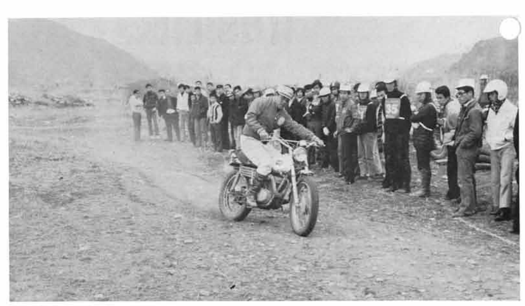
He is demonstrating his high techniques for trainees.