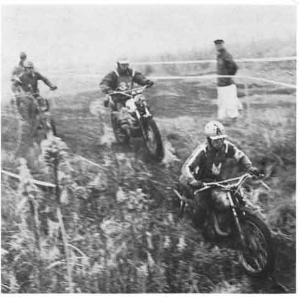
Trainees are following an model practice shown by an instructor.