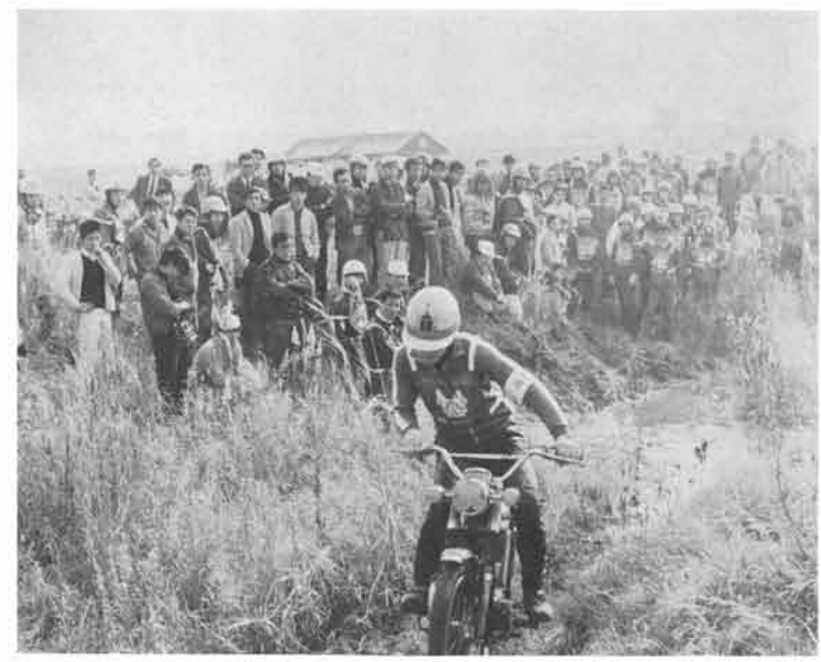
He is teaching how to go through muddy surfaces.