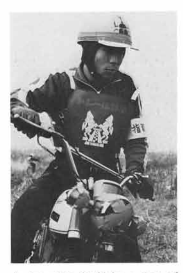
An instructor should be a man of character as well as a well trained rider.

It may be easy for us to just handle a motorcycle, but it is another thing to ride a motorcycle safely and correctly. Yamaha trail training school will satisfy any reguirement for ideal riding. Now, try to sponsor it for your customers. Your efforts as an instructor will bring you much more returns, expanding market of Yamaha motorcycles.