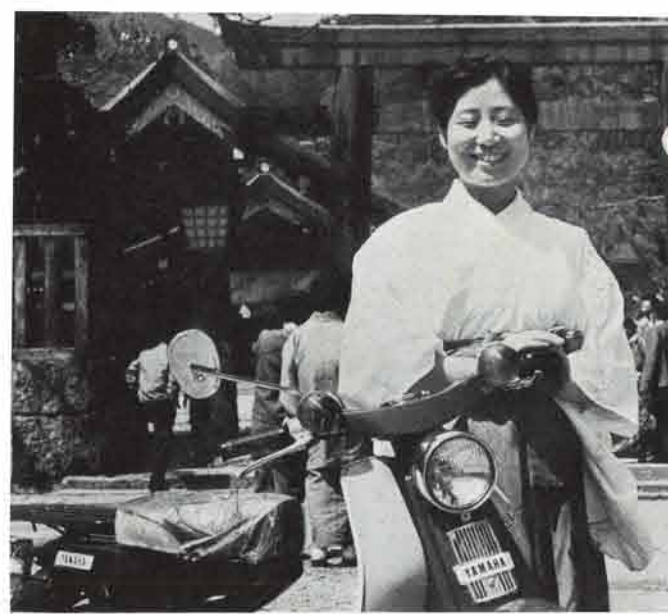
EVEN SHRINE MAIDENS RIDE YAMAHA's The maidens in the service of the Izumo Taisha, famous as the god of marriage, show their love for the YAMAHA 50.