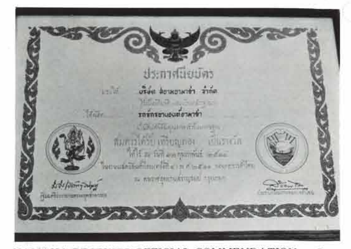
YAMAHA RECEIVES OFFICIAL COMMENDATION at Commodity Exhibition in Thailand. The Fourth Commodity Exhibition of Thailand, under the auspices of the Thai Ministry of Commerce and Industry, was held on the Plaza in front of the Imperial Palace in Bangkok. Siam YAMAHA was commended for its quality production of first class commodities.