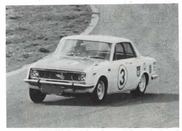
YAMAHA has taken charge of the production of all the TOYOTA sevens of the 3 litre prototype.