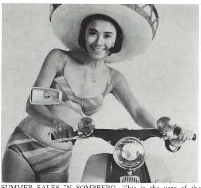
SUMMER SALES IN SOMBRERO This is the year of the Mexican Olympics. In commemoration, YAMAHA has launched a sombrero sale. It is expected that there will be an even greater increase in YAMAHA fans this summer.