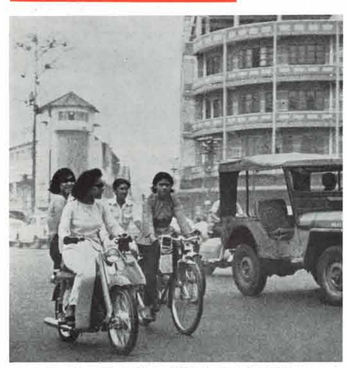
YAMAHA IN VIETNAM WAITING FOR PEACE Even in Vietnam, the land of disasters, YAMAHA is popular. Young girls dressed in "Ao Dai" are running their Yamaha Mates between the gun fire skirmishes. A snapshot of the Cholon District in Saigon where aggravated battles have been reported. With so many beauties, it certainly doesn't seem like war.