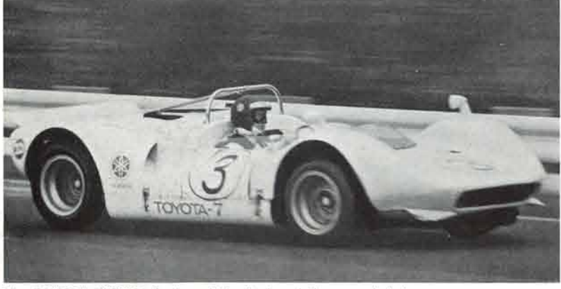
The TOYOTA 1600GT Engine which displayed the overwhelming power in the touring section of the Clubman Race is tuned up at YAMAHA.

same day, the 1600GT of YAMAHA tuning won an easy victory overcoming the 2000cc's of other manufacturers to the wild excitement of the spectators.