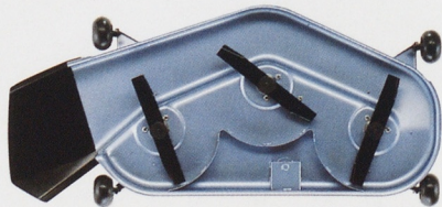
Triple-bladed, fully-baffled deck.

The easy on/off deck offers a Memo-Dial™ height control system with memory for easy, precise cutting-height adjustments. With triple overlapping blades, the