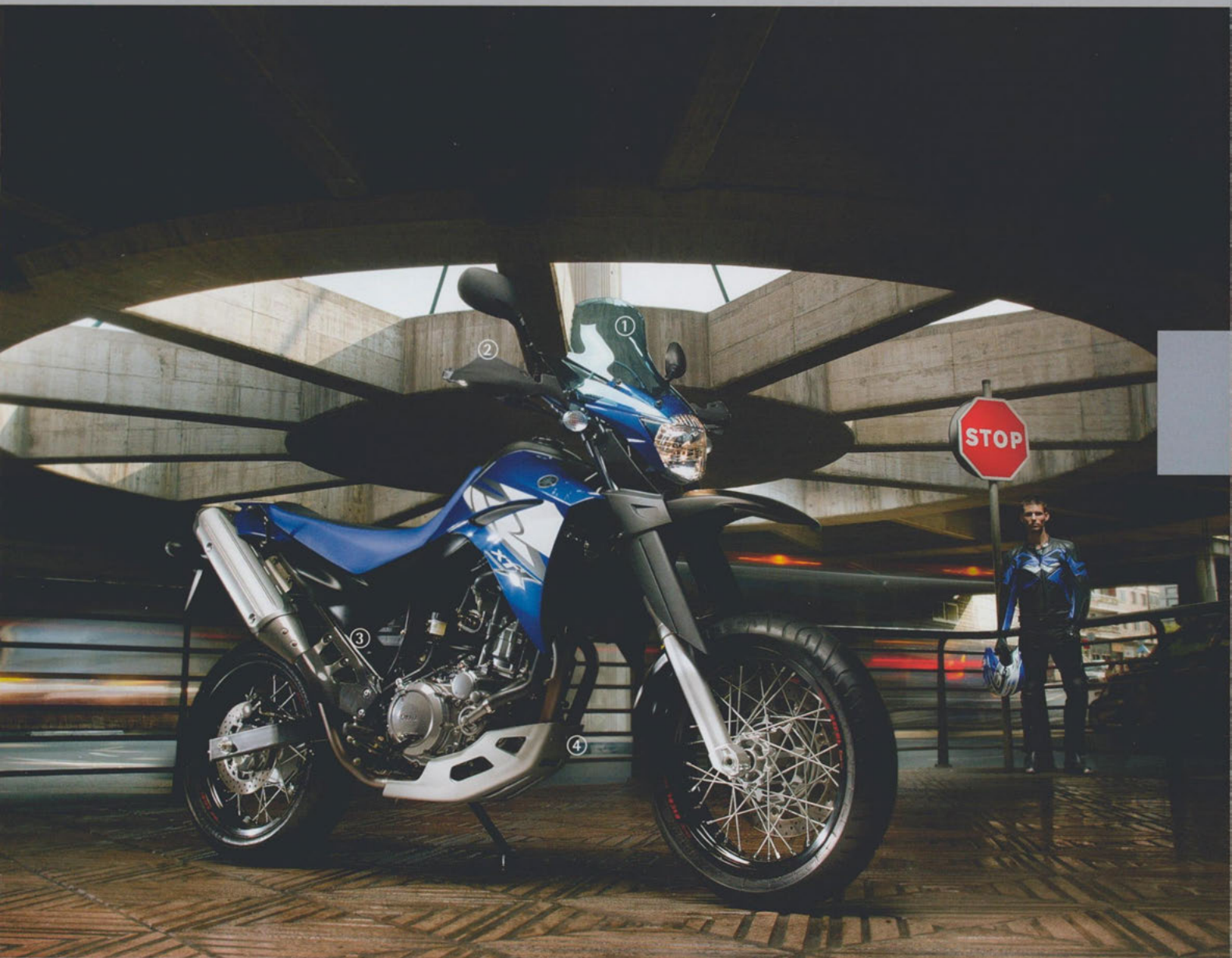
XT660X equipped with accessories