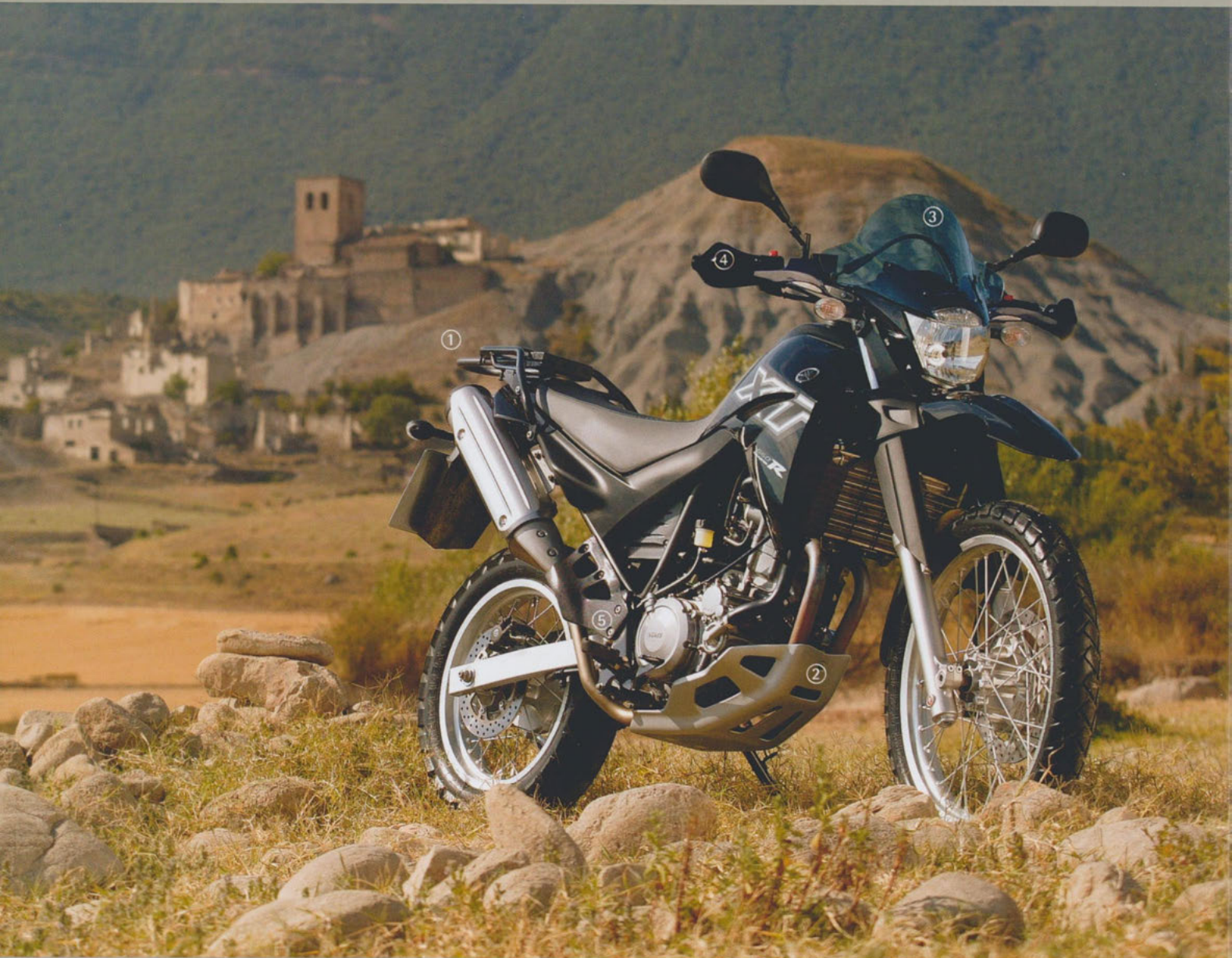
XT660R equipped with accessories