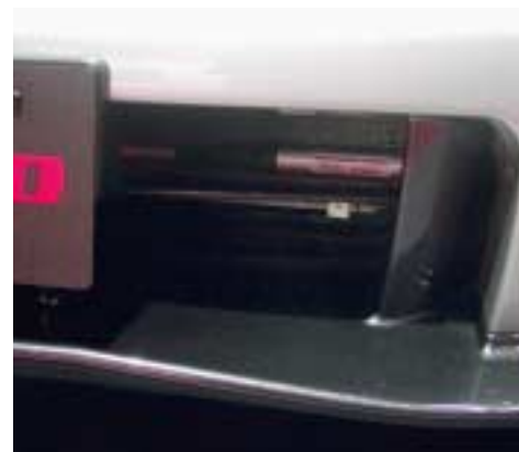
An example of a Performance Damper mounted on a sports car