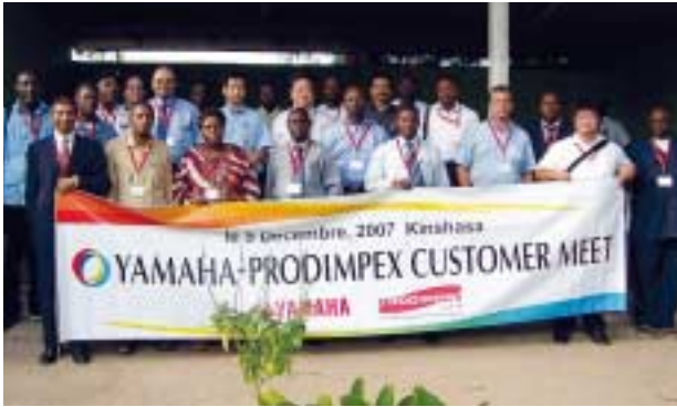
NGO representatives attending the customer meeting

On December 5, 2007, a Yamaha-Prodimpex Customer Meet was held in Kinshasa, Democratic Republic of the Congo for the first time as a chance to talk directly with NGOs that use various Yamaha products (motorcycles, outboards, generators, etc.) in their operations in the region. In all, some 30 client organizations attended and heard explanations on Yamaha products and the 3S sales and service network policy as well as past programs implemented to benefit the communities of the region. The meeting served as a ground for communication toward enhancing customer-Yamaha relations, where numerous questions and requests were exchanged to strengthen cooperation in the future.