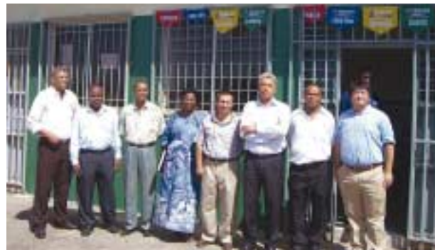
In front to the strategically located workshop at Praia harbor (3rd from right is the Minister)