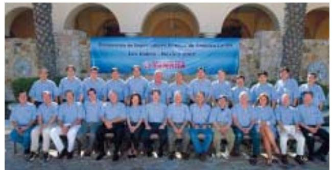
The Latin American marine distributor meeting looked to market growth

On November 9 and 10, 2007, representatives from ten Yamaha marine distributors in nine Latin American countries gathered in Los Cabos at the southern tip of Mexico's Baja California peninsula. Presentations were made on the Yamaha business vision for 2008 and reports were heard about each distributor's market conditions and business plans. All the participants were focused on ways to build on Yamaha's No. 1 position in the marine market in Latin America's growing economies.