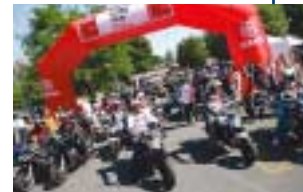
Customer events were held throughout Italy last year, attracting a total of more than 100,000 participants

For the first time in the last 15 years, Yamaha achieved top market share for annual motorcycle sales in the Italian market in 2007. Although the 2007 market saw tough competition, Yamaha made its position unique and clear, avoiding discounting for short-term return and investing instead in long-term customer satisfaction through retail network improvement (VI, 3S), branding commercials on TV and customer events. These efforts strengthened the Yamaha brand in the market, while some other brands lost brand equity by discounting. Now that Yamaha Motor Italia S.p.A. (YMIT) has confirmed the effectiveness of this policy, 2008 is the year to further strengthen this unique Yamaha direction.