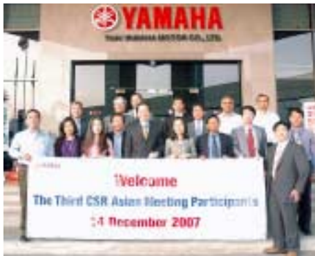
The group CSR representatives at the meeting in Thailand

On December 14, 2007, 14 CSR leaders from seven Asian Yamaha Motor group companies and first-time participant Yamaha Motor Australia Pty. Ltd. gathered for the 3rd CSR Meeting in Asia hosted by Thai Yamaha Motor Co., Ltd. (TYM) in Bangkok. The agenda included reviews and presentations of the newly undertaken 2007 CSR programs activities and presentations of the new mid-term plans starting 2008. There was also active exchange of opinions on shared risk issues, evidencing the progress made in risk management that the group companies in the past year.