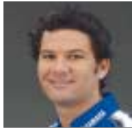
machine: YZ450F Chad Reed