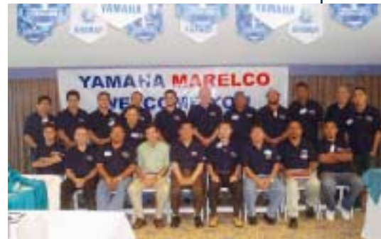
The attending service managers from the Central American Yamaha distributors (from seven countries)

Over the two days of November 6 and 7, 2007, the 3rd OMDO Central American Service Meeting convened in Belize with 22 representatives from eight Yamaha distributors in seven countries. Hosted by the Belize distributor Marelco Ltd., the meeting was an opportunity for the distributors to confirm the objectives of the 3S-based OMDO service strategy and share reports from each distributor on 2007 service activities results and 2008 plans for strengthening the service base. The active exchange of opinions and sharing of information made this a very fruitful conference for all.