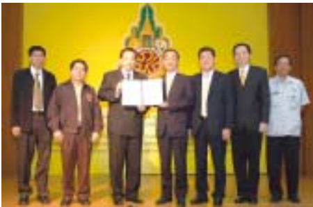
TYM management received the "TLS 8001:2003 Certificate" from the Deputy Governor of Samulprakarn province

As a part of the company's CSR (Corporate Social Responsibility) efforts, Thai Yamaha Motor Co., Ltd. (TYM) enhanced its human rights and labor standards by having its operations certified by the Labor Ministry's Thai Labor Standard (TLS8001-2003).