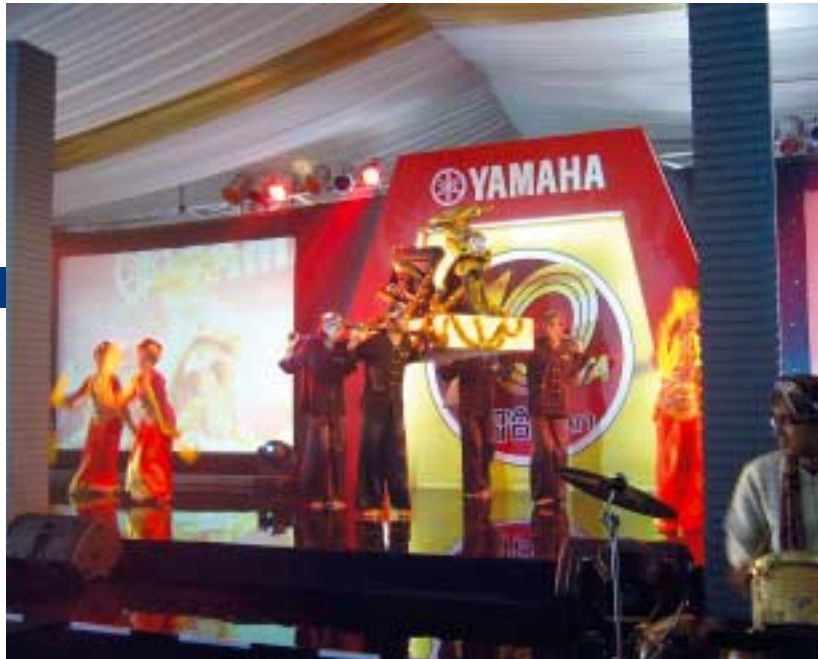
Celebrating the 10 million motorcycle production milestone at YIMM

In December 2007, Indonesia became the first of the Yamaha Motor group's overseas manufacturing bases to reach the grand milestone of 10 million units of total Yamaha motorcycle production. Yamaha Motor Co., Ltd. (YMC) began motorcycle sales in Indonesia in 1971, and in 1974 PT. Yamaha Indonesia Motor Manufacturing (YIMM) was established as a manufacturing base in Indonesia to increase the local production ratio. Growth in demand in the Indonesian market led to the founding of another manufacturing base, PT. Yamaha Motor Manufacturing West Java (YMMWJ), in Karawang in 2004. Yamaha motorcycles in Indonesia are currently manufactured by these two companies. At the ceremony held at YIMM in Jakarta on Dec. 6, 2007, everyone celebrated the great achievements of the 33 years since the founding of YIMM.