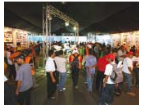
At the YAMAHA Gallery exhibit, visitors saw a display of the MotoGP racer YZR-M1 and imported sport bikes and the exhibits on the history of the ASEAN CUP and Yamaha production models from the ASEAN region.