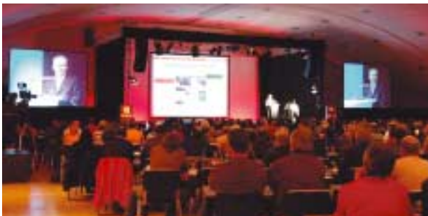
450 representatives attended one of the largest Yamaha dealer meetings ever in Europe