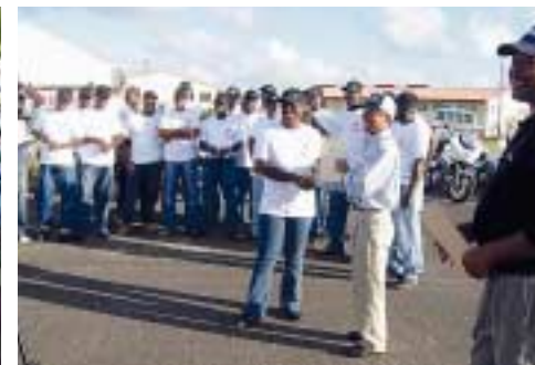
Participants in the St. Lucia course receive their completion certificates