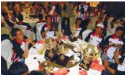
The borderless atmosphere of this competition was seen in the friendly exchanges between the rival riders and teams of the different countries at the event party.