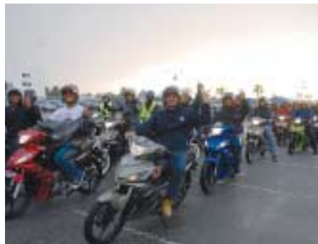
Many of the spectators came to the race venue on their own T135s (used in the Expert class) and T110s (used in the Novice class). Many said they appreciated the high performance potential these models shown in the races.