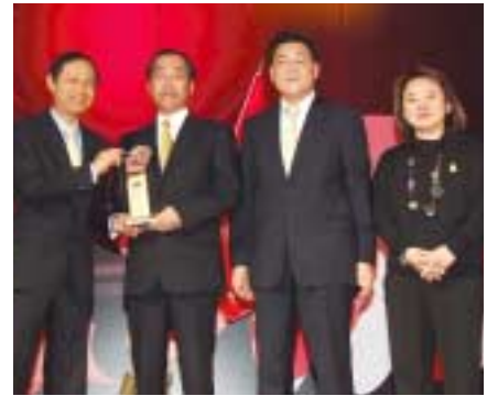
TYM top management received the Gold Award for Best Marketing Campaign

Thai Yamaha Motor Co., Ltd. (TYM) marked another significant milestone by winning the Gold Award of the Marketing Association of Thailand (MAT) for best marketing campaign in 2007. The marketing awards are given to the most successful marketing campaigns each year in three ranks: Gold, Silver and Bronze. Out of 16 candidate campaigns, TYM's "Born to be Different" campaign for the Yamaha Fino won the Gold Award for its ability to create a new market segment, for its creative communication strategy, excellent implementation and unit sales generation that have driven the big success of the Fino in Thailand's market.