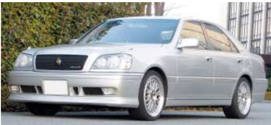
Yamaha’s Performance Damper was featured for the first time on the 2001 model Toyota Crown Athlete VX