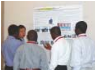
The panel explanation of Yamaha water purification system attracted Participants' attention