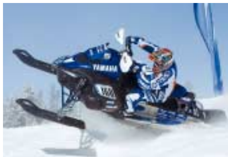
Cory missed round one with injuries but came back in round four to qualify and finish 13 th