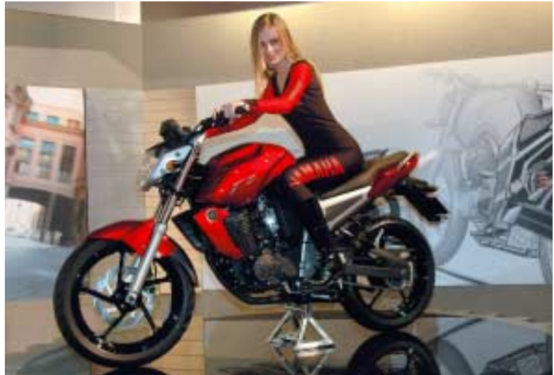
The new FZ got a great response