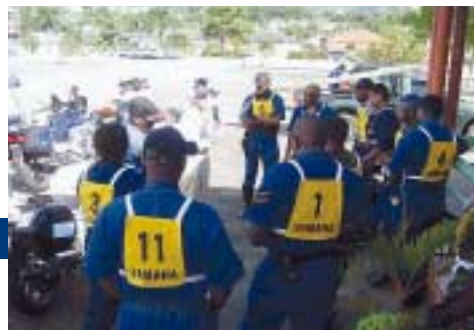
At the YRA course in Trinidad Tobago