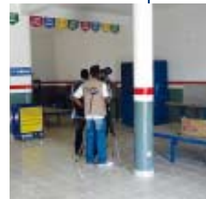
A TV camera crew films the interior of the main workshop facility

On November 22, 2007, the Yamaha distributor in the West African Republic of Cape Verde, S.A.T. Lda., celebrated the opening of two new workshops in the nation's capital, Praia. The opening of a main workshop in the capital and a smaller shop in the fishing harbor will bring service closer to the users. The opening ceremony on the 22nd was attended by Mr. Manuel Inocência, the Minister of State, Transport, Infrastructure, and Sea, and other distinguished guests who expressed their approval after a tour of the facilities.