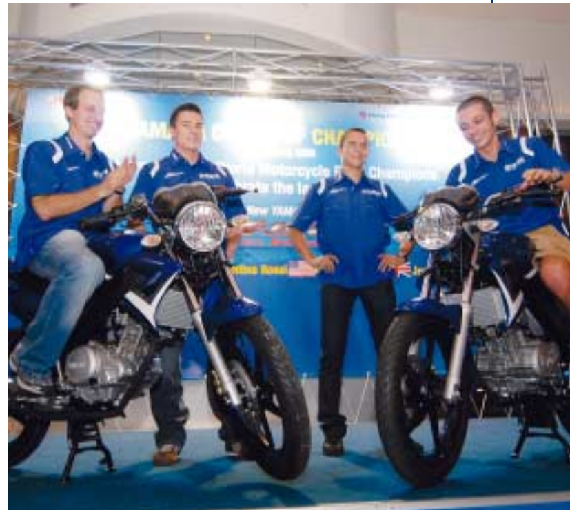
The four 2008 Yamaha MotoGP riders made a special appearance

On January 25, Hong Leong Yamaha Motor Sdn. Bhd. (HLYM) held an event at an Italian restaurant in the Malaysian capital, Kuala Lumpur, to give fans a chance to meet the Yamaha MotoGP stars and also put on show the newly launched road model FZ150i with a high-spec fuel injected engine. The FZ150i is the first 4-stroke 150cc fuel injected model locally assembled in Malaysia. The Yamaha MotoGP riders Valentino Rossi, Jorge Lorenzo, Colin Edwards and James Toseland, who were in Malaysia for the Sepang test session made special appearances to add another highlight at the product presentation.