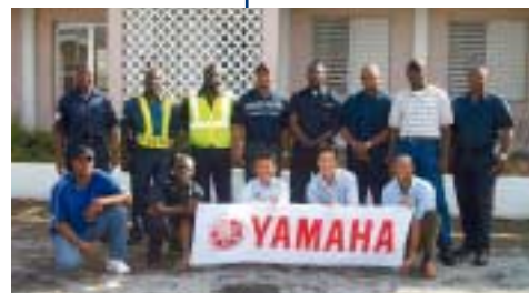
The instructor course participants in the Bahamas