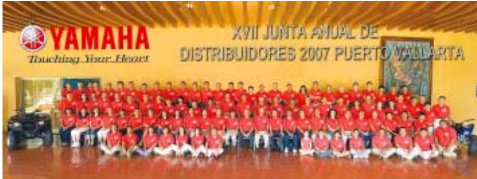
130 attended YMMEX's 17th Dealer Meeting