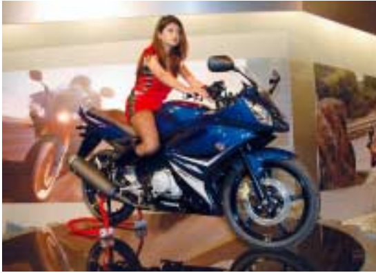
The new YZF-R15 was the center of attention