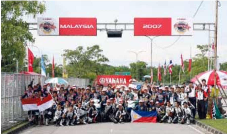
A total of 47 select riders from the five ASEAN countries of Indonesia, Malaysia, the Philippines, Singapore and Thailand competed in the Expert and Novice classes. Indonesian riders won both classes to give Indonesia the overall title for the second consecutive year and third time in the event's history.