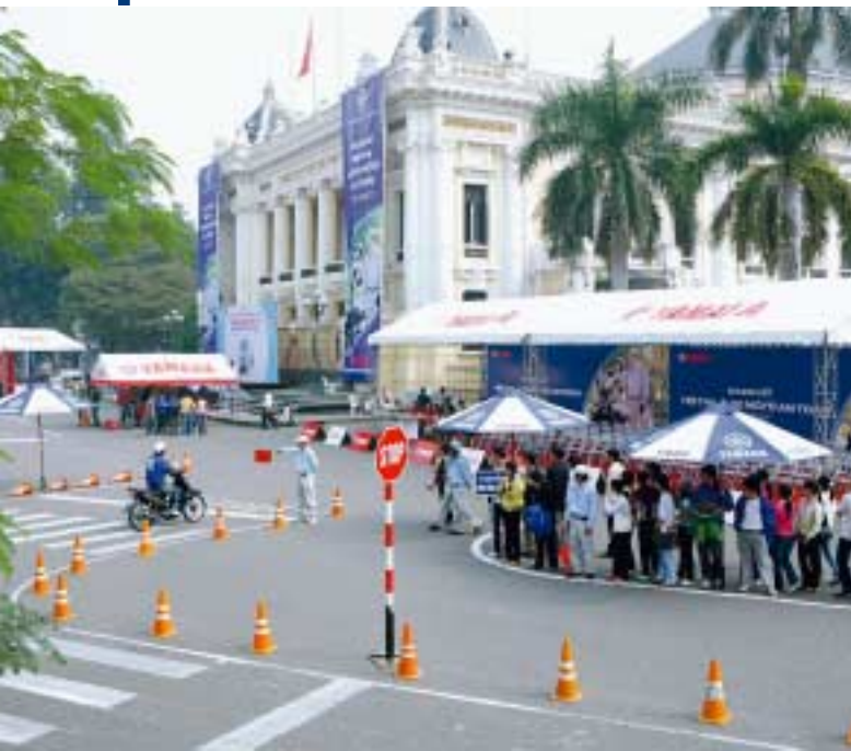
The Yamaha-sponsored Traffic Safety Contest was held in front of the Opera House in central Hanoi