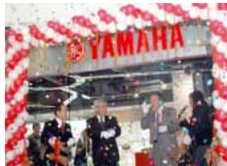
President Kajikawa was one of the top cutters at the opening of the first "Yamaha Bike Station" dealership in New Delhi

On January 10, the 9th Auto Expo 2008 opened in Delhi, and Yamaha mounted a prominent booth emphasizing the brand's advanced technology with a corner themed "The Art of Engineering" and making a strong appeal for the new face of Yamaha in India. The new models unveiled included the "YZF-R15" with its YZF-R series image, the "Gladiator Type SS/RS" and the "FZ." With the YZF-R15 being the first full-fledged supersport model to hit the Indian market and the other models and displays also drawing much visitor attention, the Yamaha booth drew large and excited crowds of visitors.