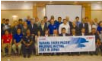
The participants in Yamaha South Pacific Regional Meeting

From May 22 to 25, YMC's Overseas Market Development Operations (OMDO) organized a meeting for distributors from the South Pacific region attended by 20 representatives from 14 countries. With its timely and detailed response to distributor needs and high-