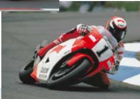
Wayne Rainey won Yamaha its 100th victory

The 9th round of the 2007 MotoGP series, the Dutch GP, was won by Valentino Rossi (Italy) of the Fiat Yamaha Team. This victory was the momentous 150th win by Yamaha riders in the premier class of World GP road racing (former GP500 class and current MotoGP). Yamaha entered its first World GP race in 1961. In 1973, Yamaha began competing with factory machines in the premier class, the GP500 class. Since then, numerous riders have won races on Yamaha factory machines, with the largest number going to Rossi at 28 wins, followed by Eddie Lawson (USA) with 26, Wayne Rainey (USA) with 24 and Kenny Roberts (USA) with 22. Yamaha is determined to continue its campaign in the world's premier class toward its 200th win and then its 300th and to continue bringing Kando * to motorcycle fans everywhere.