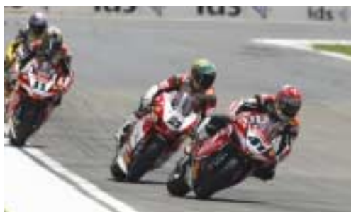
Leading the Yamaha riders, Haga is in 3rd position in the ranking, 45 points back from the leader

At the end of the ninth round of the World Superbike series, the Czech Round, the Yamaha Motor Italia WSB team's Noriyuki Haga stands in 3rd position in the season ranking and his teammate Troy Corser is in 5th place, with four races left in the season.