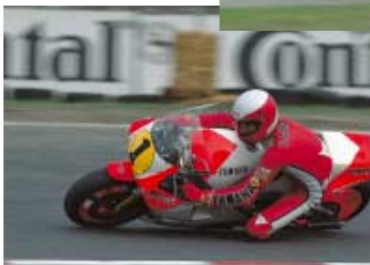
Eddie Lawson won 26 GP500 races on the YZR500, the record at the time