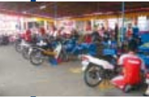
The YMKI free inspection campaign reached 100 locations nationwide