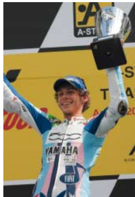
Rossi won Yamaha's 150th victory and he is expected to win more

* Kando is a Japanese word for the simultaneous feelings of deep satisfaction and intense excitement that people experience when they encounter something of exceptional value.