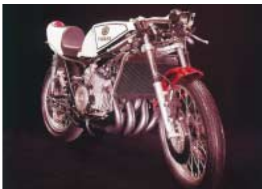
A GP500 factory machine