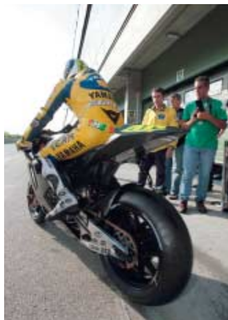
At the tests the day after the Czech GP in Aug. 2006