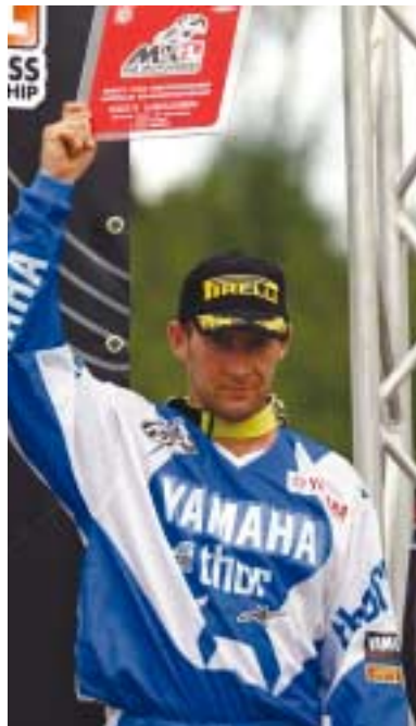
In the first 11 rounds of the season, Coppins has had nine podium finishes including five overall wins