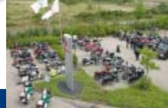
The Bundestag group visited YMG on about 200 bikes