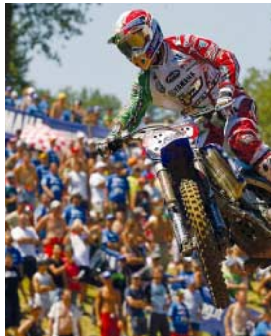
Yamaha and Cairoli signed a new 3-year contract for 2008 and beyond

By the end of round 11, Antonio had won an incredible 17 of the 22 heats competed in the first 11 GPs and stood atop the season ranking with a commanding 122-point lead over 2nd place C. Pourcel (Kawasaki). All eyes are on the amazing Cairoli express to see just how far and how fast he can go.