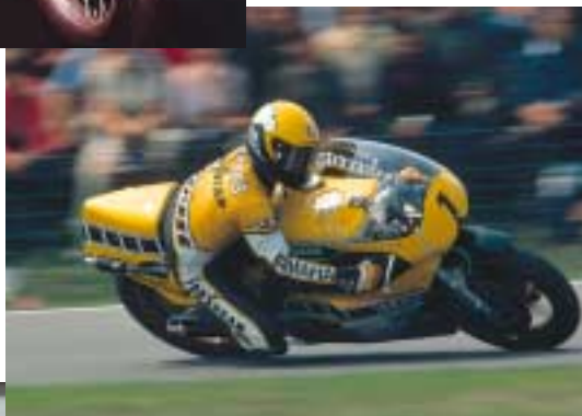
Kenny Roberts won three consecutive GP500 titles in 1978 - '80