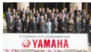
51 delegates from 13 nations attended the 9th Latin American Importer Convention