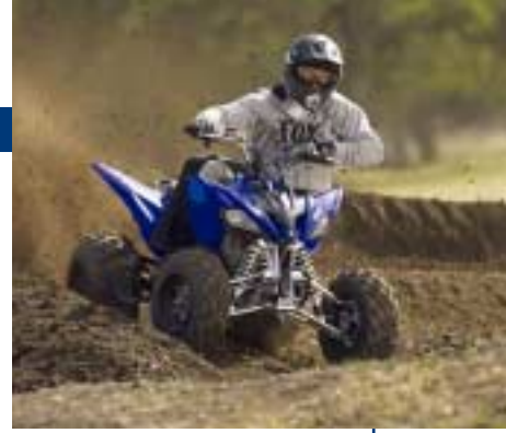
The Raptor 250 is built from the wheels up as a pure sports model