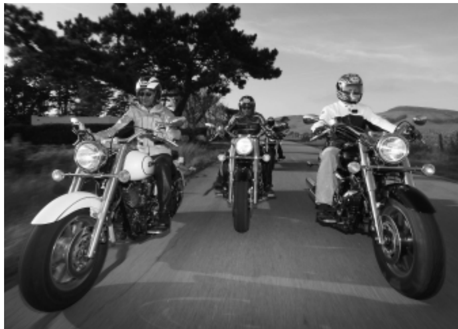
The New XV1700 Road Star drew consistently high praise from journalists

R egardless of the recent economic slowdown, the U.S. market for large-displacement cruiser type motorcycles has remained strong. And now Yamaha has a strong new entry to keep sales rolling. From May 3 to 12 Yamaha Motor Corp., USA. (YMUS) hosted a press test-ride event for the new Road Star XV1700 cruiser at the scenic resort area of Morro Bay on the California coast between Los Angeles and San Francisco. The event drew some 45 motor journalists from the U.S. and around the world anxious to try out the re-designed Road Star. Taking the existing XV1600 as its base the new Road Star XV1700 mounts an even more powerful 1700cc engine while at the same time brushing up the exterior specs considerably. The journalists were given free rein to put the new Road Star through its paces over a 250 km course that included both bayside