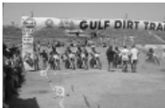
At the start of a practice run

In recent years there has been a growing interest in motor sports among people in India, especially in the country's southern region. The attention of young fans is focusing especially on motocross competition. On April 18, YMI showed that it is behind the sport all the way by holding a press launch event to introduce the riders and machines (YZ250F) of "Team Yamaha India" that the company will be giving its full support to.