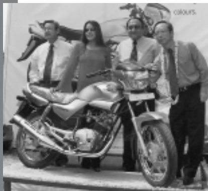
Film star Neha Dhupia will bring promotional glamour to Yamaha's new 2-wheeled star, LIBERO