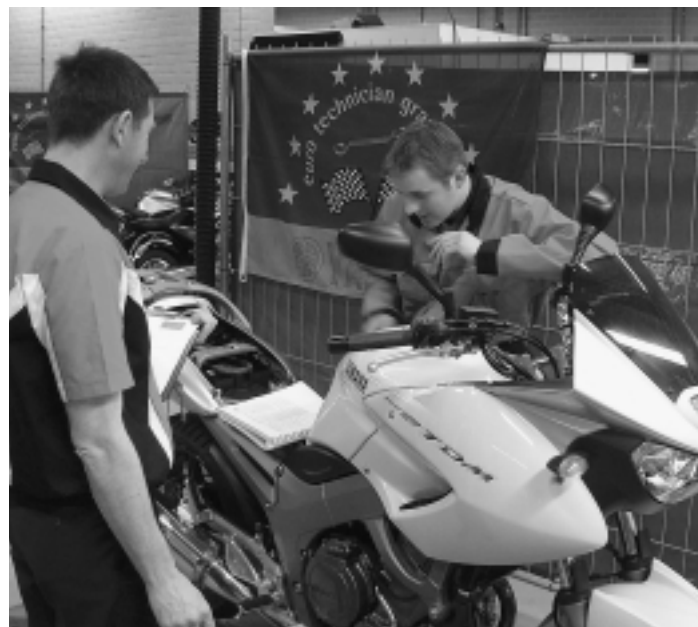
Contestants troubleshoot on the TDM900