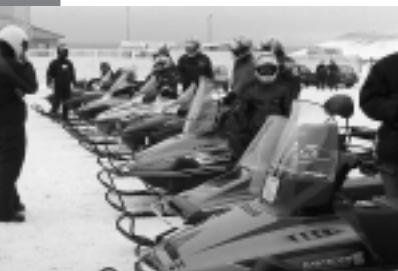
Many press and industry representatives got a chance to appreciate the product quality of the Yamaha snowmobiles

More and more people are discovering that the famous Russian winter isn't as imposing as it once was if you have a snowmobile. And YMC's Overseas Market Development Operations (OMDO) is out to make sure that people in the rapidly growing Russian snowmobile market get to know the outstanding product value and unsurpassed technologies of Yamaha snowmobiles.