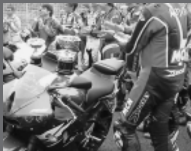
Riders celebrating their Masterbike results