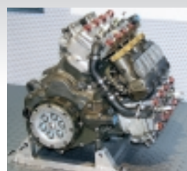
The first 2-stroke V-4 engine for GP500 (OW61)

In late June, an exhibition event titled “A Challenge to the Top of WGP Racing – The 30-year History of the YZR500” opened at the Communication Plaza at the Yamaha Motor Co., Ltd. headquarters. On display are a dozen YZR500 machines from over those three decades, including ones that won World GP championship