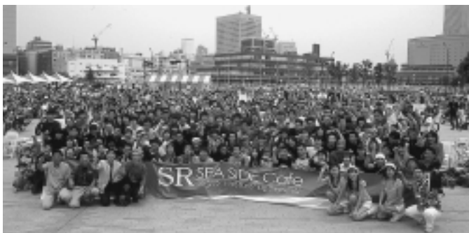
Many of the SR users today are younger than the model itself

Still, there were times during those 25 years when the proposal came up to stop production. But, in the end the ongoing SR popularity prevented it from happening. Even as the times brought high-performance developments to the motorcycle industry, the SR has kept a place of its own with its simple single-cylinder engine and classic good looks. This is what won the users, hearts and what made true fans who wouldn’t let the SR die for all those years. As the engineers who actually worked on the development of the SR remind us, a big part of a maker’s responsibility is to constantly develop and introduce products with innovative new technologies, but another part is to protect models like the SR that have won a devoted following among the users. They believed that the individuality of the SR is one more asset of the Yamaha brand, and an asset worth preserving. In today’s world where innovations in mechanisms and technologies often