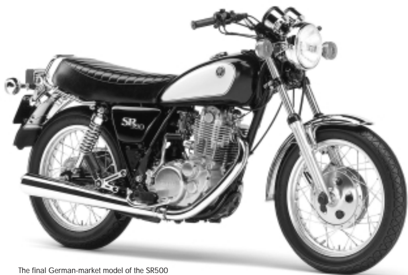
The final German-market model of the SR500

When the XT500 went on sale the following year, 1976, it quickly won high acclaim in markets everywhere. In Colombia, in South America, it was hailed as the “Rolls Royce of motorcycles.” And, what people inevitably praised was its smooth and linear power development characteristics and unique riding potential different from the multi-cylinder models. This XT500 also proved to be a winner in rally competitions. It soon became the machine of choice for French and Italian riders competing in beach rallies and the North African desert rallies that were becoming popular. When the Paris-Senegal rally was held in 1979, Frenchman Cyril Neveu would win on an XT500. This would prove to be the inaugural competition of the now-