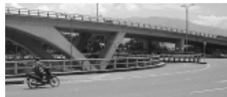
Stigmatization of motorcycle users negatively affect sales in the local market

Maintaining market leadership today is a great challenge. As a motorcycle marketer we have to face with creativity and enthusiasm the challenges of assertive competitors and the America's Free Trade Agreement (ALCA). For Incolmos-Yamaha, ALCA means we will have to compete directly in our local market with, for example, motorcycles assembled in Brazil, where larger production volumes could create an advantage in pricing strategies. There is also stigmatization of motorcycle users in the local market and, as a result, the authorities have often reacted by implementing legal procedures and actions, in many cases arbitrary, that negatively affect the motorcycle market. These actions have made it more difficult for people to take advantage of the benefits a motorcycle can offer and have also had a negative effect on the sales of motorcycles. Our competitors are increasingly more aggressive in their pricing strategies, discounts, and financing alternatives, which have permitted them to expand their margin in the market for economic motorcycle models for transportation and work