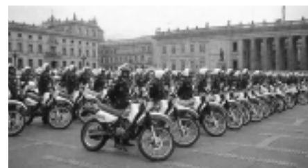
Police authorities often choose to carry out their duties on Yamaha motorcycles

In Colombia, the excellent performance of Yamaha motorcycles as transport vehicles often expands people's work possibilities, both on a personal or commercial basis. For example, in the cities of the coastal region many people have found a viable work opportunity as motorcycle-taxi drivers, offering passengers a very economical public transportation alternative to buses and taxis. In Montería, a city of