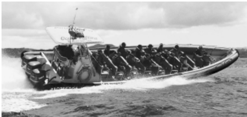
Fast, exhilarating and fun ocean rafting attracts not only Kiwis but also tourists

The "raft" is a Protector 12m RIB specially modified as a high speed adventure