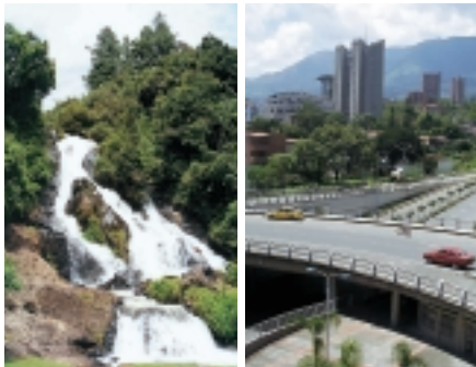
Colombia is a country of contrasts, charms and enchantments

Colombia has had important industrial development and its economy, contrary to some other countries in South America, now shows constant growth in the industrial sector, not only in the domestic market, but also in exports. Within this industrial sector the following industries can be highlighted: food processing, the textile industry, tobacco products, iron, steel and trans-