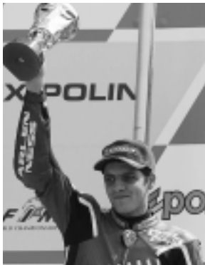
Barros mounted the winners podium with his 3rd-place finish

Round four of the series was the French GP at Le Mans. Here, Barros continued his