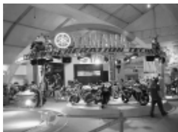
An appealing variety of models were displayed at the Thai Yamaha Motor booth