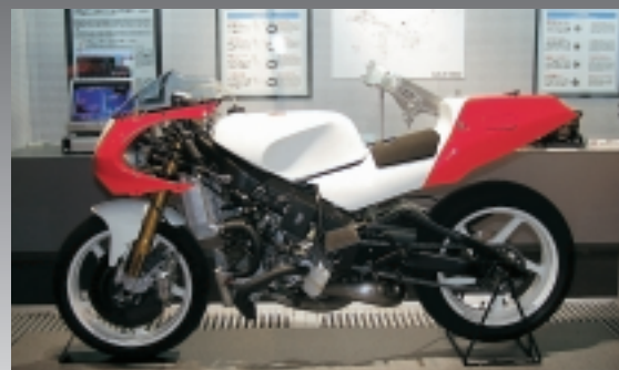
The prototype (OWE2) with semi-shared pivot axis that never saw actual GP action