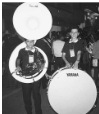
Incolmos-Yamaha is deeply involved in the cultural development of the country

Today Incolmos is the sales leader, but we know that difficult times lie ahead. To face them, Incolmos-Yamaha relies on the Spirit of Challenge that Yamaha is famous for and our experience of 25 years in the market. To this we add a new company vision and a business strategy that addresses the new business environment. With these we are confident that we can continue expanding the horizons of the Yamaha brand and our customers in the region.