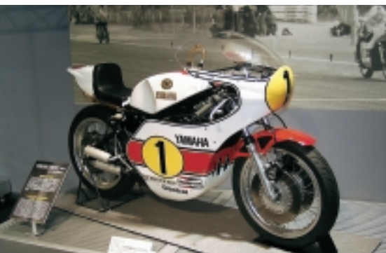
The OW23 was the first YZR with an engine designed specifically for the 500cc class

YZR500 to victory in a total of 115 WGP races while claiming 11 rider championship titles and nine manufacturers titles. And many of the technologies born of this ongoing challenge would eventually be fed back to Yamaha’s production motorcycles and other products.