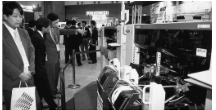
The latest model YG200 drawing lots of attention

T he Electronic Manufacturing Process Technology Exhibition (Protec Japan) is an event that showcases the latest state-of-the-art technology in the field of electronic circuit-board mounting equipment, the sophisticated industrial robots that drive the increasingly high-tech consumer electronics industry. Yamaha's IM Company is an industry leader in the field of mid-size surface mounters and visitors to the Yamaha booth at this year's expo grew by 25% despite an overall 15% drop in expo attendance on the whole. The highlights at the booth were the brand new YG200 and the industry standard Xg series models. The YG200 is the top-of-the-line model of Yamaha's series of mid-size module type high-speed surface mounters that with rapid technological advances in recent years have achieved productivity comparable to large-size high-speed models at a much lower price. With models like this, Yamaha is leading a shift in the industry away from large-size mounters to more versatile mid-size module-type models better equipped to handle today's rapidly diversifying production schedules.