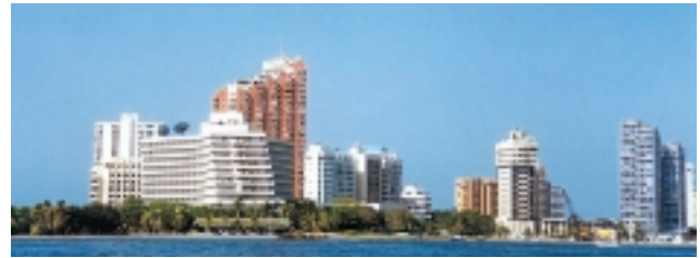
Cartagena, a city on the Caribbean coast of Colombia and an important maritime port

Colombia's ethnic mosaic is of course reflected in its culture and folklore. The different African, Spanish, and Indigenous roots have produced interesting fusions in all the forms of artistic expression in the country. Colombia has given birth to many great writers and thinkers, among them Gabriel Garcia Marquez, novelist and Nobel laureate in literature. It is also home of renowned painters and sculptors like