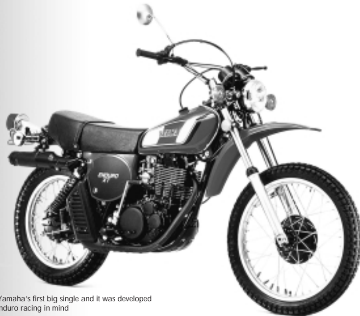
The XT500 was Yamaha's first big single and it was developed with American Enduro racing in mind

This year is the 25th anniversary of the birth of the Yamaha SR400, a milestone which has been commemorated with the release of a special 25th anniversary special edition of this long-selling model. In this issue of Yamaha News we will recount the story of the XT500 that was the predecessor to the SR400. The other story we have comes from a participant in the world-class SSDT trial competition in Scotland in May, where much attention focused on the Yamaha 125cc 4-stroke powered model called the Scorpa TYS125F. Both of these models have roots that go back about 30 years.