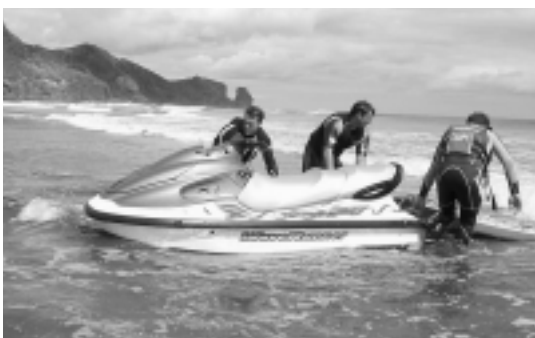
Surf Life Saving representatives evaluating the Yamaha XL WaveRunner 700 at Bethells Beach on Auckland's West Coast