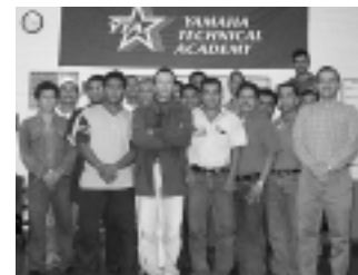
Colombia is the center of training for the YTA Program