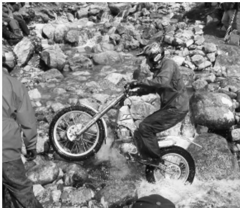
The SSDT competition in Scotland, birthplace of trial competition

Over the six days of the recent SSDT competition it has proven itself to be a machine that can take everything from wet rock sections to high-speed transition legs with no problems. And, I think a lot of the credit goes to