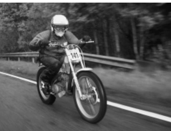
All the sections on the tough SSDT course are rock formations. Also, the transition legs that must be covered between sections are long and high-speed