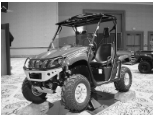
The 4-wheel drive Rhino pioneers a whole new category of ATVs