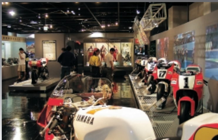
Fans filled the display galleries on the days they were open to the public