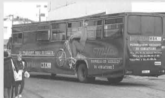
An advertisement is well placed on this local bus

has seen the entry of inexpensive models made in countries like China and India that are claiming an increasingly large share of the market. Unfortunately, at the moment, Yamaha does not market enough range of motorcycles in Africa to answer demand in this sector.