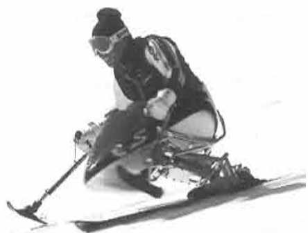
The new chair ski model for the 2002 Winter Paralympics debuted

The new chair ski model developed by the "S Project" team consisting of eight organizations and companies in which Yamaha Motor Co., Ltd (YMC) has played a leading role, has made its official debut at the 2001 Japan Paralympic Ski Competition held on March 9 at the Arai Mountain & Snow Park in Niigata Prefecture.