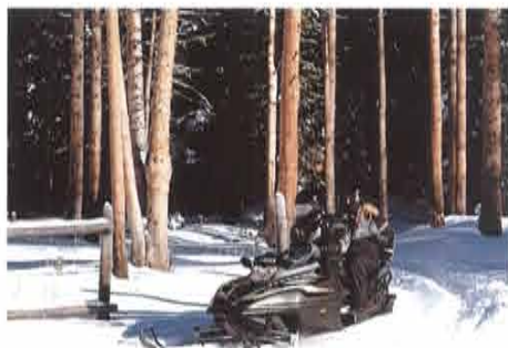
Many people love to go out touring on weekends in the winter months in the USA and Canada

The present worldwide snowmobile demand is said to be about 200,000 units annually, and North America claims the lion's share of that with some 65% in the U.S. and about 25% in the Canadian market. And, in the U.S. in particular, a large part of the demand comes from people who use snowmobiles to liven up those long winter months with sports or leisure riding. Here in the U.S., about 55% of the snowmobile demand is concentrated in the three