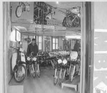
One of the MBK brand moped dealers in Morocco

Presently in Africa, the annual market demand for motorcycles in the high-end category stands at more than 40,000 units, and Yamaha holds nearly 50% of the market share in this category. However, as we have not concerned ourselves much with the entry-level category until now, this category