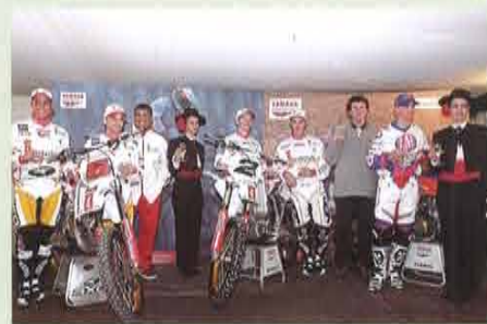
Yamaha riders were introduced with their new machines