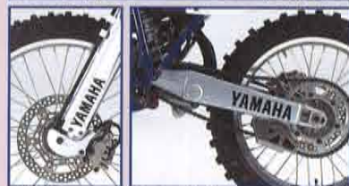
YZ250F's super-lightweight, compact liquid-cooled 4-stroke DOHC 5-valve engine delivers excellent power development (top). Large-disc floating type front brake (below left) and rear suspension components are adopted from its big brother, the YZ426F (below right).