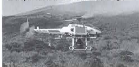
The Yamaha GPS Autonomous-flight Unmanned Helicopter made the second observation flight

and Transport landed on the now evacuated Miyake-jima island of Japan for observations of the recent volcanic activity of Mt. Oyama with an "Autonomous-flight Spec" modification of the Yamaha "RMAX" industrial-use remote control helicopter, originally developed and marketed for agricultural use.