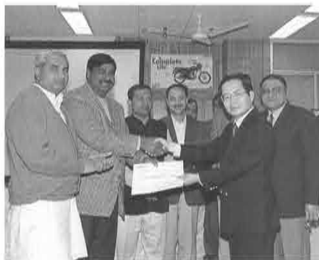
YMEL has contributed to the earthquake relief fund to aid earthquake victims and support their basic daily needs

On January 26, 2001 the state of Ahmadabad in India was hit by a devastating earthquake. Yamaha Motor Escorts Ltd. (YMEL) has contributed to the earthquake relief fund to aid victims of the earthquake and support their basic daily needs. The contribution consists of monetary aid equivalent to the total employee wages of YMEL staff for one day, million rupees; 20 YMEL-manufactured YD125 motorcycles to assist in transportation for victims and relief activities; and 40 Yamaha generators to give power to sufferers.