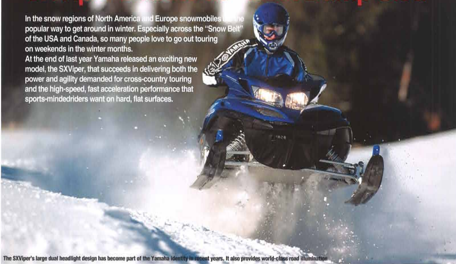
The SXViper's large dual headlight design has become part of the Yamaha identity in recent years. It also provides world-class road illumination.

At the end of last year Yamaha released an exciting new model, the SXViper, that succeeds in delivering both the power and agility demanded for cross-country touring and the high-speed, fast acceleration performance that sports-minded riders want on hard, flat surfaces.