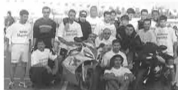
The charity event for the local community drew more than 1000 bikers