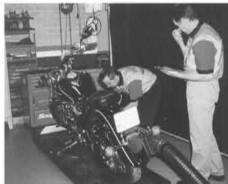
The contest was successful and the best three mechanics won their award and an invitation to the 2001 Pacific Grand Prix at Motegi!