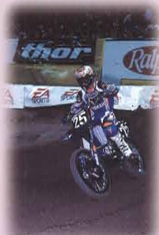
Ernesto Fonseca riding his YZ250F in the AMA Supercross series

The introduction of the YZ250F brings yet another exciting model to Yamaha's lineup of 2 & 4 stroke models. And as the 2001 racing season began, it's no wonder that the YZ250F is dominating winning circles all over the world.