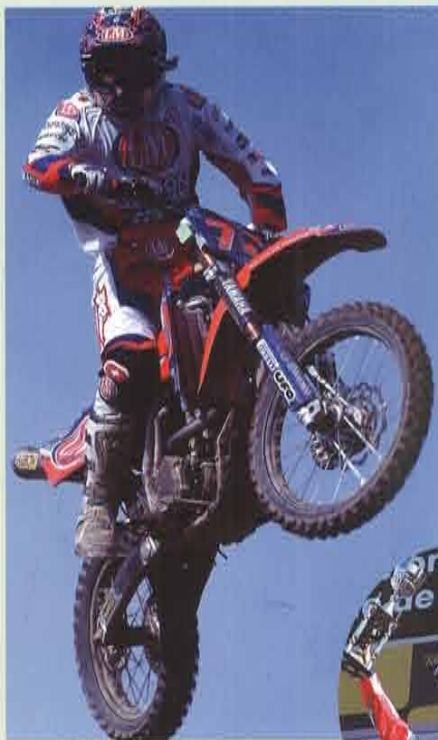
Everts won the first round of the WMX500 class with the new YZ500FM