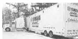
The "Yamaha SXViper Power Tour" was held at venues like snowmobile race tracks across North America. Customers were thrilled by the chance to test the actual 2002 model