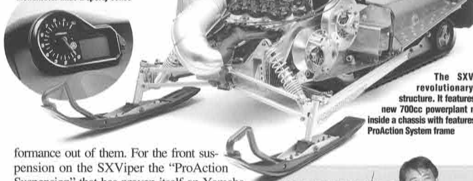
The SXViper's revolutionary body structure. It features an all new 700cc powerplant nestled inside a chassis with features like a ProAction System frame

formance out of them. For the front suspension on the SXViper the "ProAction Suspension" that has proven itself on Yamaha snowmobiles was adopted. On the rear suspension a new "adjustable control rod" was adopted. This is a suspension mechanism that incorporates a special spanner that makes it possible for users to either fine-tune the pitching control of their rear suspension to give greater chassis stability on rough surfaces and agility in cross-country riding, or adjust to get the optimum in weight-transfer effect to enjoy dynamic straight-line acceleration and top speed performance.