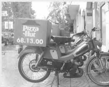
Mopeds are even used for pizza delivery

also because of a well established budget credit system for purchasing mopeds, this country has become one of the biggest markets in Africa. With a line-up of seven models, mopeds of the French Yamaha group company MBK's brand presently enjoy a market share of about 60% in Morocco. And, the fact that the country's Yamaha distributor, MIFA, opened a factory two years ago for CKD production of these models has further enhanced the brand's position as market leader. This success in the moped business has inspired us to expand the moped market worldwide.