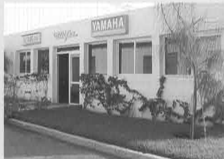
MIFA's moped factory complex