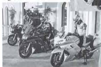
Journalists were quite impressed by the new Yamaha machines

of their test on the pages of motorcycle magazines in the coming weeks.