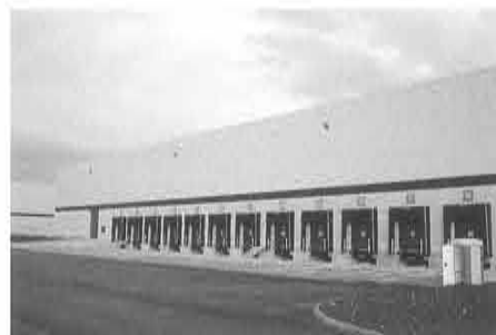
The second European parts distribution center was established in Lyon, France