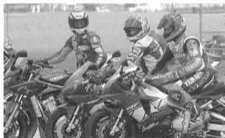
The champions rode Yamaha R1 and FZ1 motorcycles and made a parade