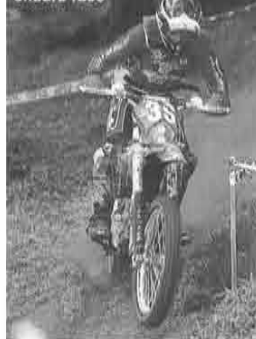
YZ250F riders won the one-through-four at the Australian enduro race