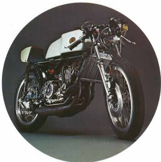
Fabulous water-cooled 350cc works machine