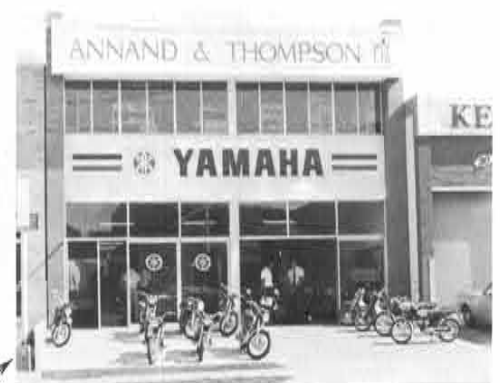
Annand Thompson Pty.