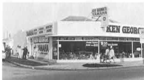
Ken George Distributors Pty.