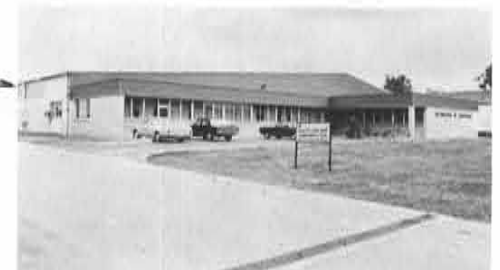
McCulloch of Australia Pty.