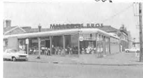
Milledge Brothers Pty.