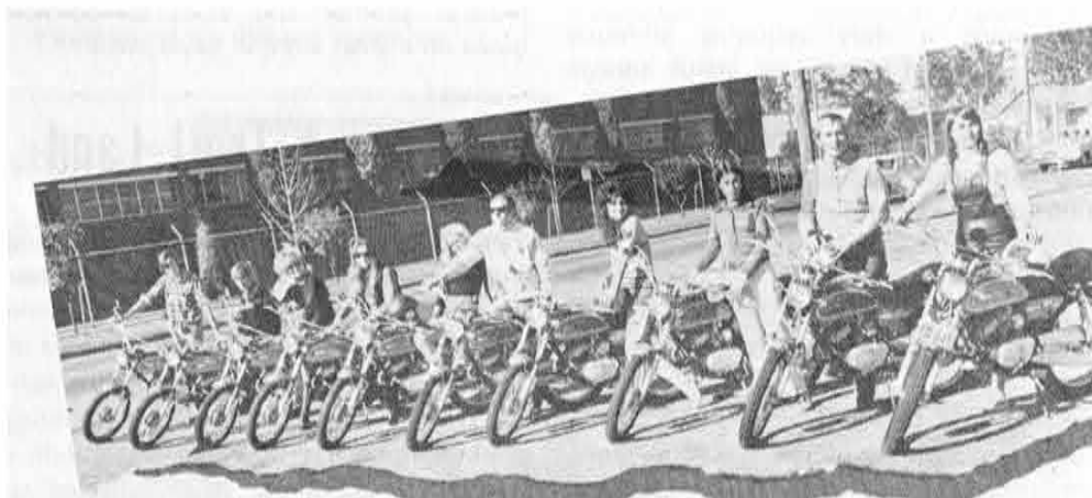
Fares crisis triggers off great new Sun Yamaha Channel 7