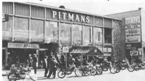
Pitmans Motor Cycles Pty.