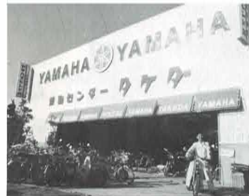
1. Spacious shop front, (above) 2. Unique display stand, (left)