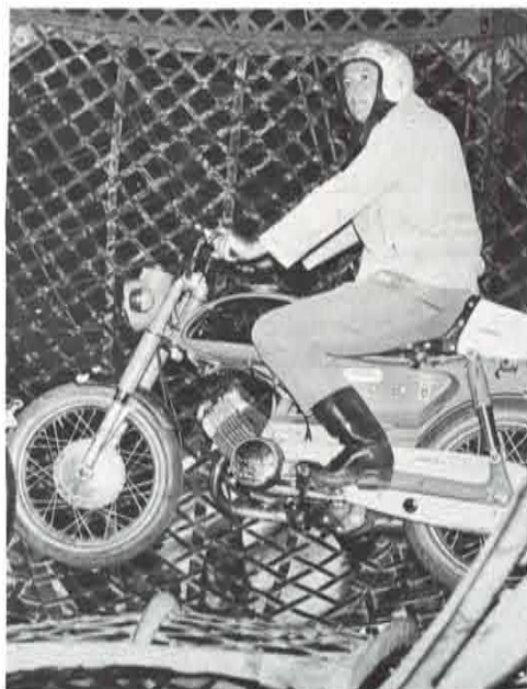
Lightweight Yamahas also play a major role in circus shows.