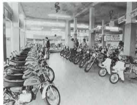
The inside layout is impressive enough to attract a lot of young enthusiasts.