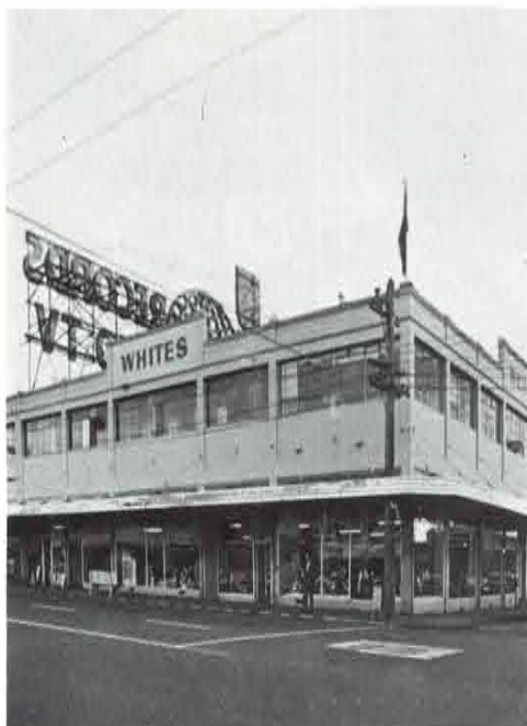
W. White Ltd. is steadily enlarging the market share of Yamaha motorcycles in this part of the world.

New Zealand is a very promising market for Yamaha motorcycles. W. White Ltd., Yamaha distributor in Auckland has recently established a new impressive showroom of motorcycles to further expand business. New Yamahas which are arrayed over a spacious floor, draw particular attention of the sport-loving youth.