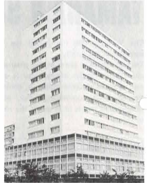
Office building of Yamaha Motor N.V.