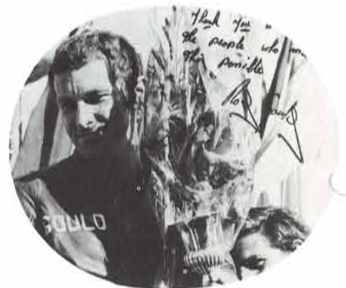
R. Gould won the 1970 world championship riding a 250cc Yamaha. He is also making a tough bid for this year's title.

Motorcycles and mopeds on the land, and outboard motors on the water, Yamaha products are becoming progressively popular in both fields. Snowmobilies on the snow are exciting, too. Once I have sampled it, and the experience was really impressive. If our country were snowy like Sweden or Denmark, I could use a Yamaha snowmobile daily as a commuting vehicle on the snow.