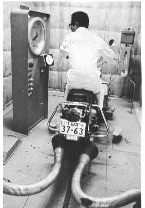
The chassis dynamo meter is a unique equipment first ever employed in the facility of the kind.