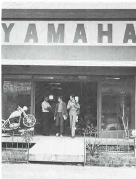
Dino Motor in San Paulo is always brisk with young enthusiasts.

Yamaha motorcycles prove often the most successful make at big racing events, which directly combines with sales promotion. The picture was taken immediately after the prizegiving ceremony of the '71 Interlagos 500-mile race.