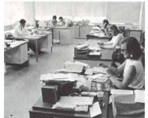
The inside office is well designed for the improvement of working efficiency.