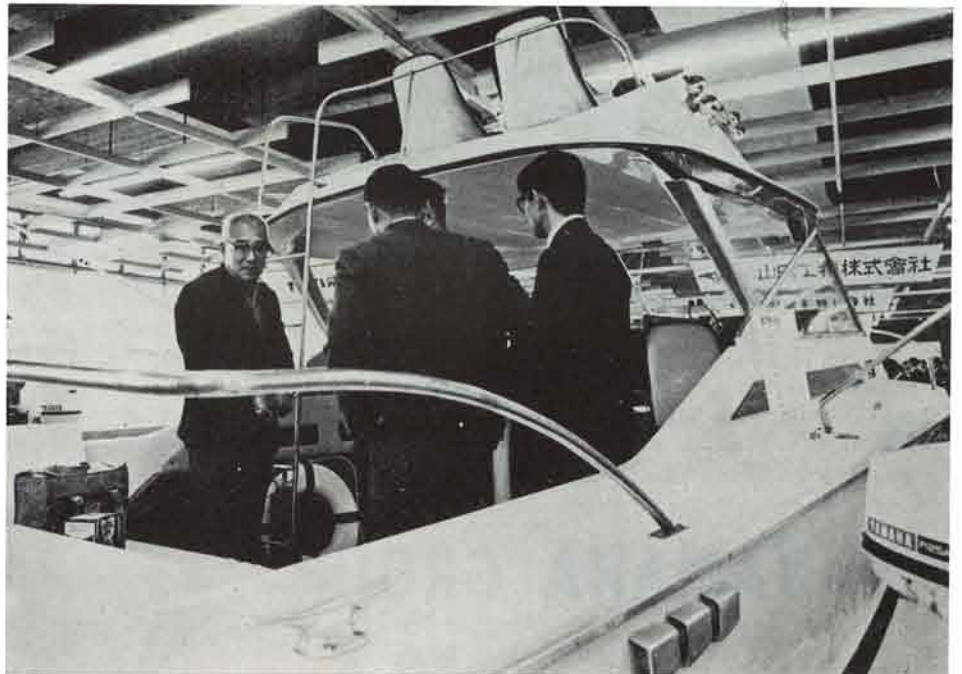
YAMAHA Stripe 25, the Sport Fisherman alone in the show boasted a fly bridge.

In a water tank costing ¥ 1,000,000 (about $ 2,800) to construct, the outboard motors were churning the water to draw the breathless stares of all.