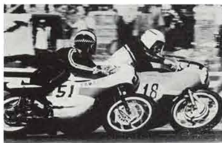
Yamaha R1 racer in the struggle with a giant Harley-Davidson—with engine more than twice as big as the R1.