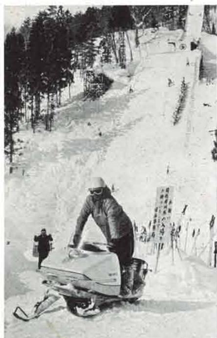
The Snowmobile played a vital part in getting the course in shape for the ski race of the National Sports Meet.

Phil Read, the ace of Yamaha, rode his fantastic machine to victory at the Spanish Grand Prix, the second round of the world motorcycle championship series, held at Mont Juich, Barcelona, on May 5th. The win assured Yamaha of a sweeping victory in the Grand Prix series of this year.