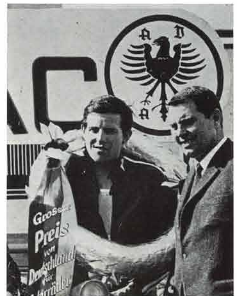
125cc Race Commendation Ceremony

In the 250cc race, Bill Ivy, the 1967 125cc G. P. champion, breezed off in a big way to victory at an average speed of 141.4 km/h, improving a record of 135.2 km/h set by Phil Read in 1965. Bill Ivy also clocked the fastest lap time of 3 min 13.4 secs at 144.2 km/h, beating Phil Read's 1965 record lap 3 min 19.6 secs at 138.7 km/h.