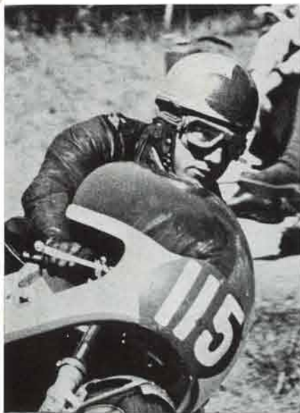
Bill Ivy winner of the 250cc race

The 1968 Grand Prix series opened with the German Grand Prix held at Nurburgring on April 26.