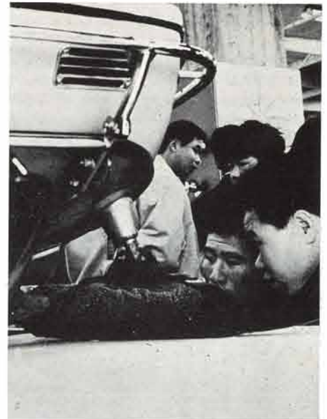
The YAMAHA Snowmobile, most talked about topic of the winter, was also among the exhibits.