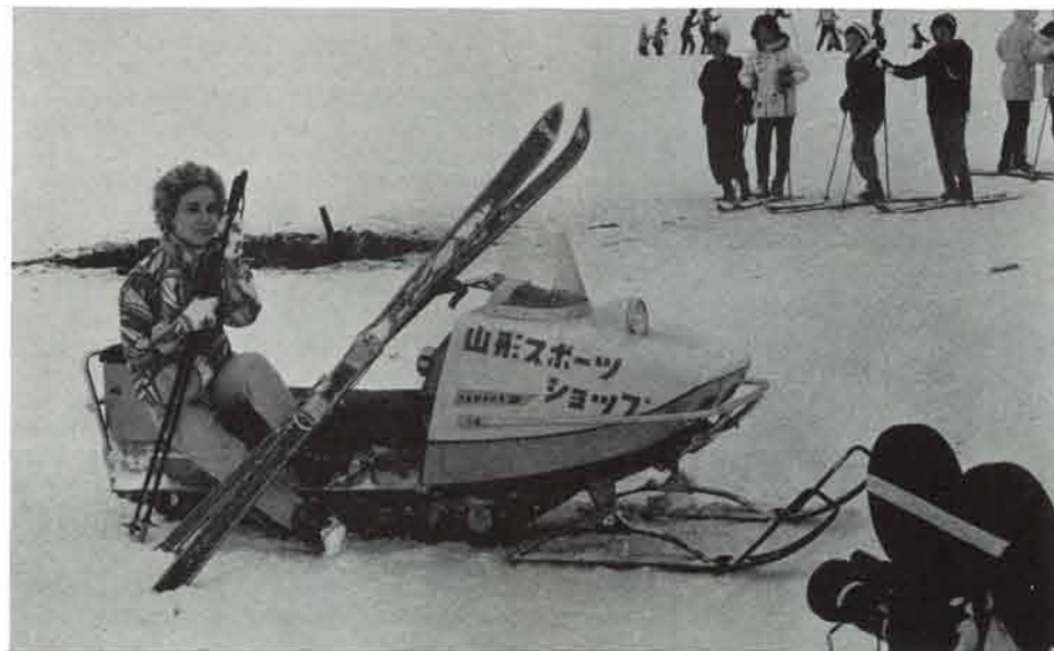
Entertainment stars participated in the Snowmobile show runs with tremendous PR effects.

tion to snow travel. With sales for this season just ahead, the Snowmobile is becoming even more popular and it is anticipated to attract an explosively large number of purchasers.